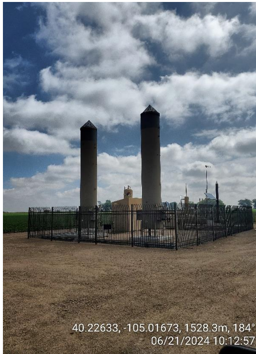
ECD and Vert Separator