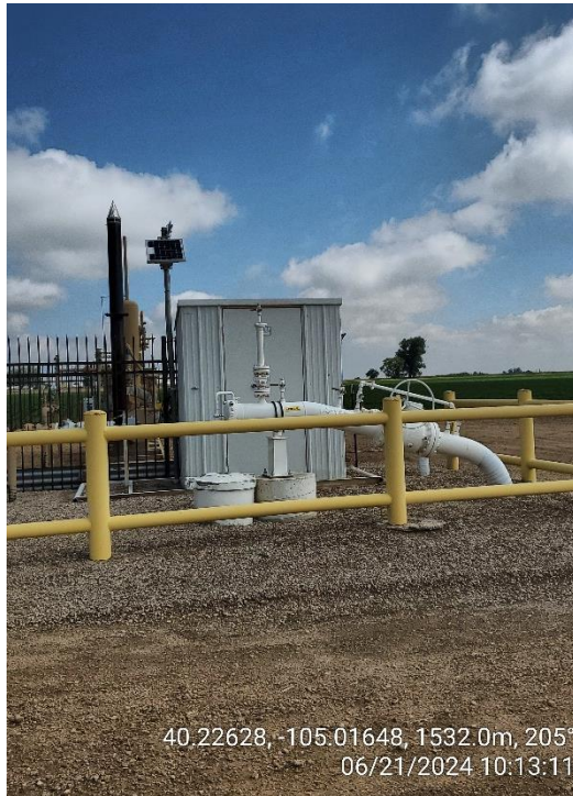
GMR and Pig Station