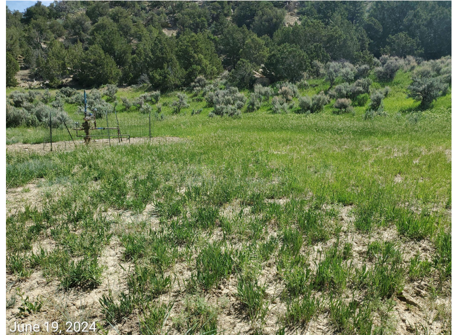
Photo 1: Photos 1-2 taken from the west end of the Location. Photos provide an overview of the Location from north, northeast, southeast to south.