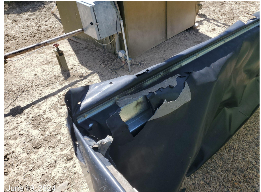
Photo 4: Produced water tank at battery facility. Capacity information not observed on tank. Photo right shows liner at battery in disrepair.