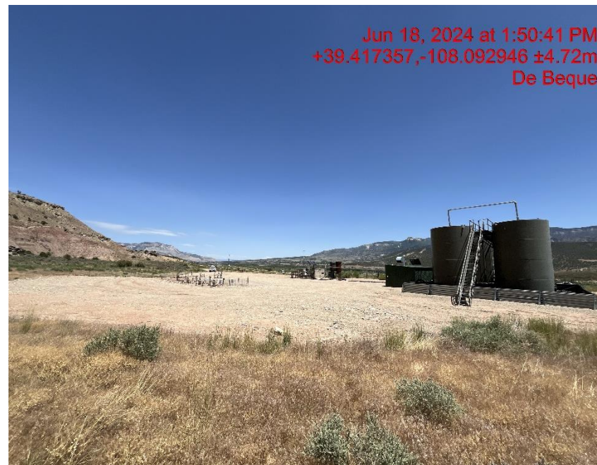
Southwest corner of location - Photo #02652