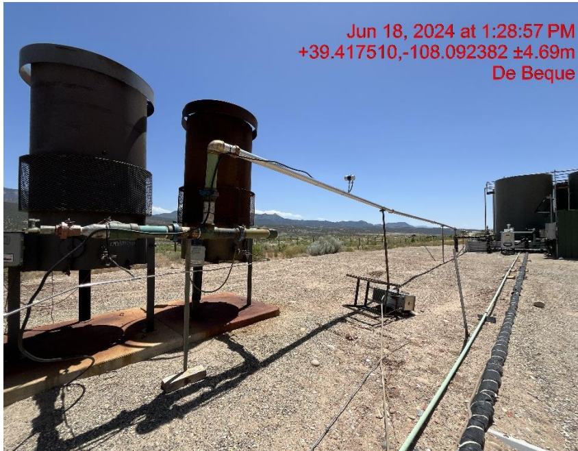
ECD's - Photo #02627