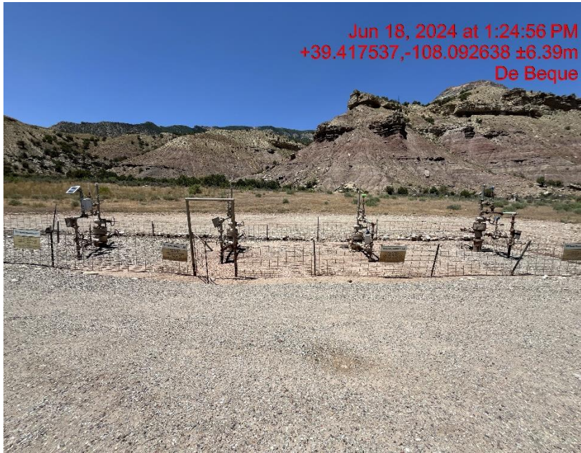
Well heads - Photo #02620