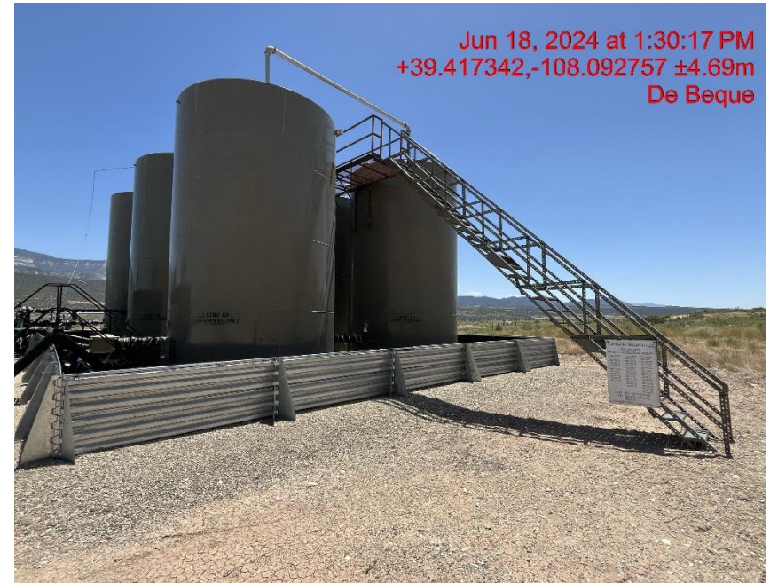
Tank battery - Photo #02632