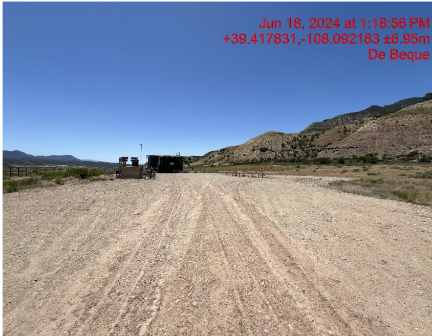
Entrance to location - Photo #02619