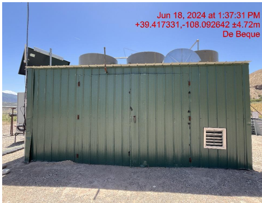
Pump station - Photo #02645