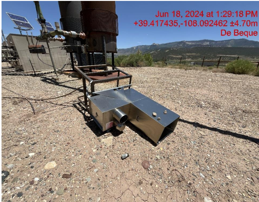
Fire/Safety Hazzard - Photo #02630