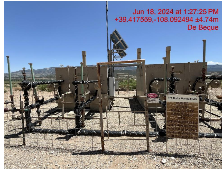
Separators - Photo #02624