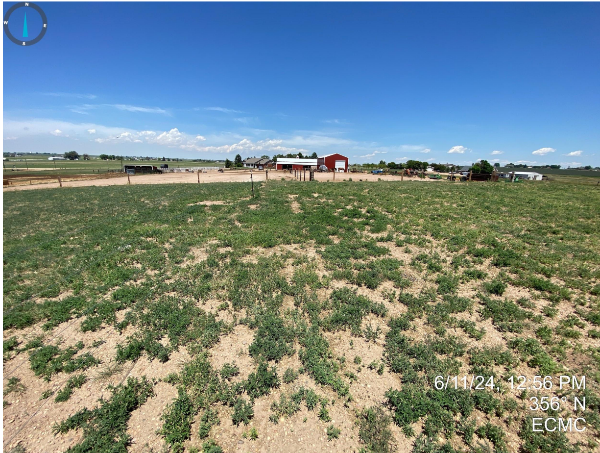
Photo 1. Facing north. The former well location is predominantly undesirable vegetation (kochia). Additional reclamation activities are required to establish vegetation with total perennial, non-invasive uniform plant cover of at least eighty (80) percent of reference area levels.