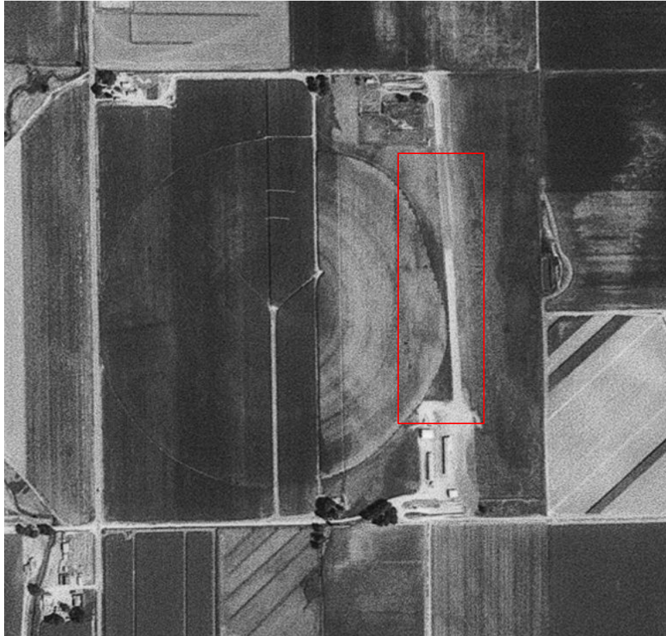
Photo 6. Aerial imagery taken 09/07/1978 illustrates that the access road did not exist prior to oil and gas development in the area.