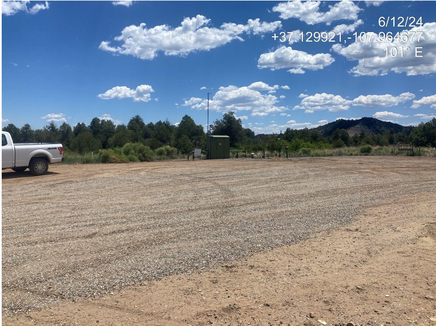
Photo 2. Rutting/Stormwater corrective action identified in the previous inspection doc #714000532 has been addressed/resolved.