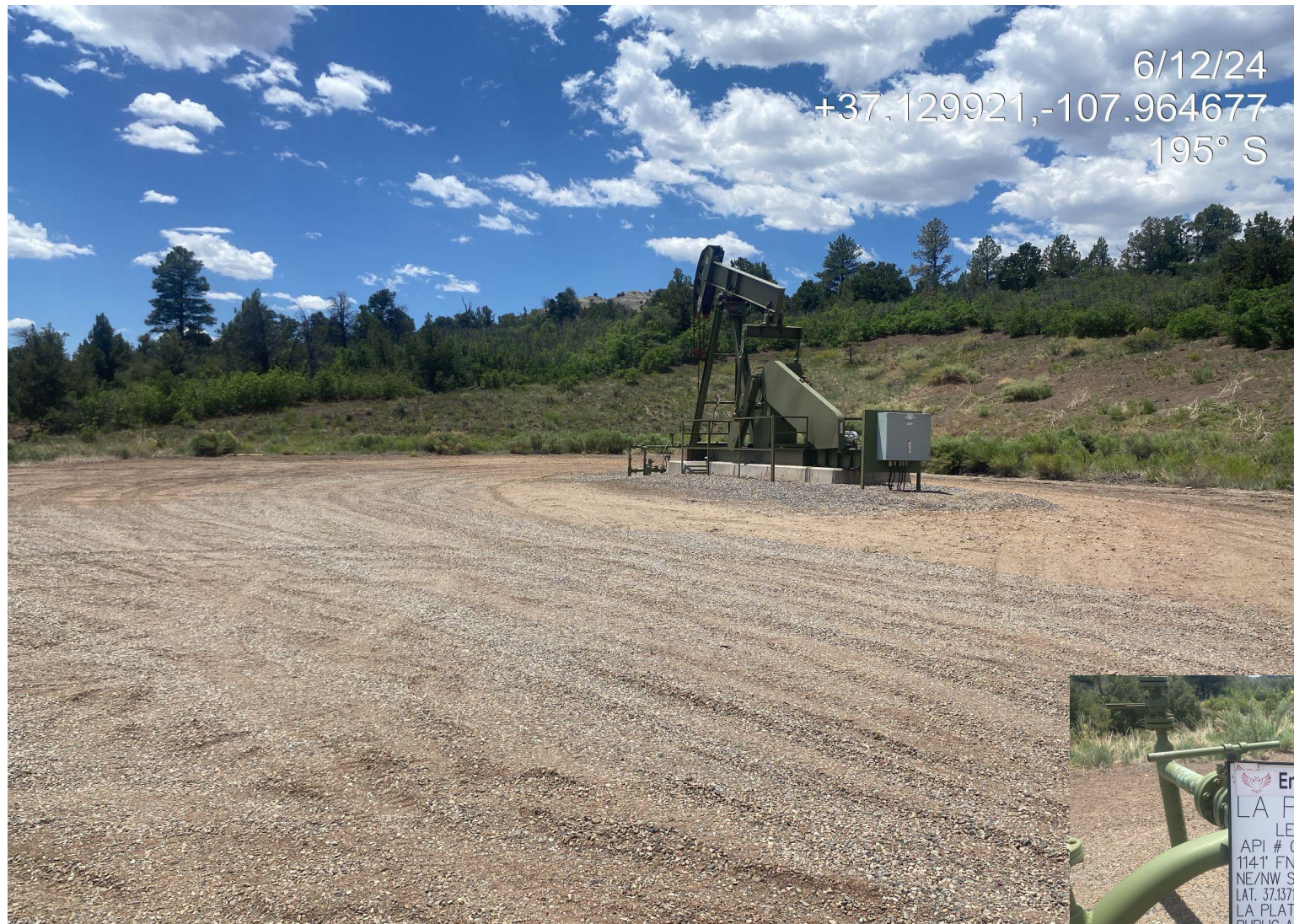
Photo 1. View of the well disturbance taken from the access point facing center.