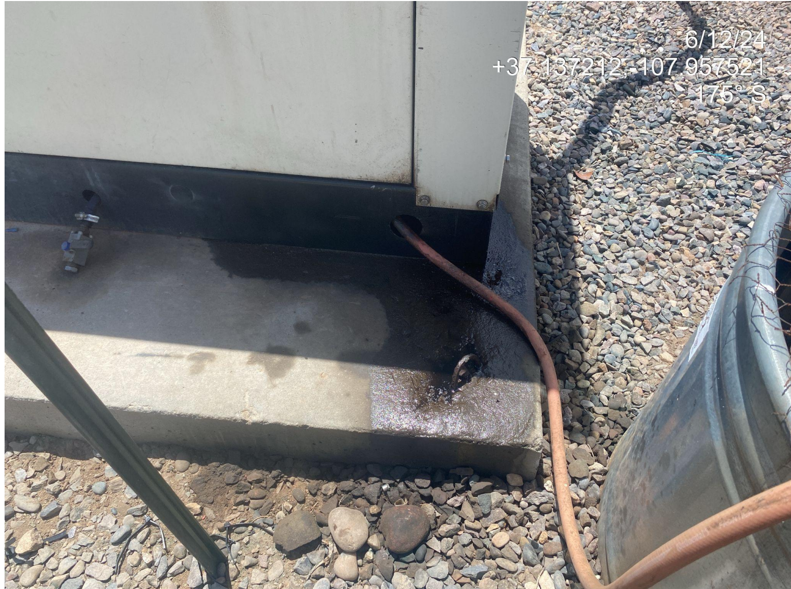
Photo 4. Oily substance and impacted soils observed at the generator in the northeast corner of the disturbance.