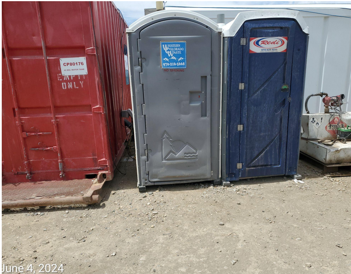
Photo 11: Example of Porta-johns on location. Facilities have not been physically secured.