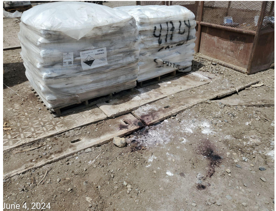
Photo 7: Photos 7-8 examples showing material spills. Spills requiring cleaning.