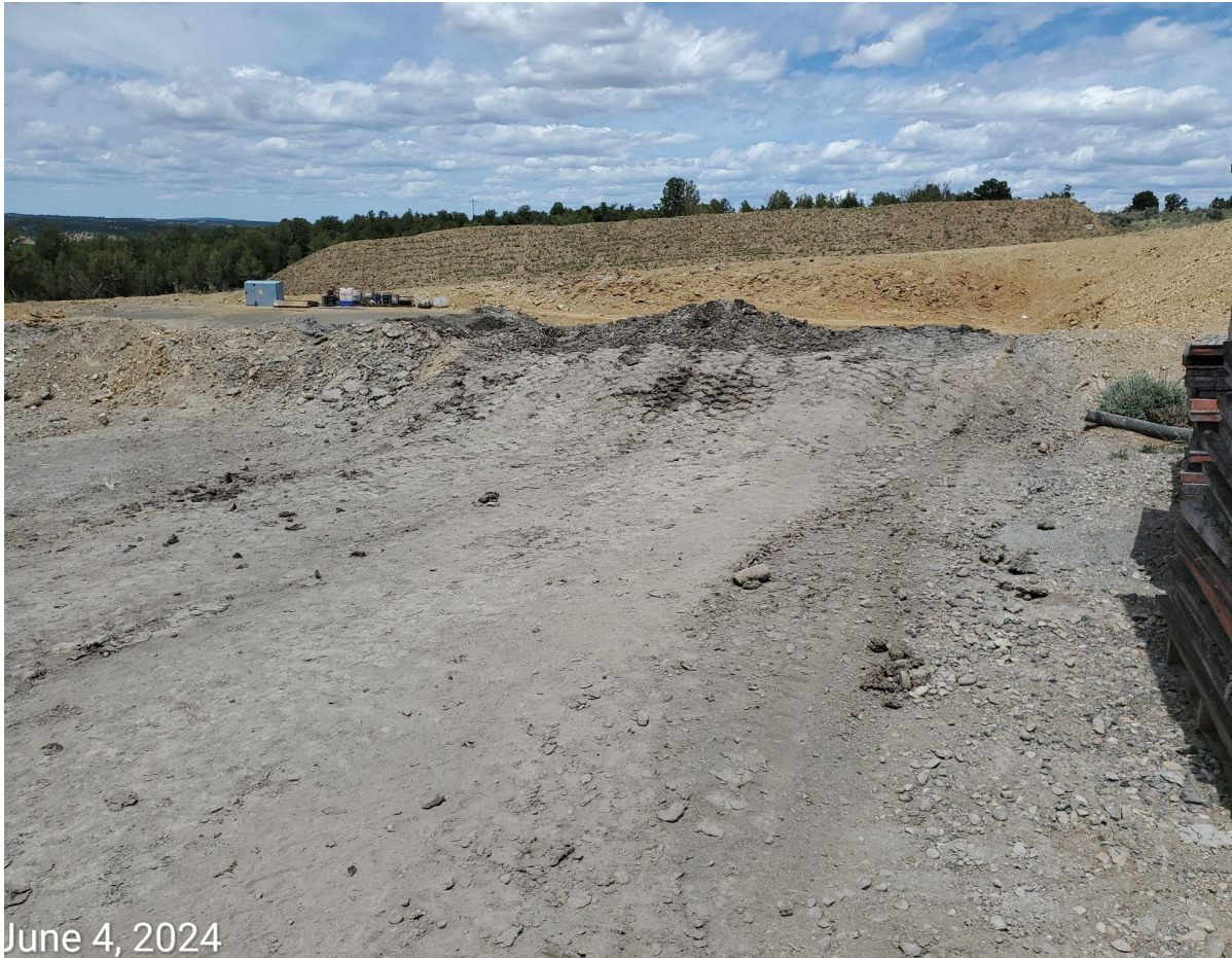
Photo 3: Continued from photo 1. Photo shows areas where drill cuttings are being dumped over the cut slope above the cuttings trench. Drill cutting material is also being spread over the WPS of the Location and tracked off-site.