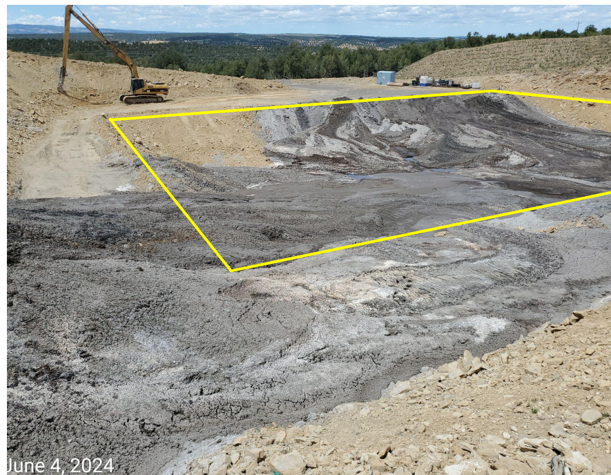
Photo 1: Photo taken from the top of the cut slope above the cuttings trench, on the south end of the Location. Cuttings are not being placed directly into the cuttings trench. Rather, cuttings are being dumped over the cutslope near the Location entrance. Yellow line polygon represents actual cuttings trench Location.