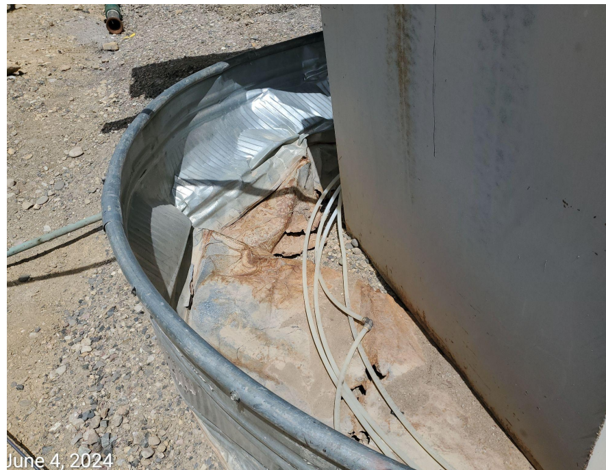
Photo 10: Secondary containment at equipment no longer in proper functioning condition to contain a spill or release.