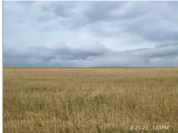
VIEW WEST ③