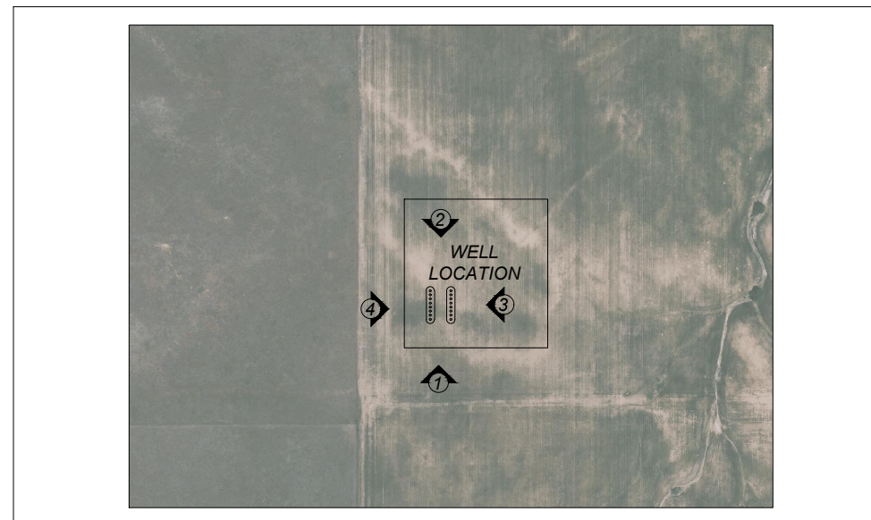
PICTURE VIEW LOCATIONS