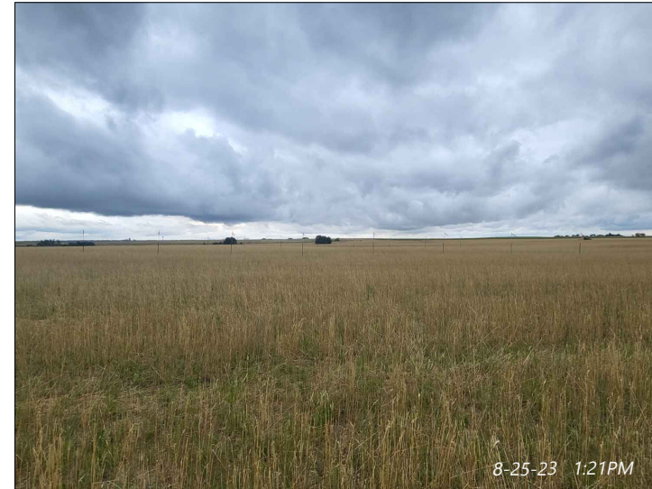
VIEW EAST ④