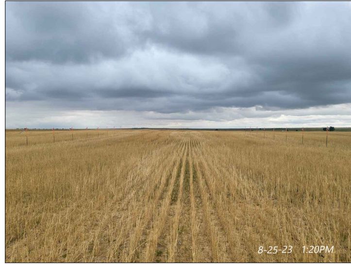
VIEW NORTH ①

REMORA 6 PAD BLINK 4-63 6-32-1 BISON OIL & GAS IV