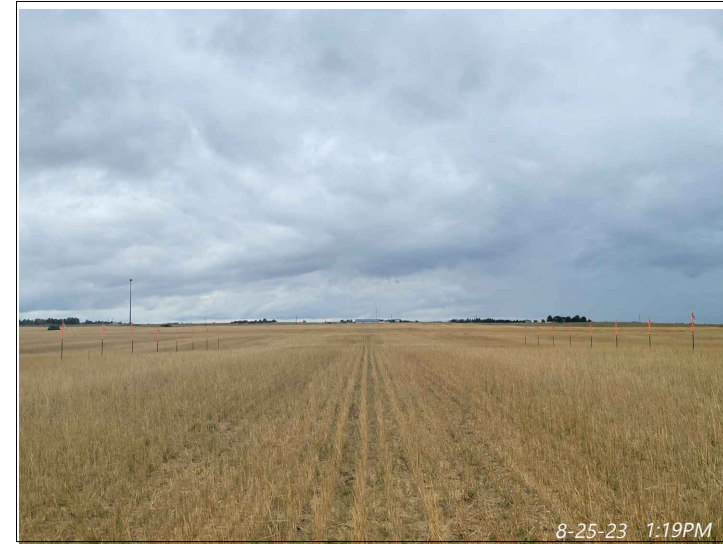
VIEW SOUTH ②