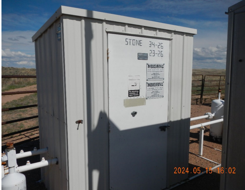
5. Lease signs on shared remote meter shed.