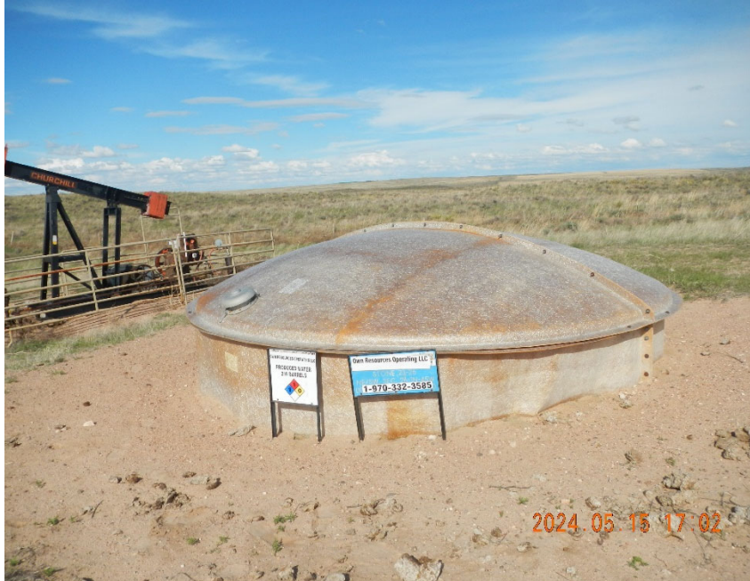
3. View of produced water tank at well location.