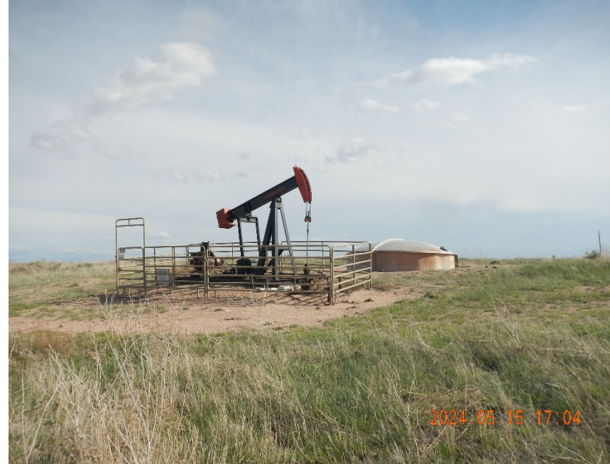
4. Well location overview.