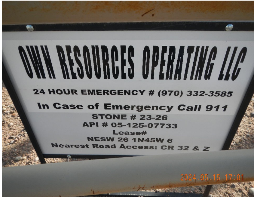
1. Lease sign at well location.