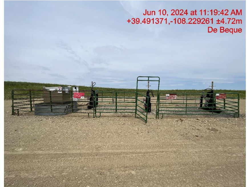
Well heads - Photo #02206