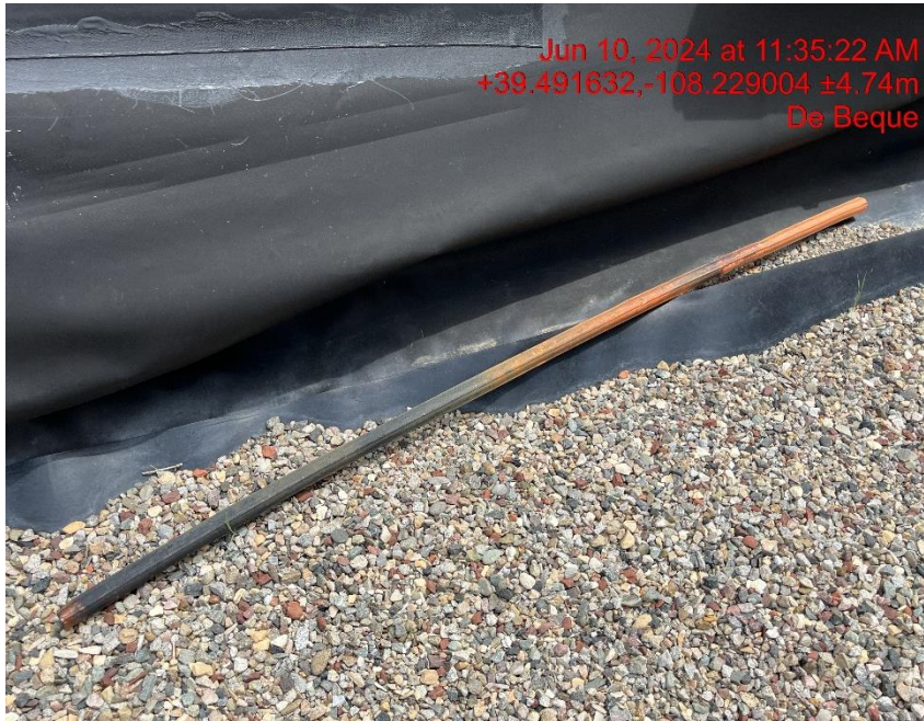
Debris - Photo #02247