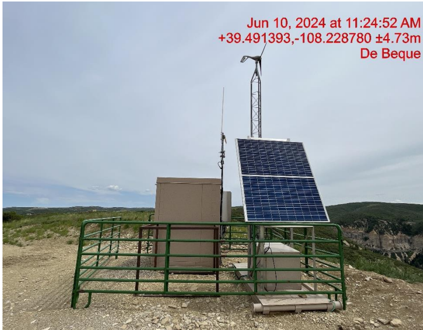
Communication - Photo #02220