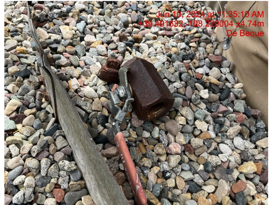
Debris - Photo #02246