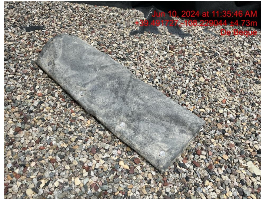
Debris - Photo #02251