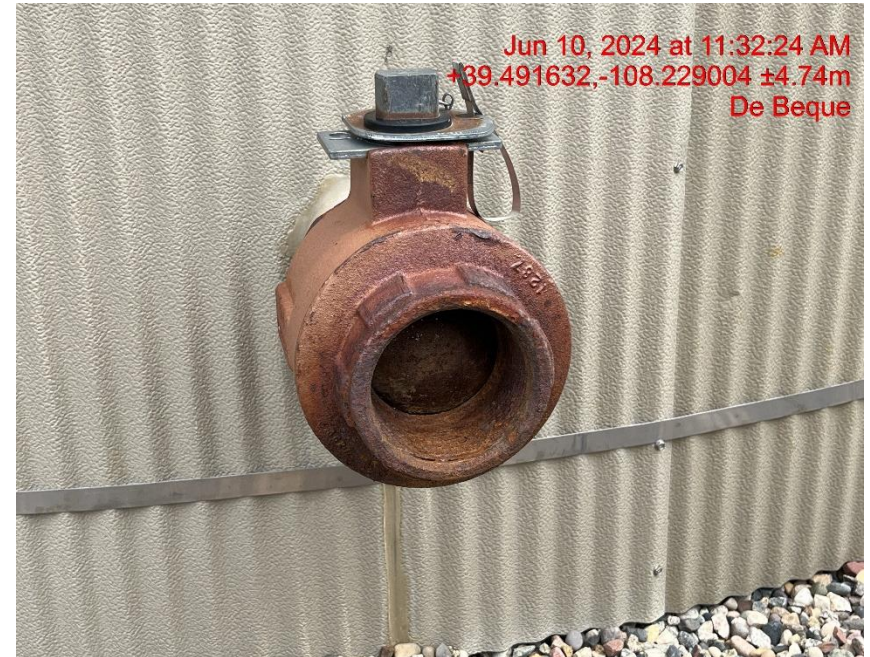
Open ended load line - Photo #02234