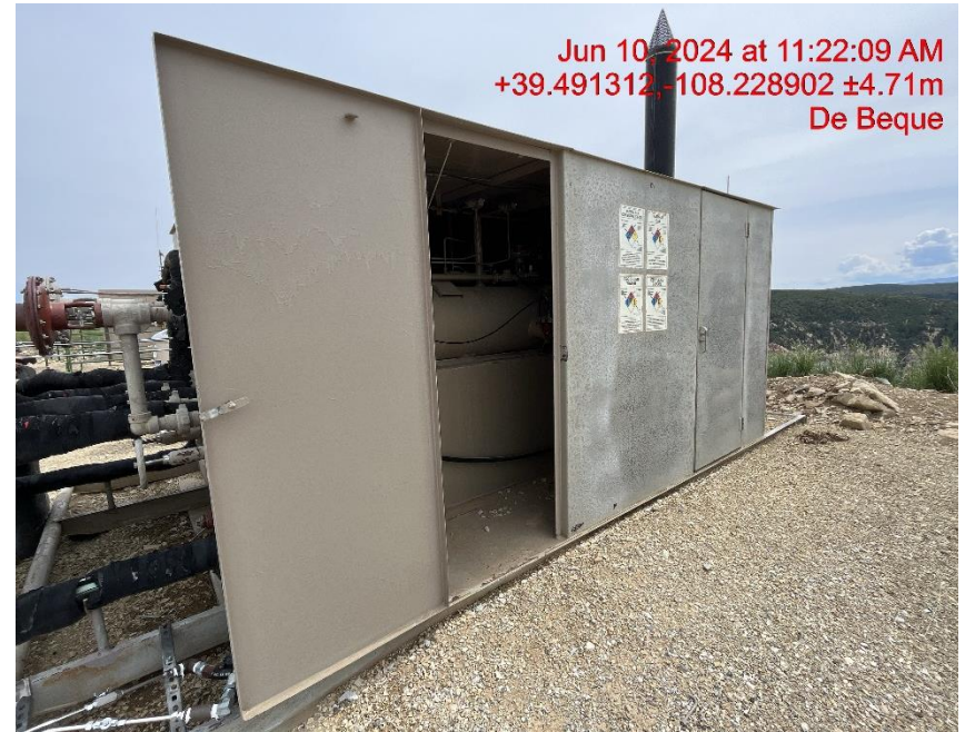
Wildlife Entry - Photo #02212