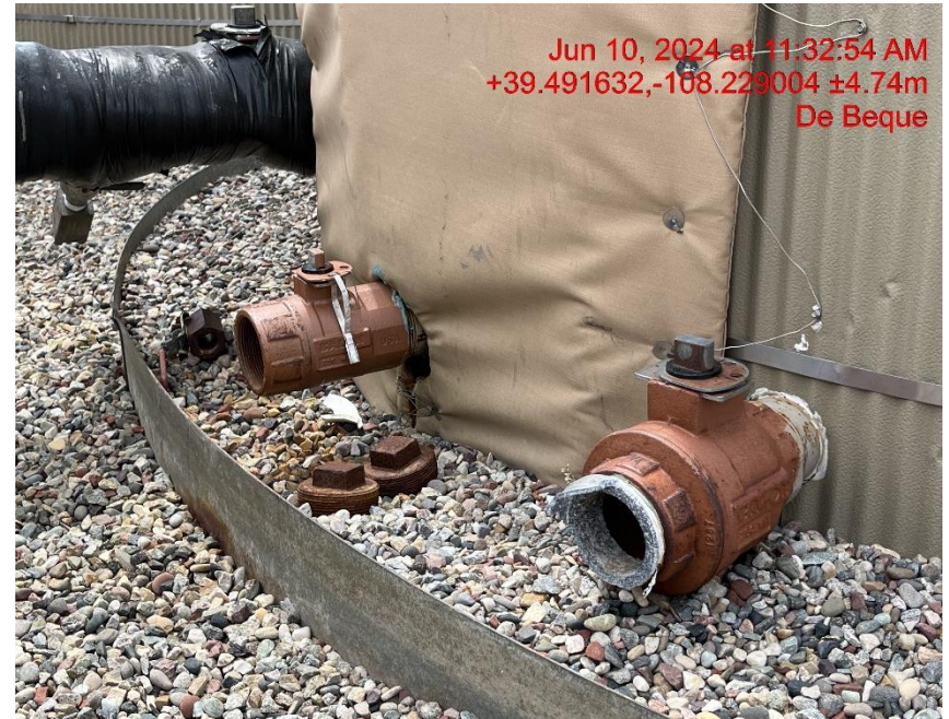
Open ended load line - Photo #02237