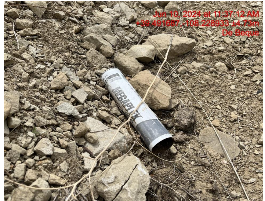
Debris - Photo #02257