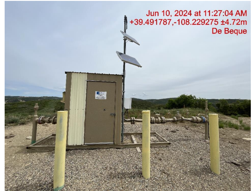
Meter run - Photo #02223