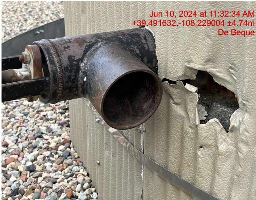
Open ended load line - Photo #02236