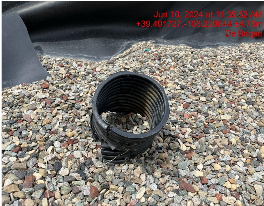
Debris - Photo #02252