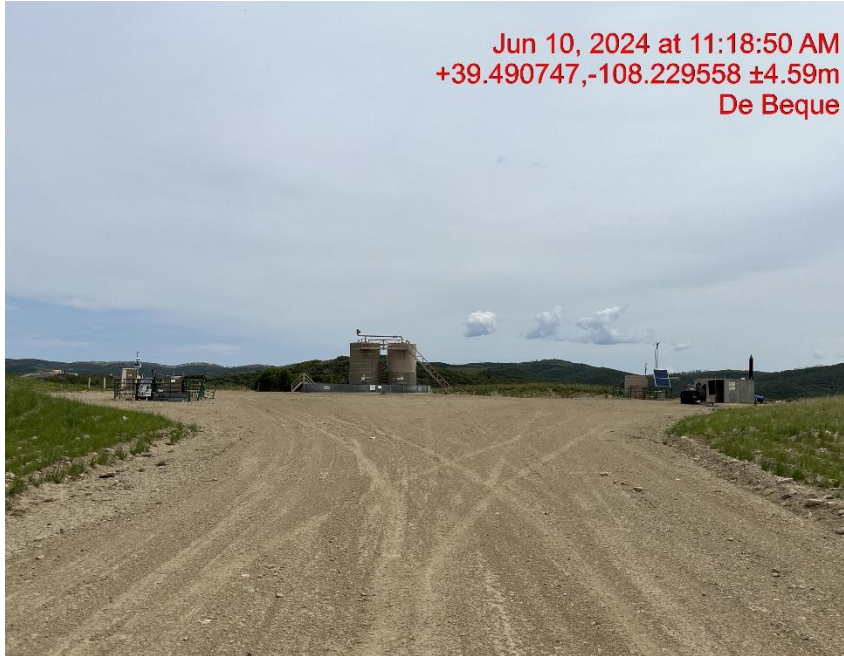
Entrance to location - Photo #02205