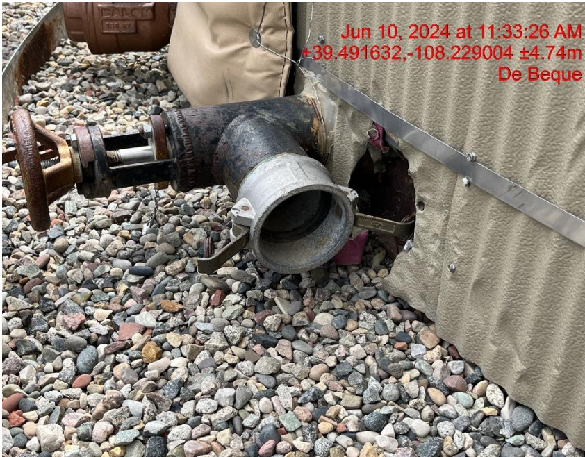
Open ended load line - Photo #02240