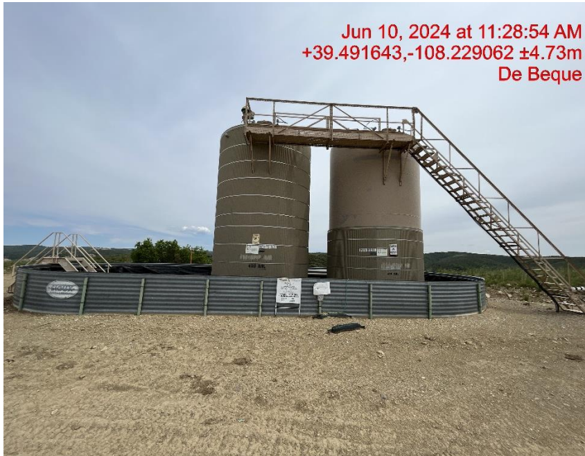
Tank battery - Photo #02227