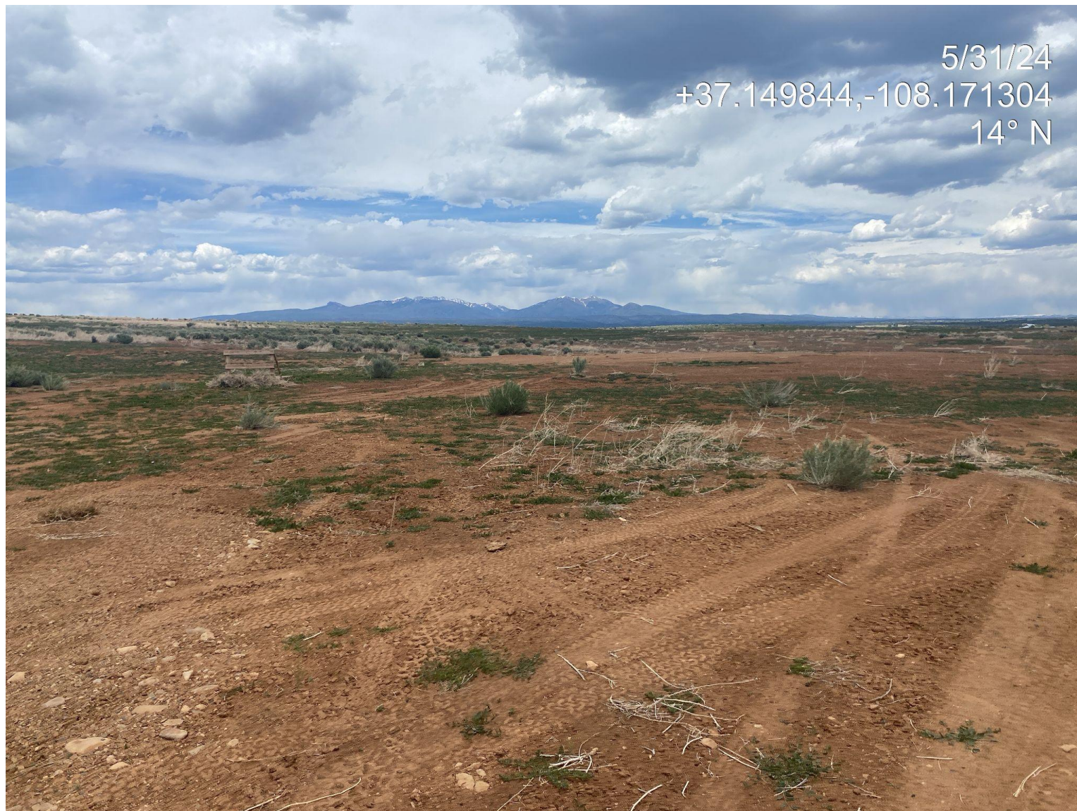
Photo 1. View of the project area taken from the access point facing center.