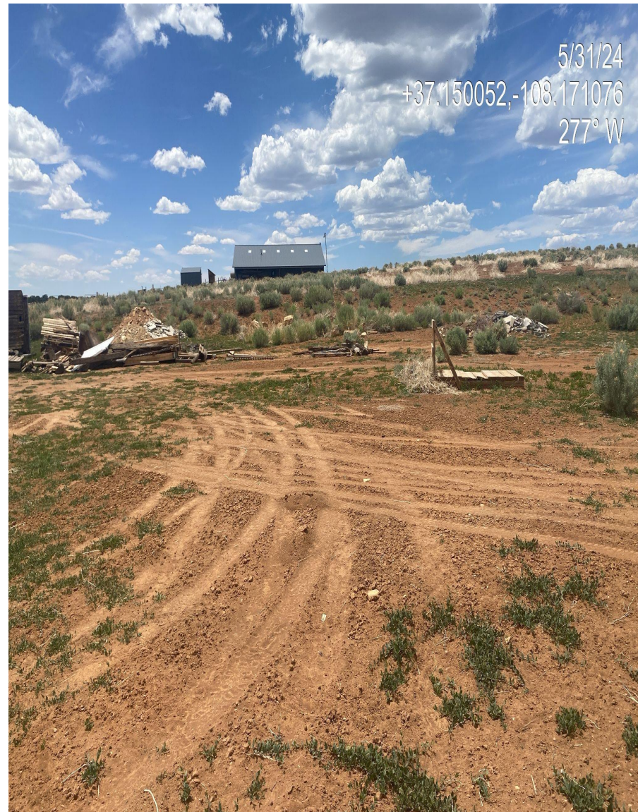
Photo 3. Cardinal photos taken from the center of the disturbance, left photo facing south, right photo facing west. Note: Disturbance remains unreclaimed.