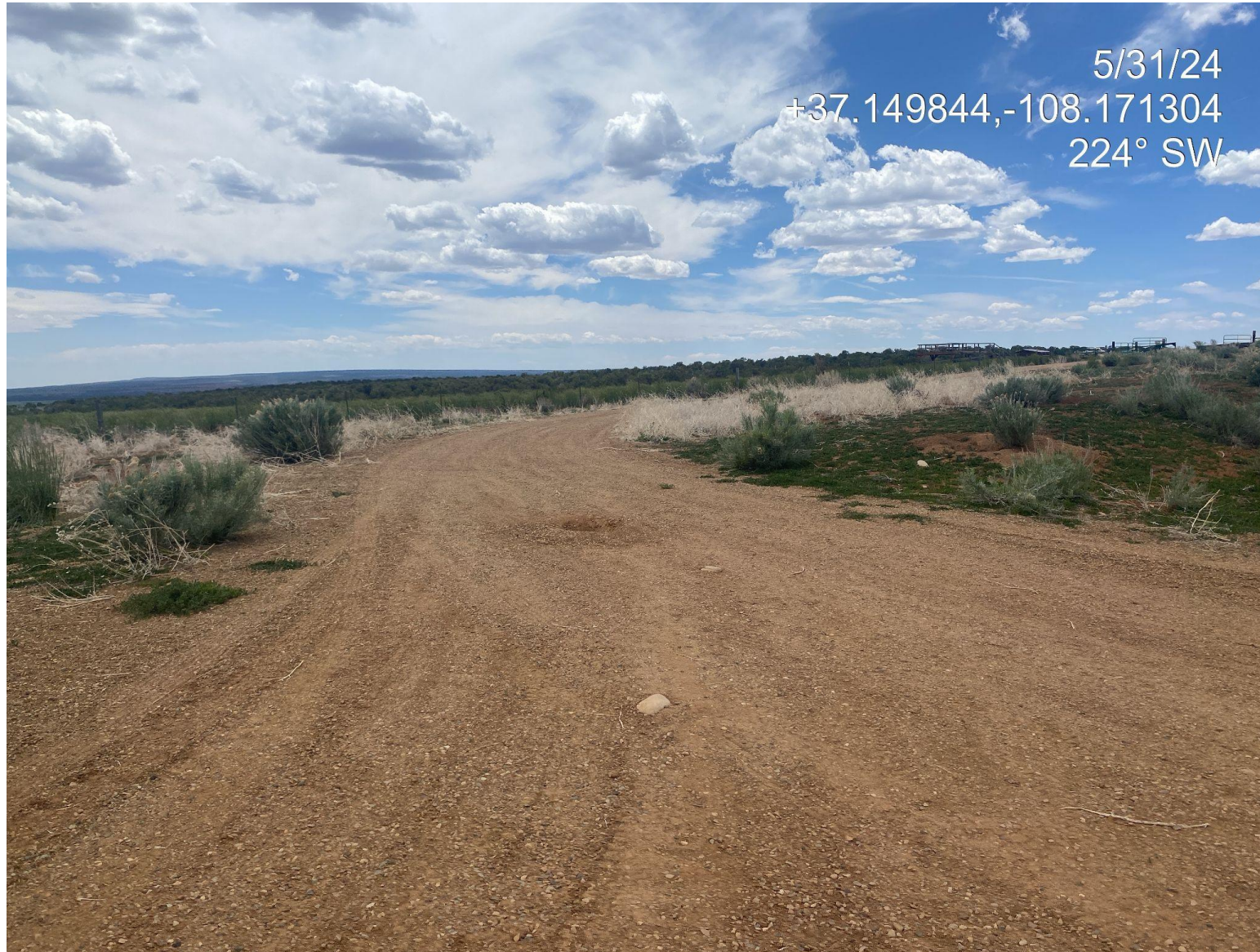
Photo 5. View of access road that remains unreclaimed.

Inspection Photos Location Name: Chevillar 32-32 Location ID: 306964