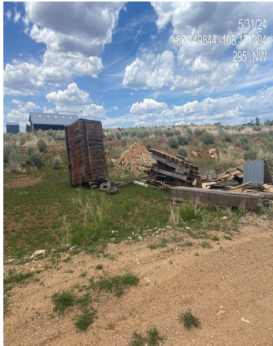
Photo 4. View of fill and cut slopes that remain not recontoured.