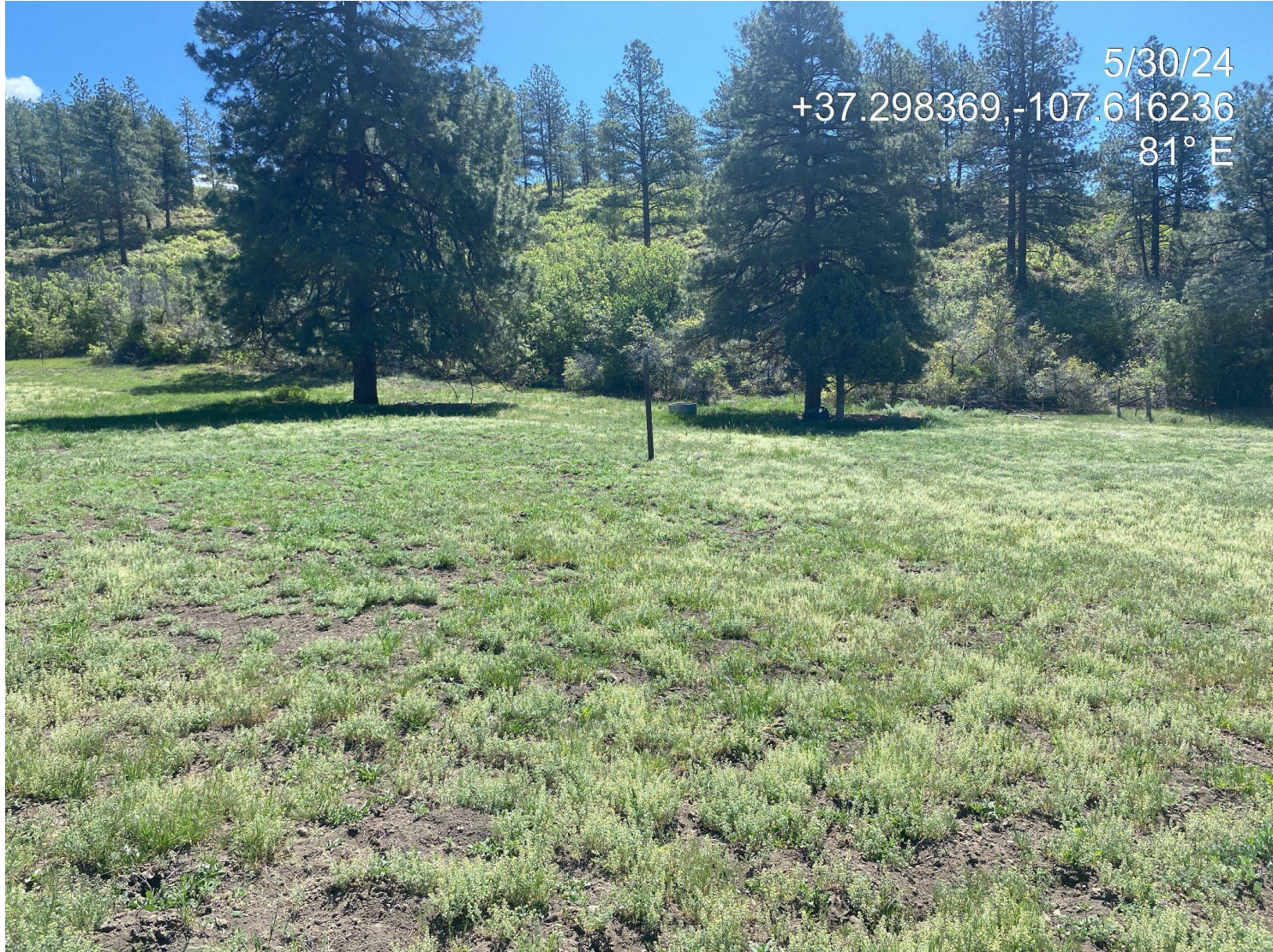
Photo 1. View of the project area taken from the western edge facing center.