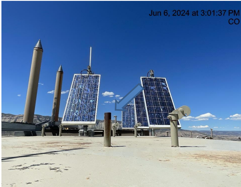
Photo # 105 PRV vent line does not comply with CECMC pressure safety device rules