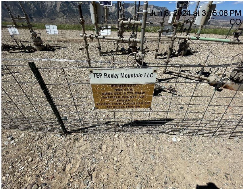
Photo # 107 Wellhead sign weathered & cracking/starting to become illegible