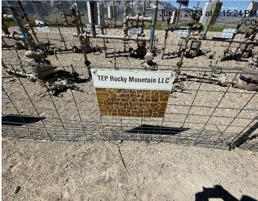
Photo # 109 Wellhead sign weathered & cracking/starting to become illegible