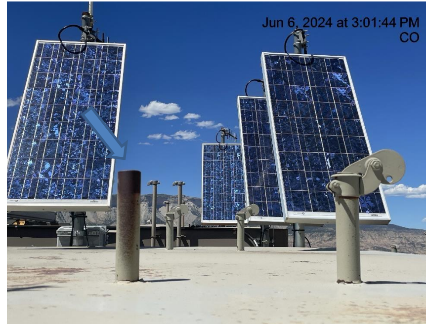
Photo # 106 PRV vent line does not comply with CECMC pressure safety device rules