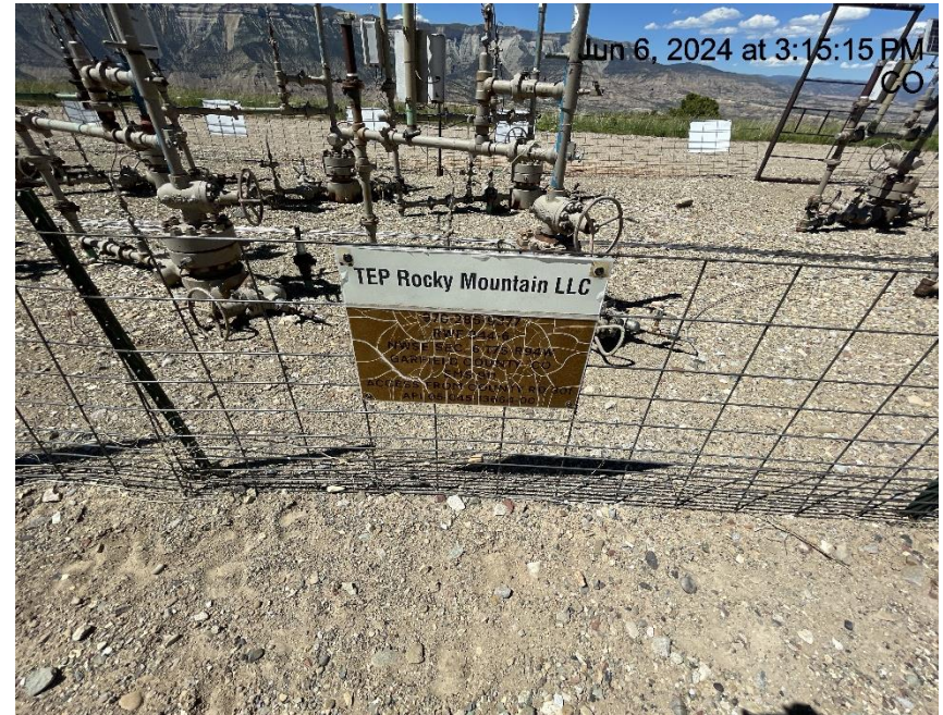
Photo # 108 Wellhead sign weathered & cracking/starting to become illegible