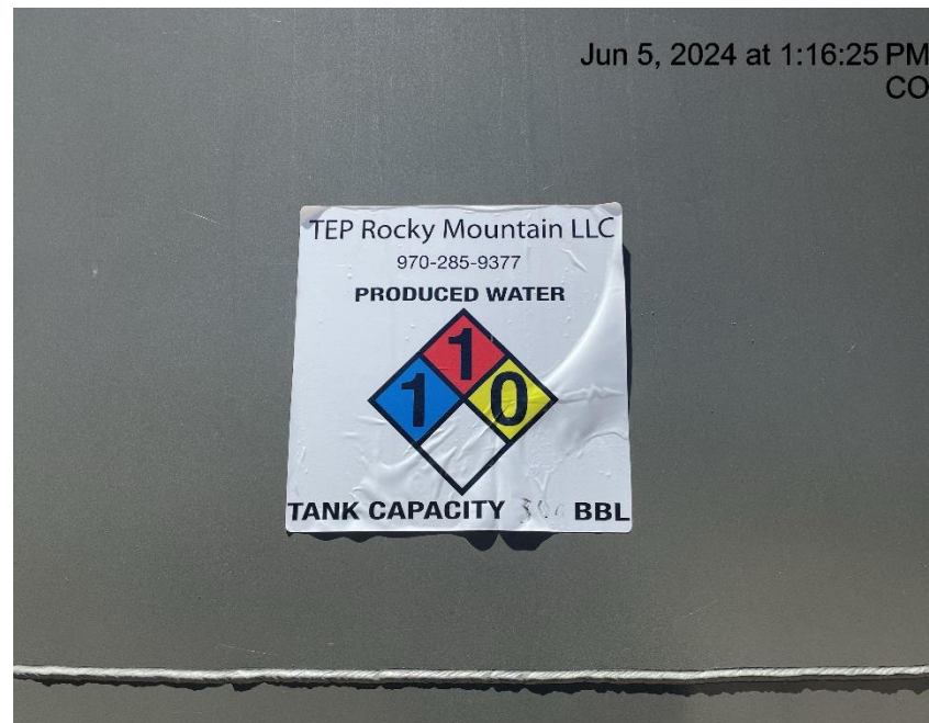
Photo # 9686 Capacity on produced water tank label faded /starting to become illegible