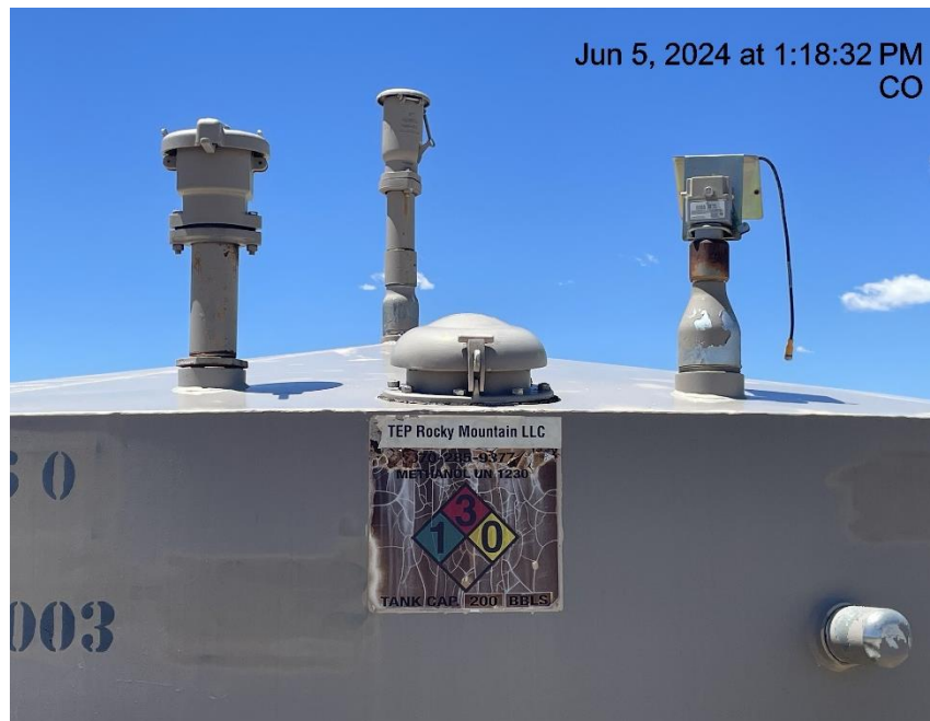
Photo # 9685 Methanol tank label weathered & cracking /starting to become illegible