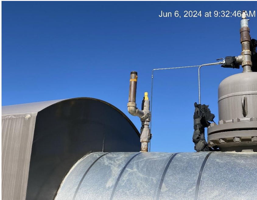
Relief riser missing protective cover