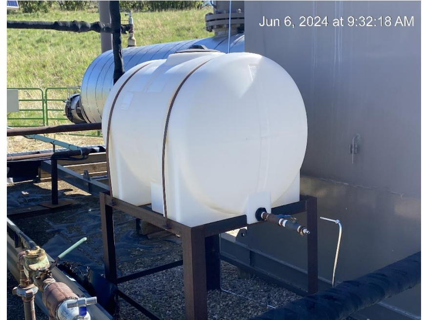
Unlabeled and disconnected chemical tank