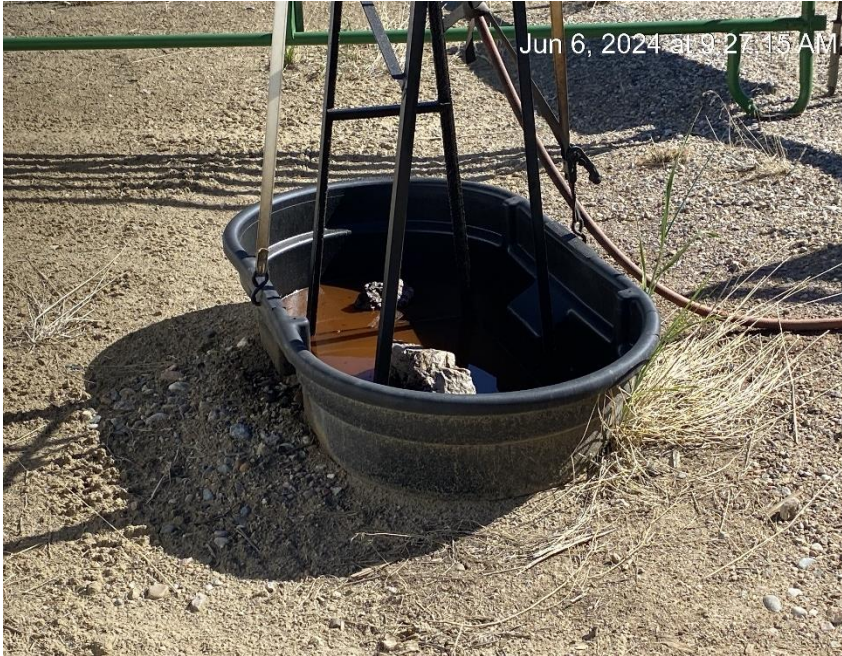
Containment open to wildlife