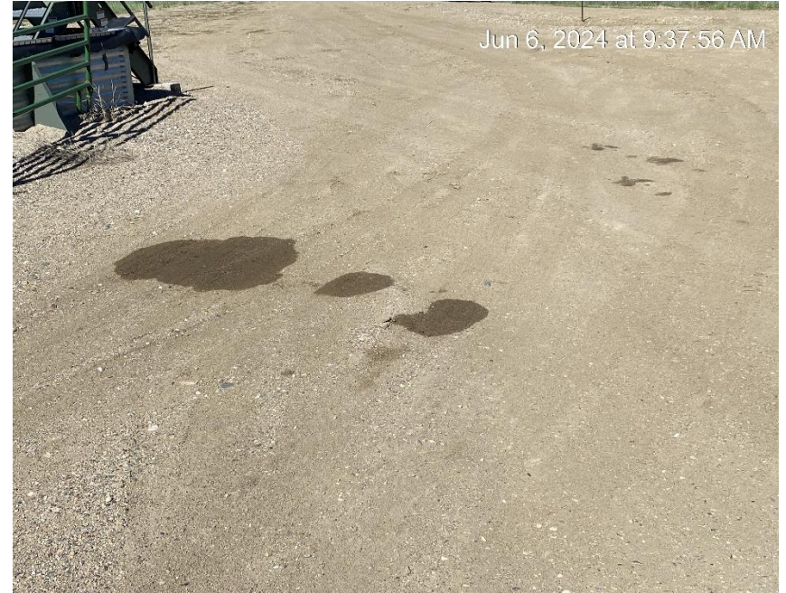
Soil staining at truck loadout