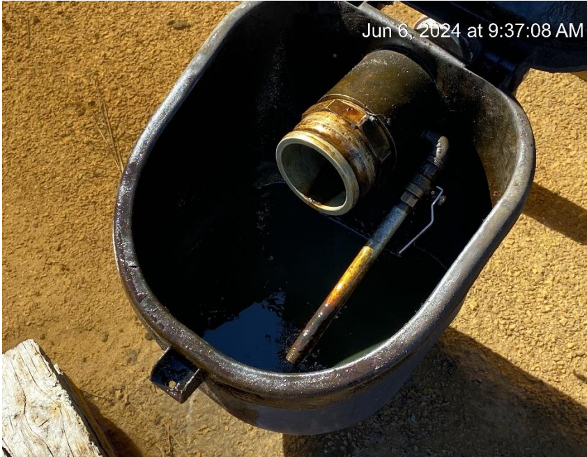
Open ended load line