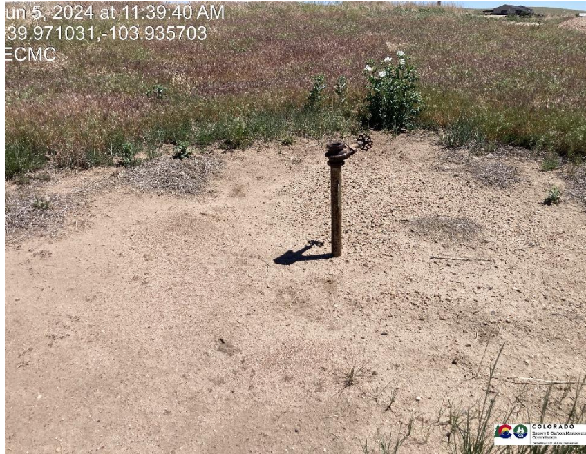
Pic 11 OOSLOT riser needs to be LOTO