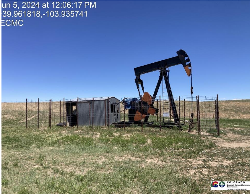
Pic 1 pumpjack

Jun 5, 2024 at 12:06:17 PM 39.961818,-103.935741 ECMC