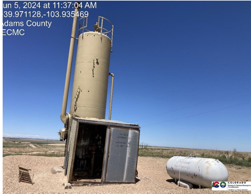
Pic 11 separator, propane tank