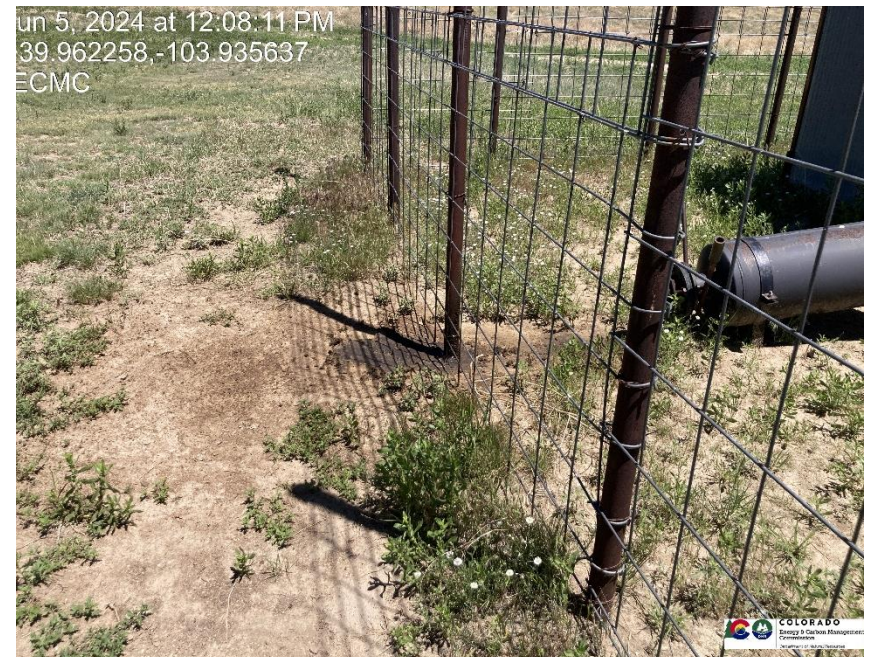
Pic 4 contaminated soil by exhaust needs to be removed