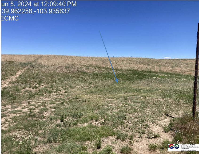
Pic 5 no guy line anchor marker

Jun 5, 2024 at 12:09:40 PM 39.962258,-103.935637 ECMC