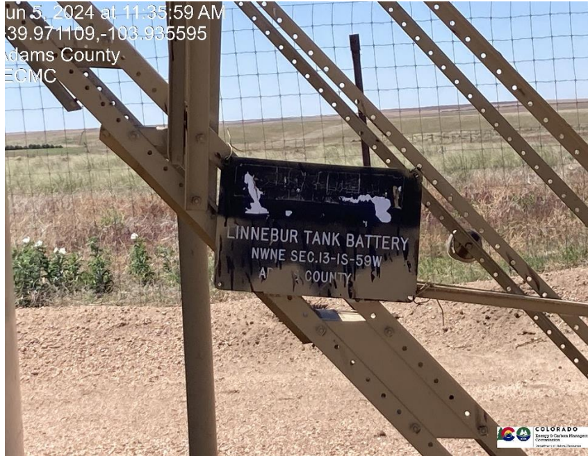
Pic 9 Sign is inadequate at tank battery.