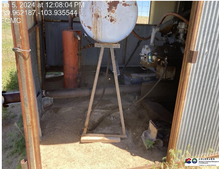
Pic 3 no containment under chemical tank