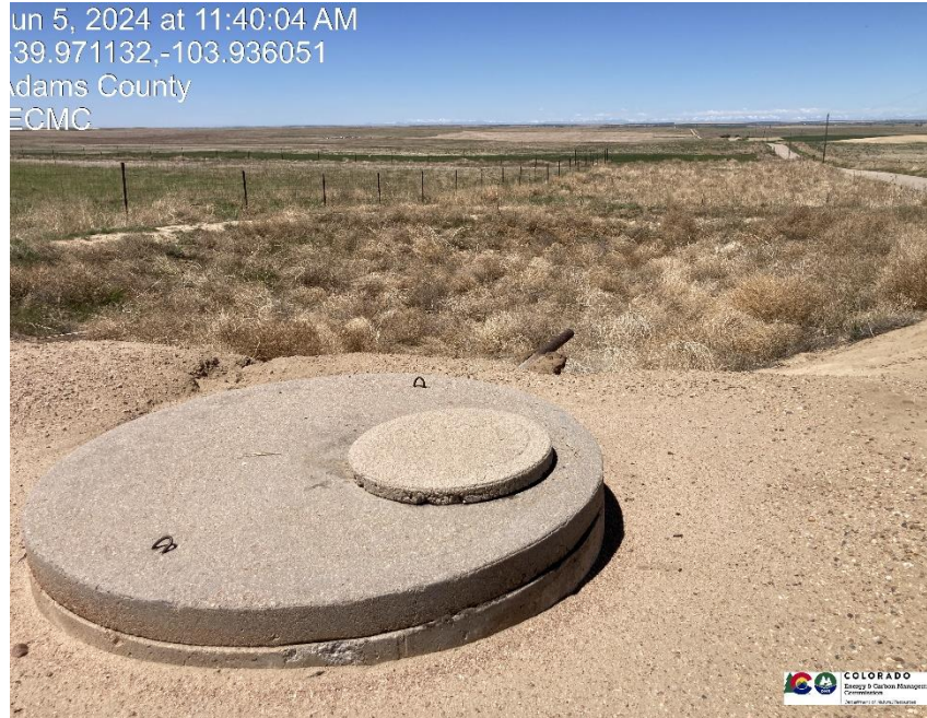
Pic 13 Pit needs weeds removed