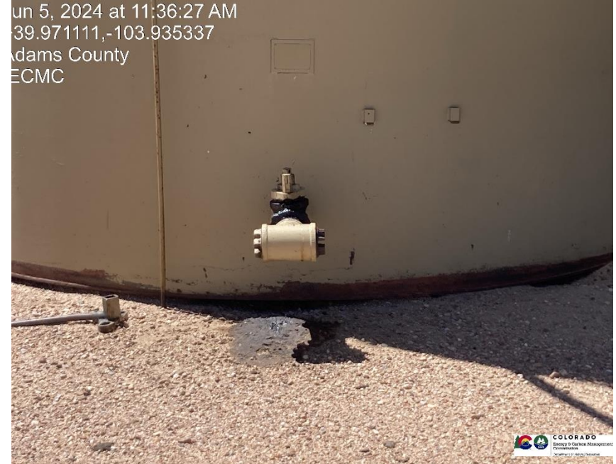
Pic 10 contaminated soil by valve on tank needs to be removed