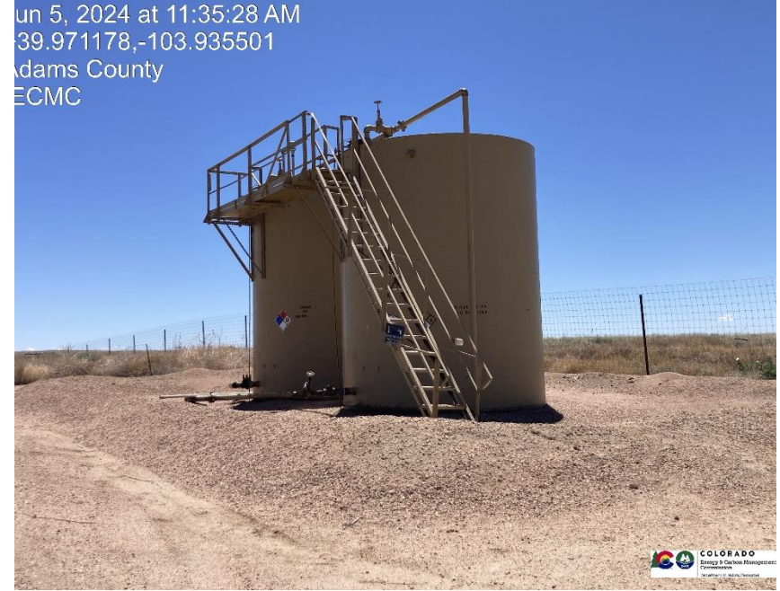
Pic 8 tanks, berms need to be repaired