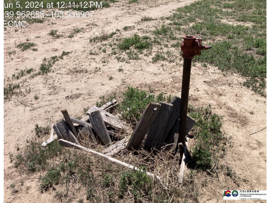
Pic 6 riser located east of pump jack no LOTO

Jun 5, 2024 at 12:11:12 PM 39.962608,-103.936907 ECMC