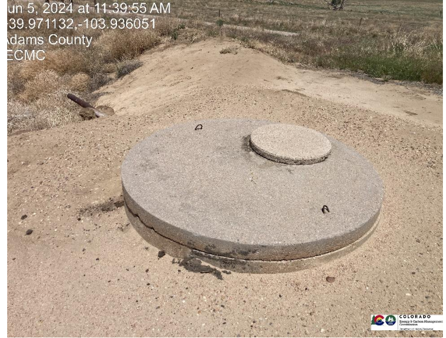
Pic 12 BV leading to pit