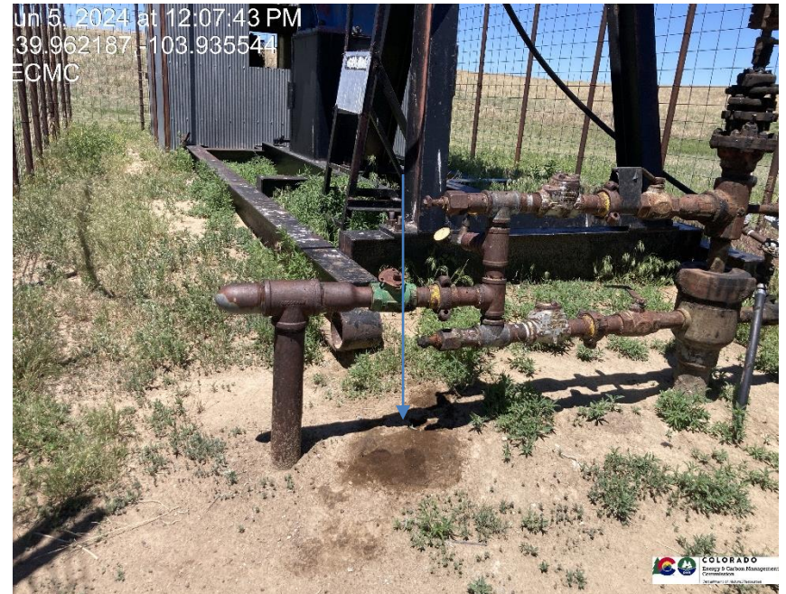
Pic 2 contaminated soil / weeds unmanaged / wellhead sign is incorrect information.

Jun 5, 2024 at 12:07:43 PM 39.962187,-103.935544 ECMC