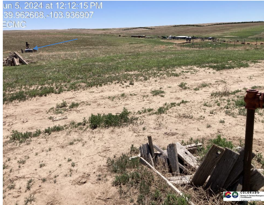
pic 7 Riser east of pump jack, arrow shows pump jack