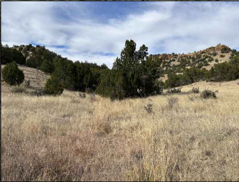
11/16/23 - 11/19/23 field survey identified the area as an upland swale. Downstream gully lacks an ordinary high water mark.

There are no Public Water System Facilities (intakes, wells, storage facilities, recharge areas, or treatment plants) and no Rule 411 buffer zones within 2,640' of the Working Pad Surface. There are no surface waters within 2,640' of the Working Pad Surface that are 15 stream miles upstream of a Public Water System intake.