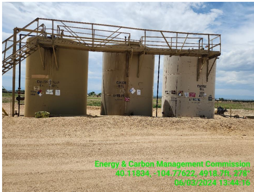
Photo 17 Tank battery.