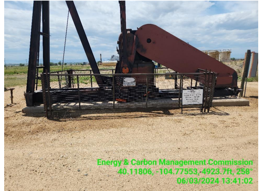
Photo 8 Stained soil around the pump jack base.