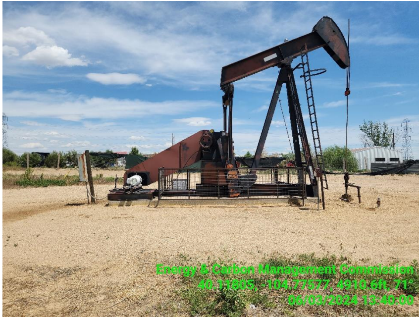
Photo 7 Stained soil around the pump jack base.