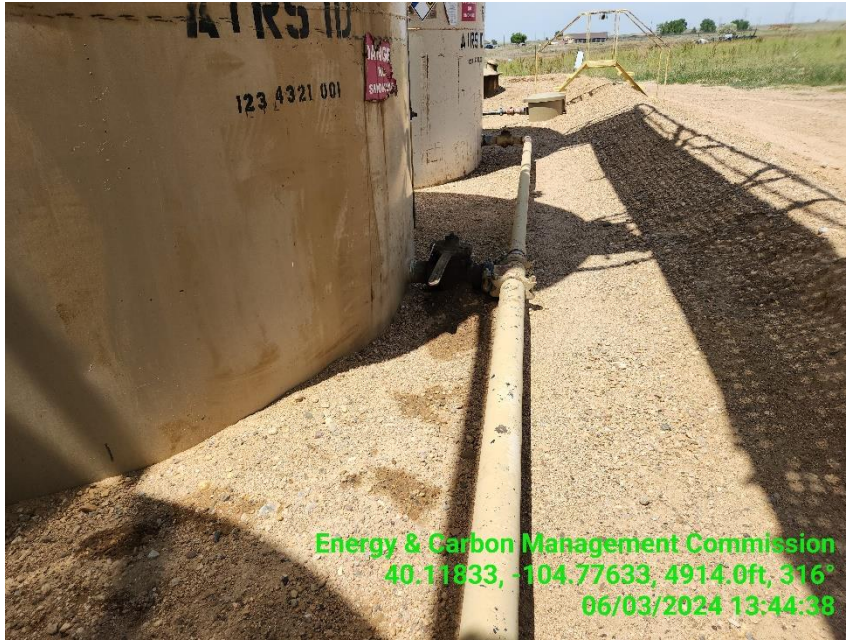
Photo 19 Stained soil by tank load line valve .