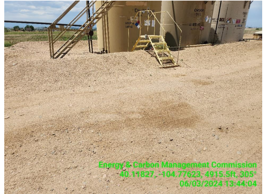
Photo 15 Tank battery sign.