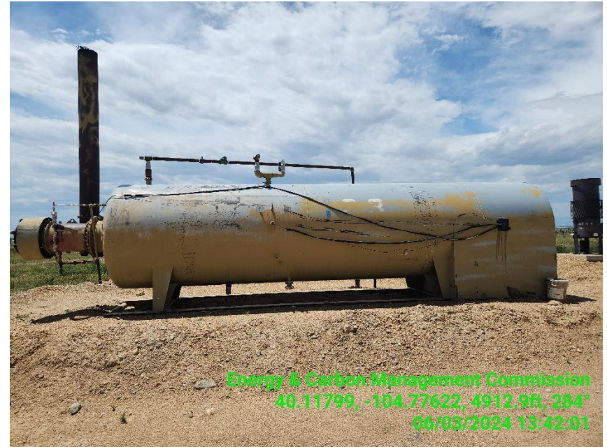
Photo 10 Horizontal heater treater.