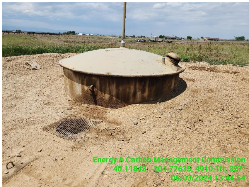
Photo 21 Stained soil by PW tanks.