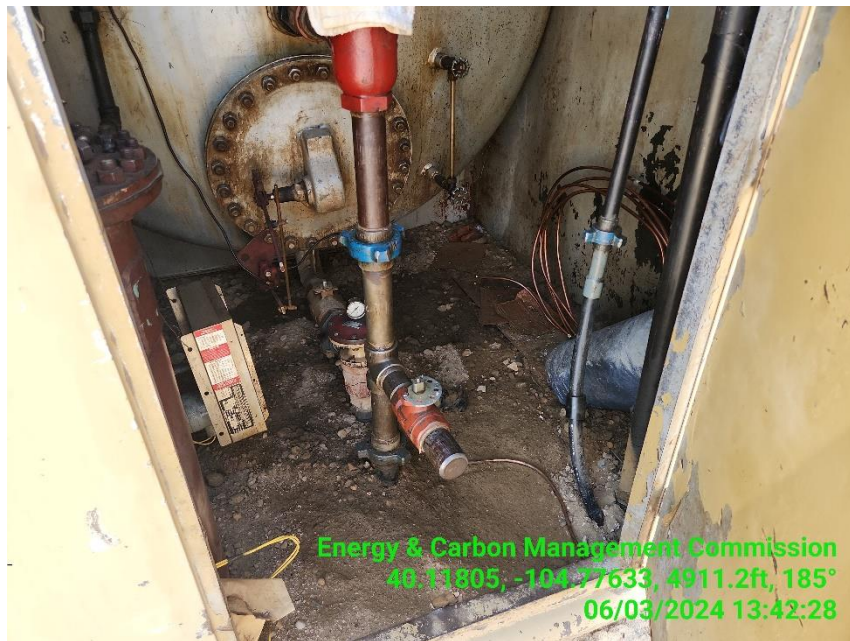
Photo 11 Stained soil inside the Horizontal heater Treater housing.