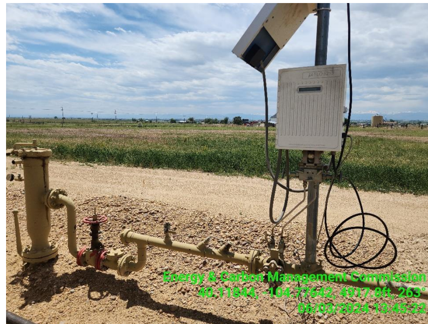
Photo 22 Gas Meter Run.