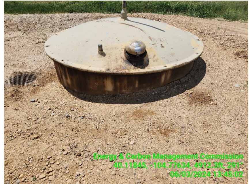
Photo 20 Stained soil around the PW tanks