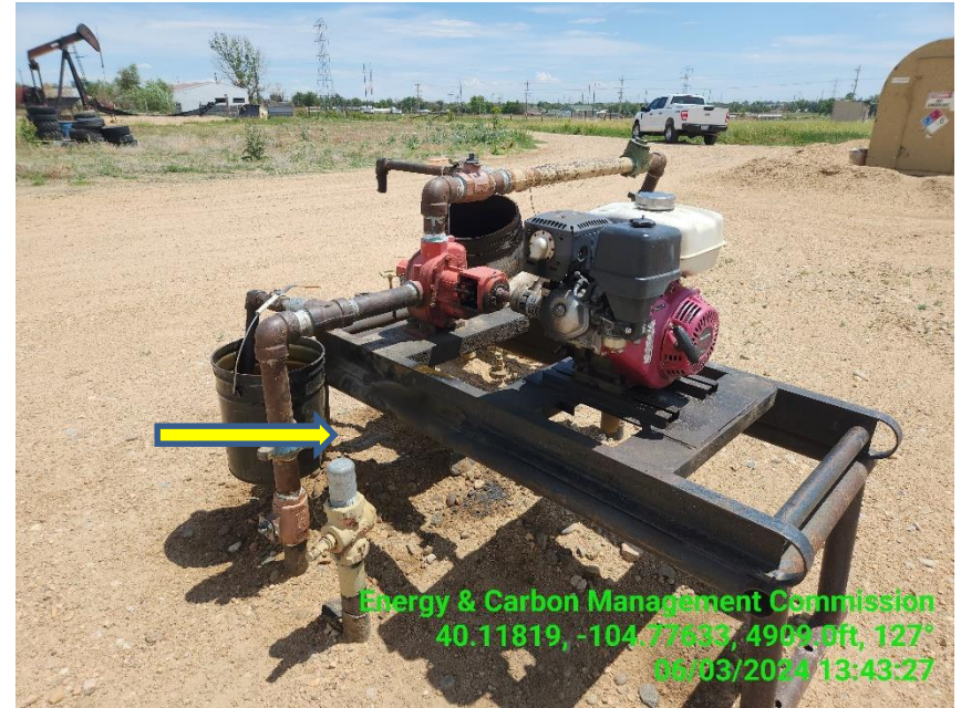
Photo 14 Stained soil by the flow line manifold & aux. pump.