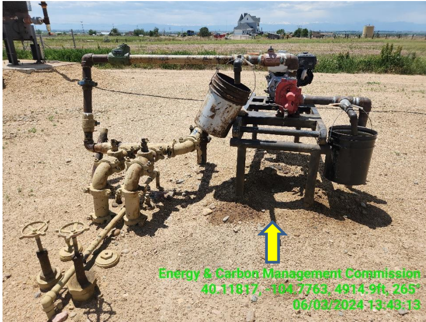
Photo 13 Stained soil by the flow line manifold & aux. pu.mp