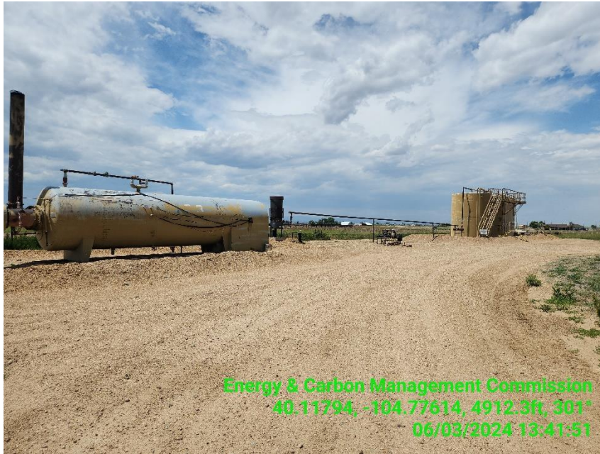
Photo 9 Tank battery location.