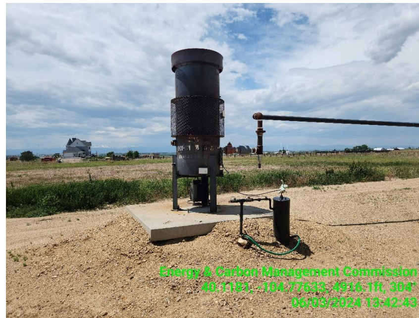
ECD.