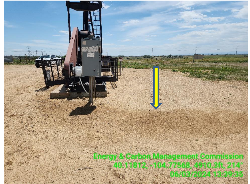
Photo 5 Stained soil around the pump jack base.