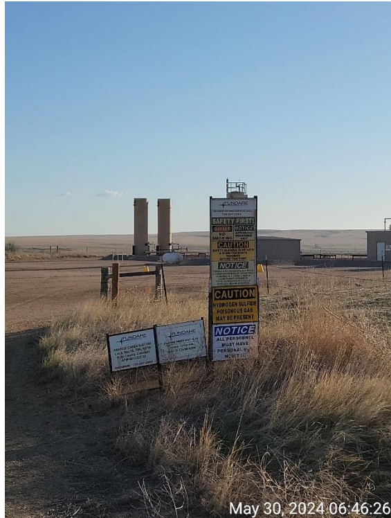
Pawnee Creek 9-57-18 1H Entrance Signage