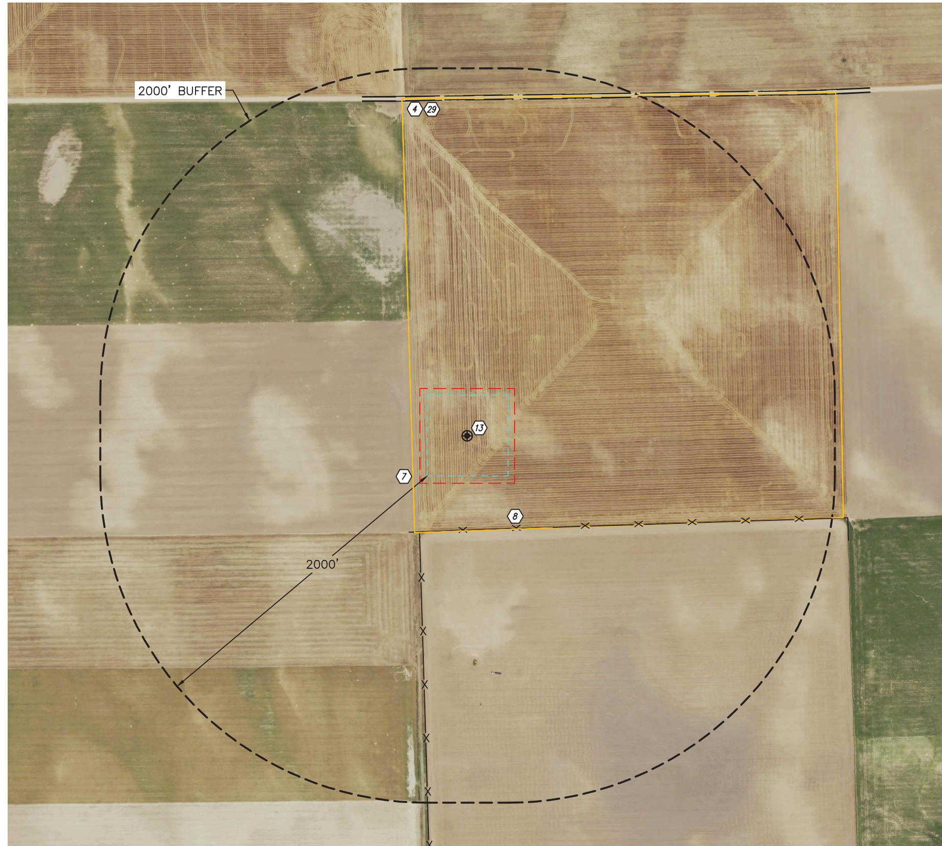
LOCATION DRAWING: (MEASURED FROM EDGE OF WORKING PAD SURFACE)

Q: NW/4 SECTION: 23 TOWNSHIP: 7S RANGE: 52W 6TH. P.M. LINCOLN COUNTY, CO