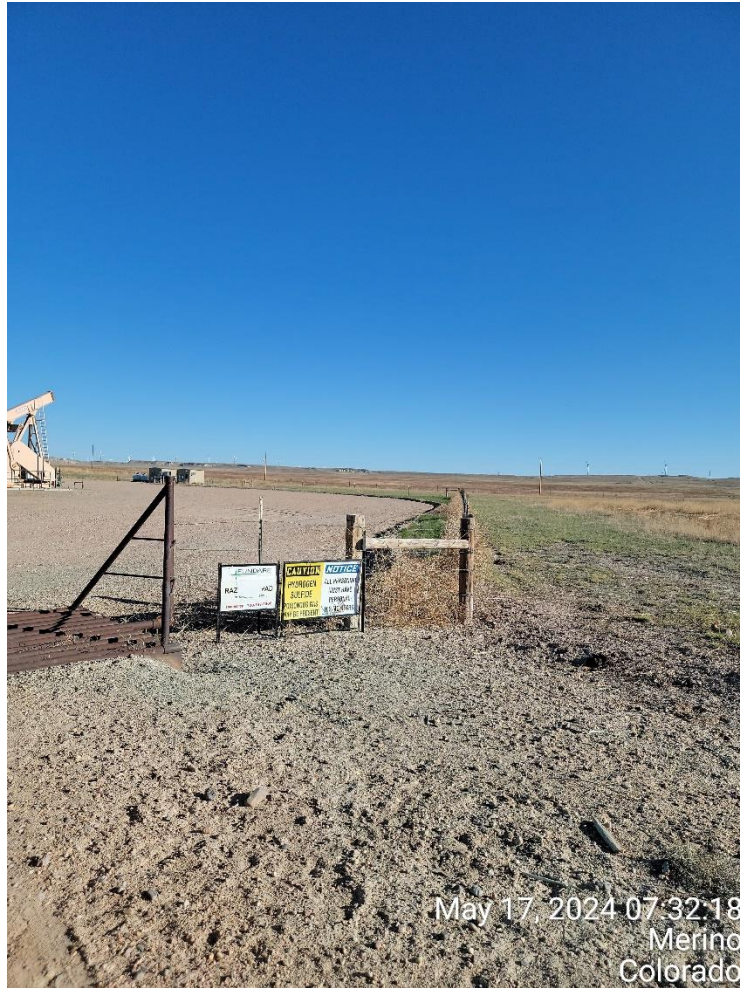
Razor 21 A Pad Entrance Signage