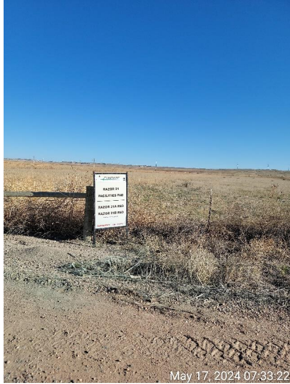
Razor 21 A Pad Entrance Sign