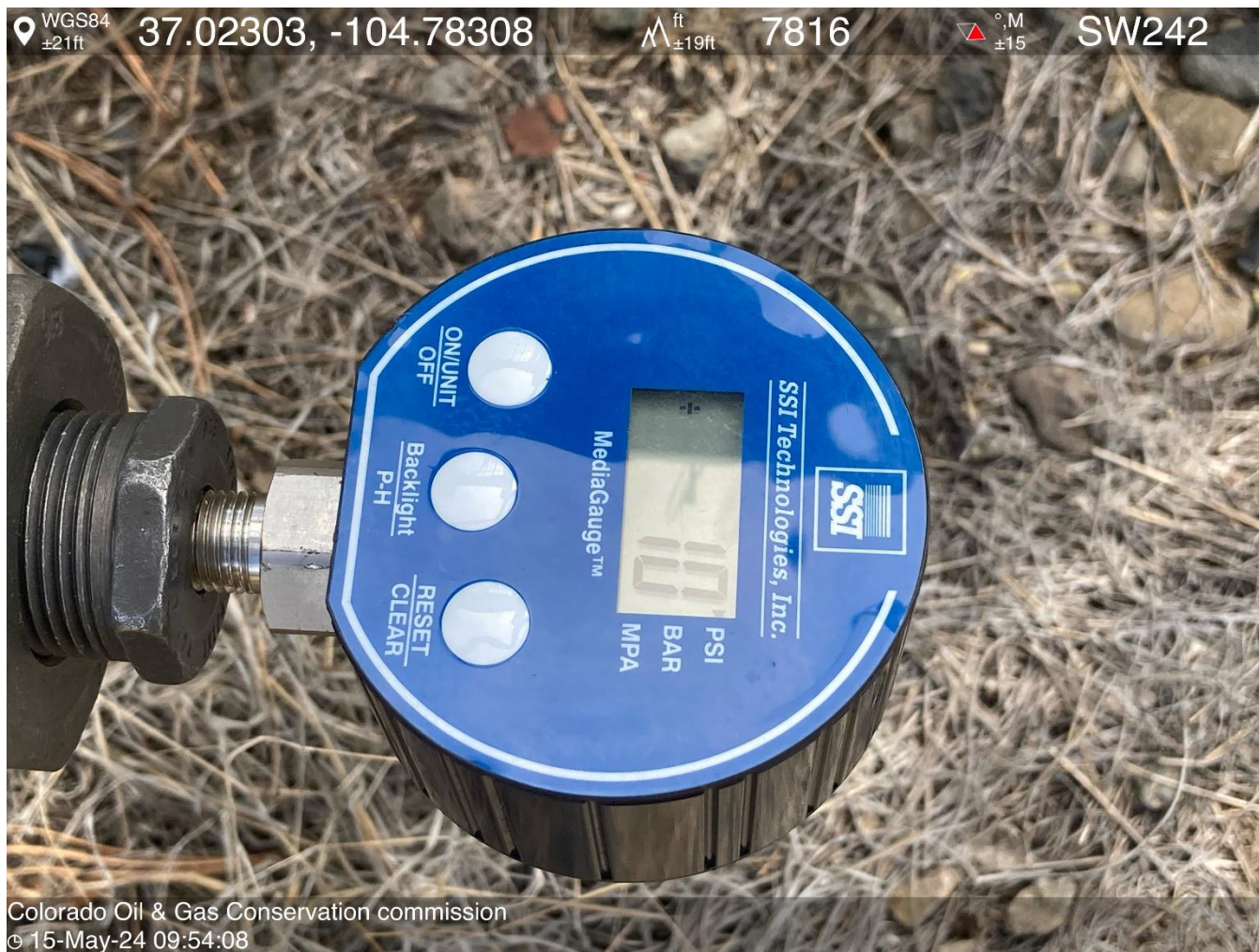
PHOTO 5: BRADENHEAD 10 PSI, BRADENHEAD BLEW DOWN IN APP. 20 SECONDS, NO BLOW NO FLOW FOR 15 MIN.