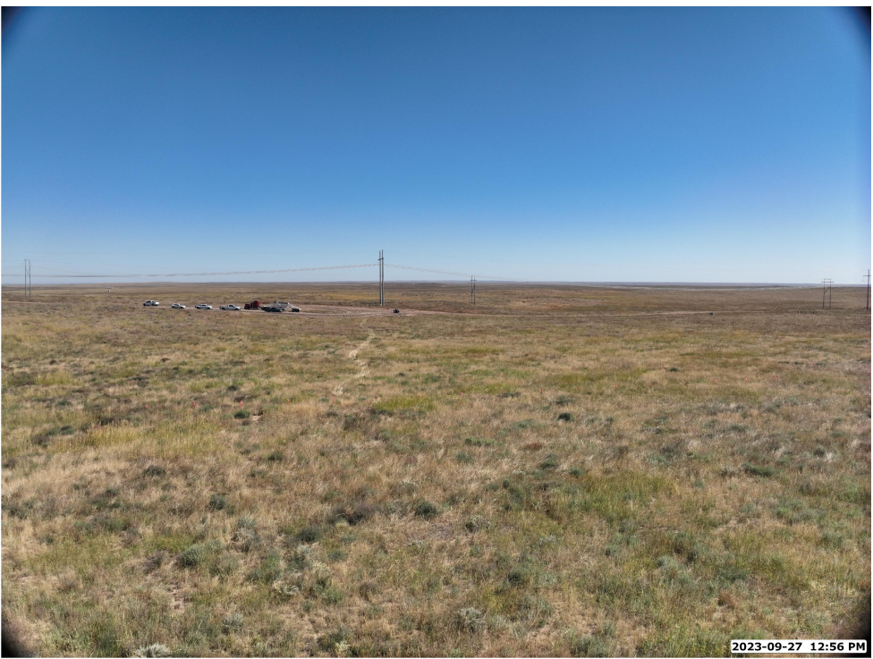
LOCATION PICTURE OF WALLSTREET FED 8-3HZ WELL PAD - CAMERA VIEW EAST