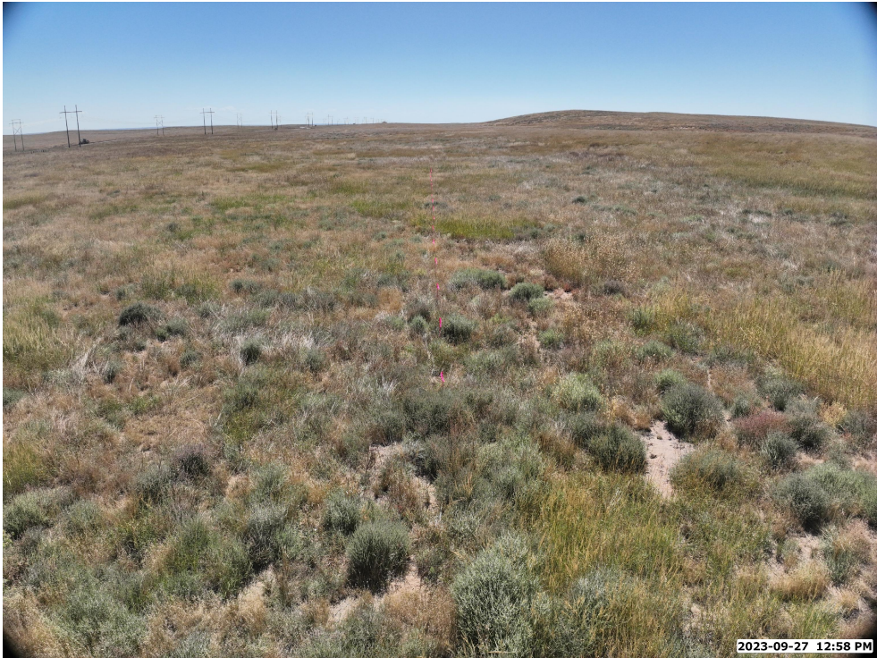
LOCATION PICTURE OF WALLSTREET FED 8-3HZ WELL PAD - CAMERA VIEW SOUTH