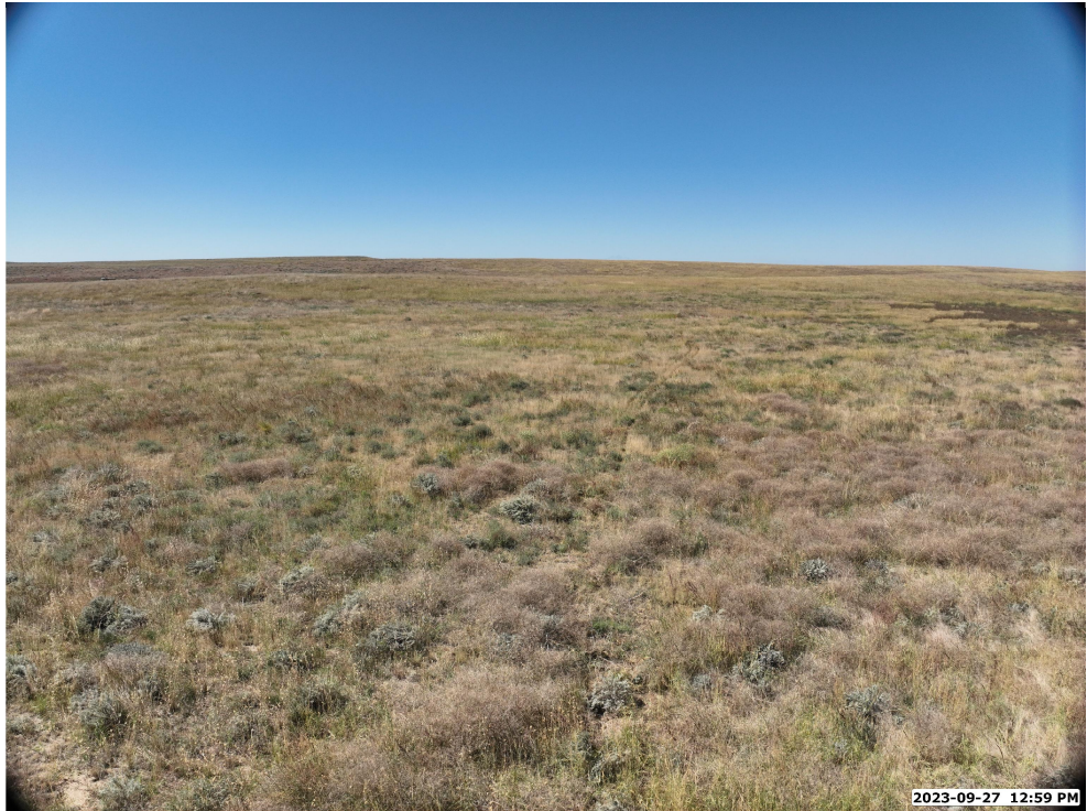
LOCATION PICTURE OF WALLSTREET FED 8-3HZ WELL PAD - CAMERA VIEW WEST