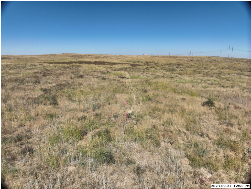
LOCATION PICTURE OF WALLSTREET FED 8-3HZ WELL PAD - CAMERA VIEW NORTH

SE1/4 NE1/4 SECTION 3, TOWNSHIP 3 NORTH, RANGE 63 WEST, 6TH P.M., WELD COUNTY, COLORADO