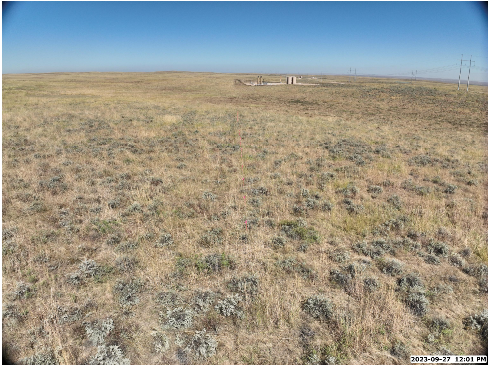
LOCATION PICTURE OF 5 MINUTES TO MIDNIGHT 8-34HZ WELL PAD - CAMERA VIEW NORTH