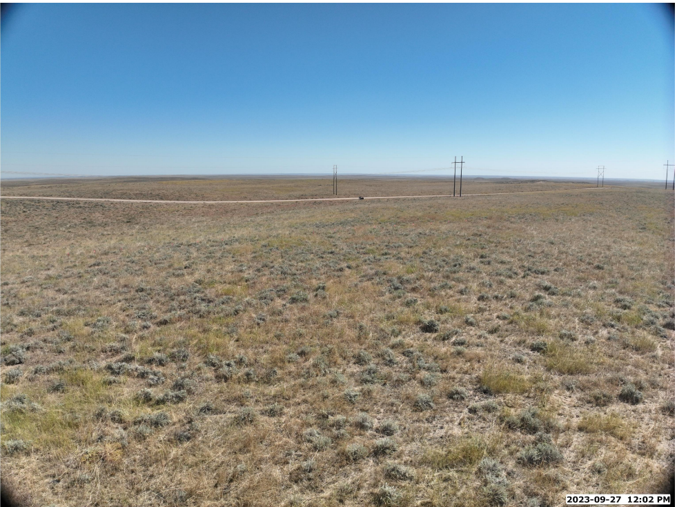
LOCATION PICTURE OF 5 MINUTES TO MIDNIGHT 8-34HZ WELL PAD - CAMERA VIEW EAST