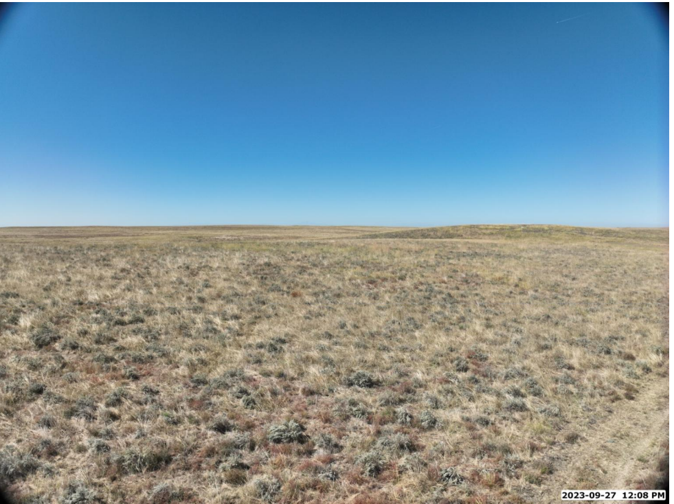
LOCATION PICTURE OF 5 MINUTES TO MIDNIGHT 8-34HZ WELL PAD - CAMERA VIEW WEST