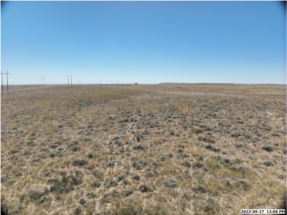
LOCATION PICTURE OF 5 MINUTES TO MIDNIGHT 8-34HZ WELL PAD - CAMERA VIEW SOUTH