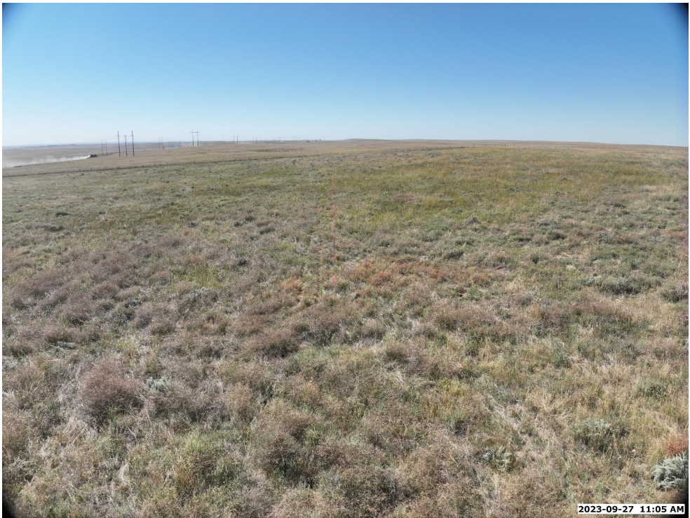
LOCATION PICTURE OF MIDNIGHT 1-27HZ WELL PAD - CAMERA VIEW SOUTH