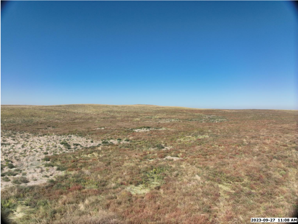
LOCATION PICTURE OF MIDNIGHT 1-27HZ WELL PAD - CAMERA VIEW WEST