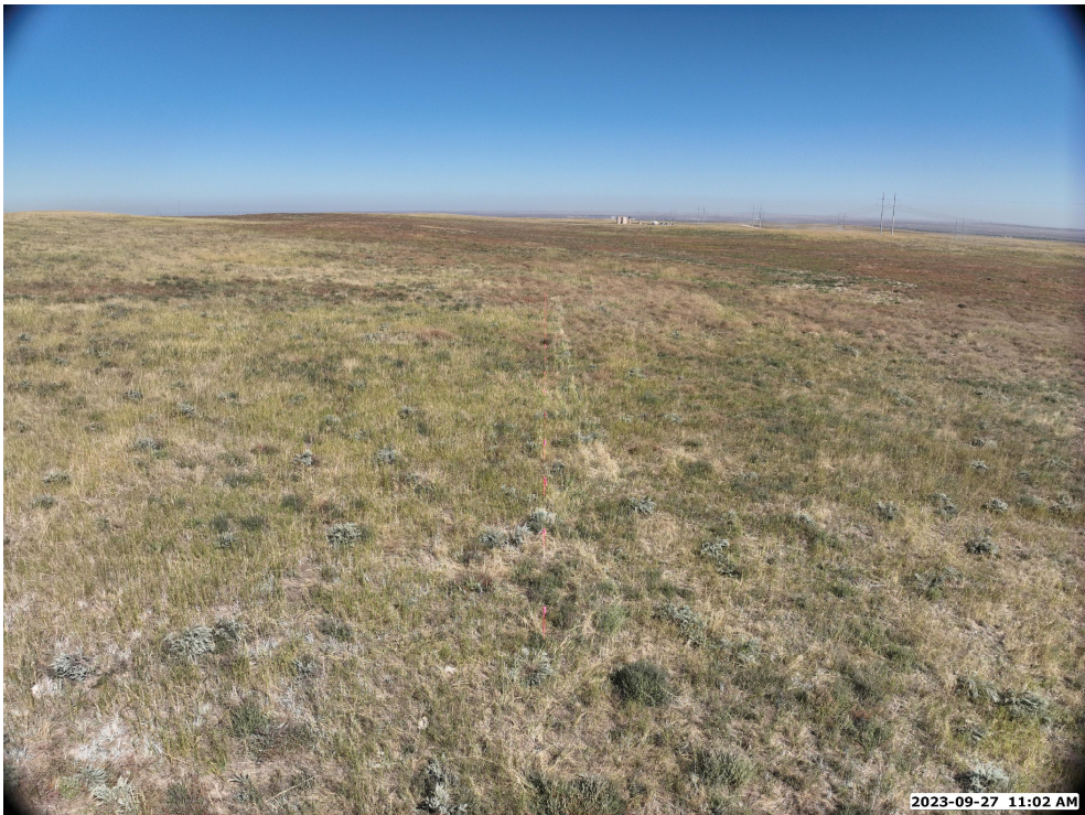
LOCATION PICTURE OF MIDNIGHT 1-27HZ WELL PAD - CAMERA VIEW NORTH

E1/2 NE1/4 SECTION 27, TOWNSHIP 4 NORTH, RANGE 63 WEST, 6TH P.M., WELD COUNTY, COLORADO