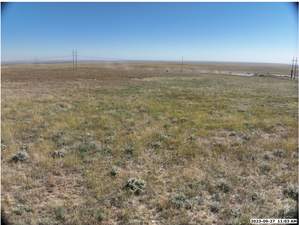
LOCATION PICTURE OF MIDNIGHT 1-27HZ WELL PAD - CAMERA VIEW EAST