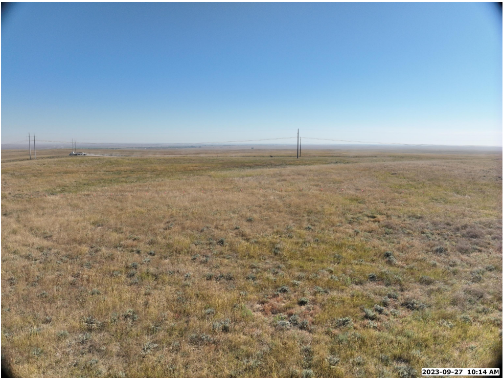
LOCATION PICTURE OF DESCENT FED 8-22HZ WELL PAD - CAMERA VIEW EAST