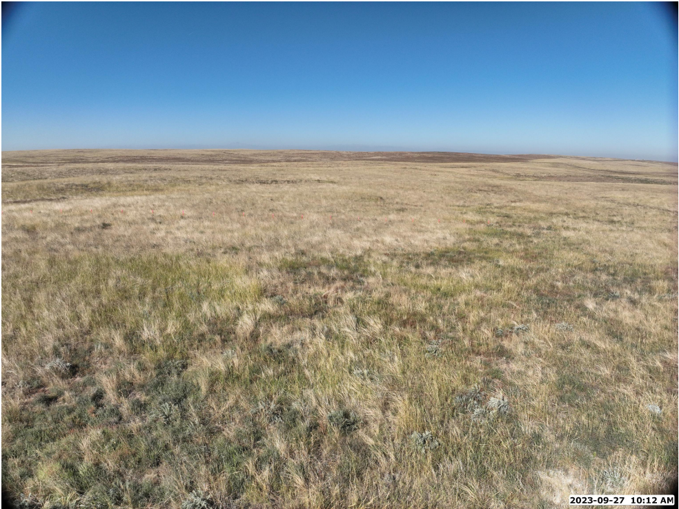
LOCATION PICTURE OF DESCENT FED 8-22HZ WELL PAD - CAMERA VIEW WEST