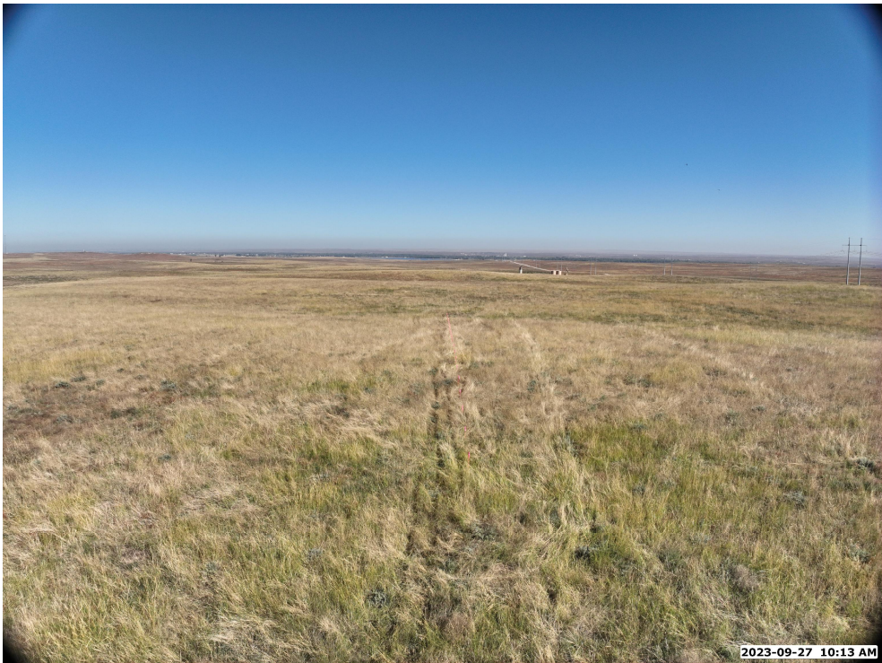
LOCATION PICTURE OF DESCENT FED 8-22HZ WELL PAD - CAMERA VIEW NORTH

SE1/4 NE1/4 SECTION 22, TOWNSHIP 4 NORTH, RANGE 63 WEST, 6TH P.M., WELD COUNTY, COLORADO