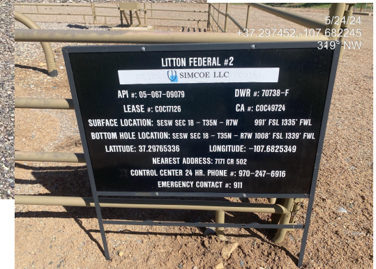
Photo 1. View of the well disturbance taken from the access point facing center.