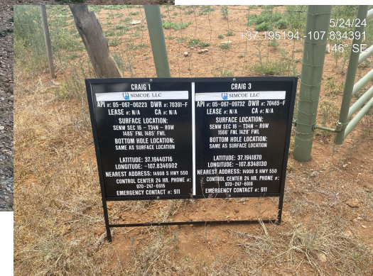
Photo 1. View of the well disturbance taken from the southern edge facing center.