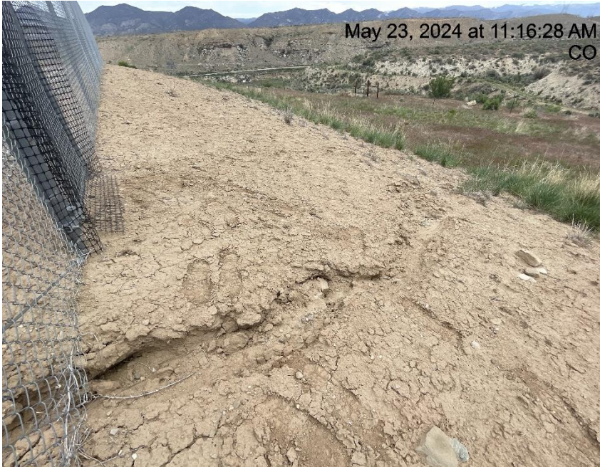
Photo # 8212 Erosion & transport of sediment into a vegetated area (East side of location)