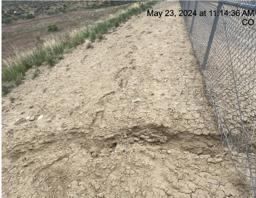
Photo # 8210 Erosion & transport of sediment (East side of location)