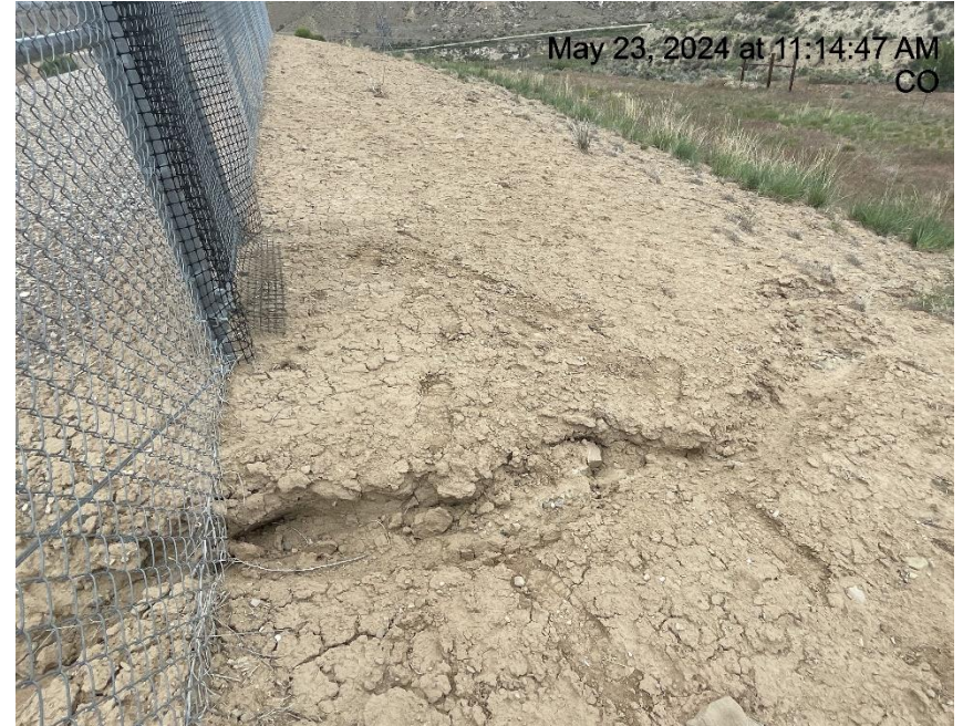
Photo # 8211 Erosion & transport of sediment into a vegetated area (East side of location)