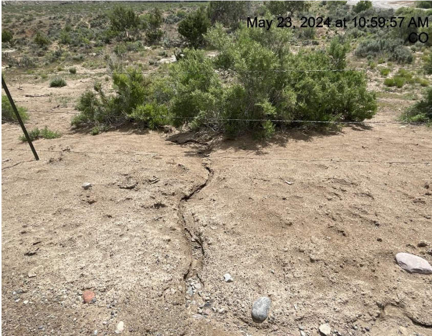
Photo # 8214 Erosion & transport of sediment into a vegetated area (E/SE area of location)