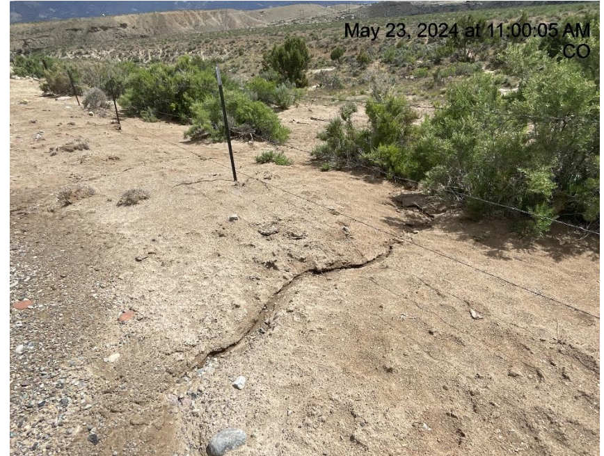
Photo # 8213 Erosion & transport of sediment into a vegetated area (E/SE area of location)