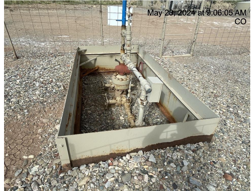
Photo # 8100 Wellhead cellar lacks wildlife protection /wildlife hazard/available for entry by wildlife. Cellar also lacks wildlife egress.