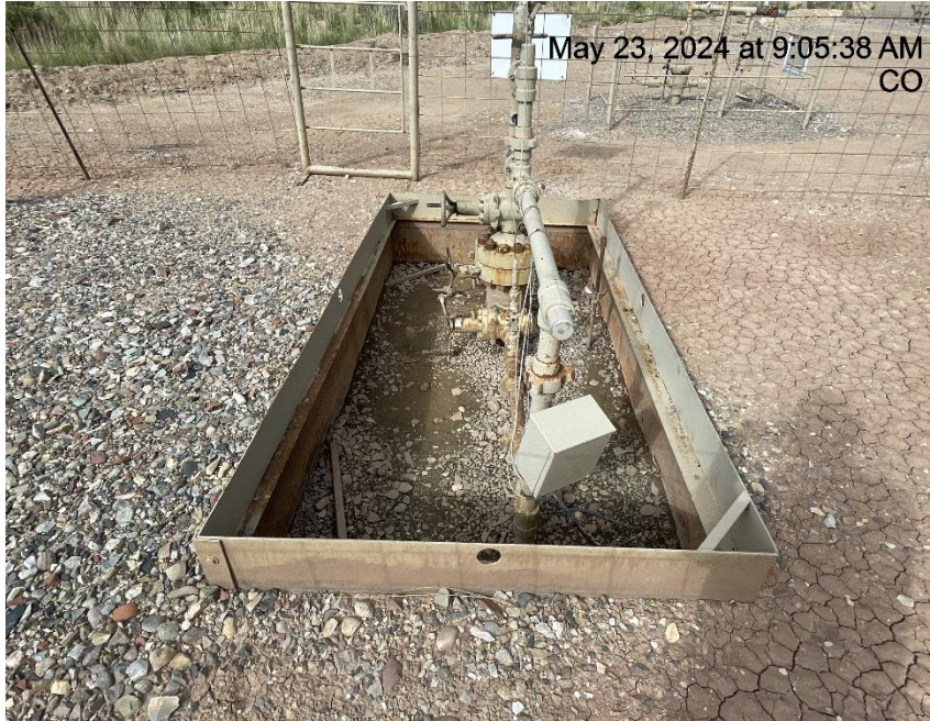
Photo # 8097 Wellhead cellar lacks wildlife protection /wildlife hazard/available for entry by wildlife. Cellar also lacks wildlife egress.