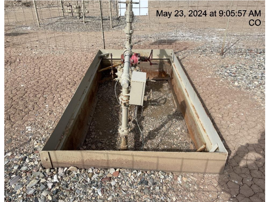
Photo # 8098 Wellhead cellar lacks wildlife protection /wildlife hazard/available for entry by wildlife. Cellar also lacks wildlife egress.