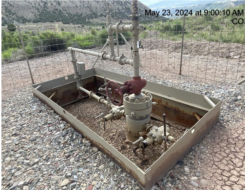
Photo # 8099 Wellhead cellar lacks wildlife protection /wildlife hazard/available for entry by wildlife. Cellar also lacks wildlife egress.