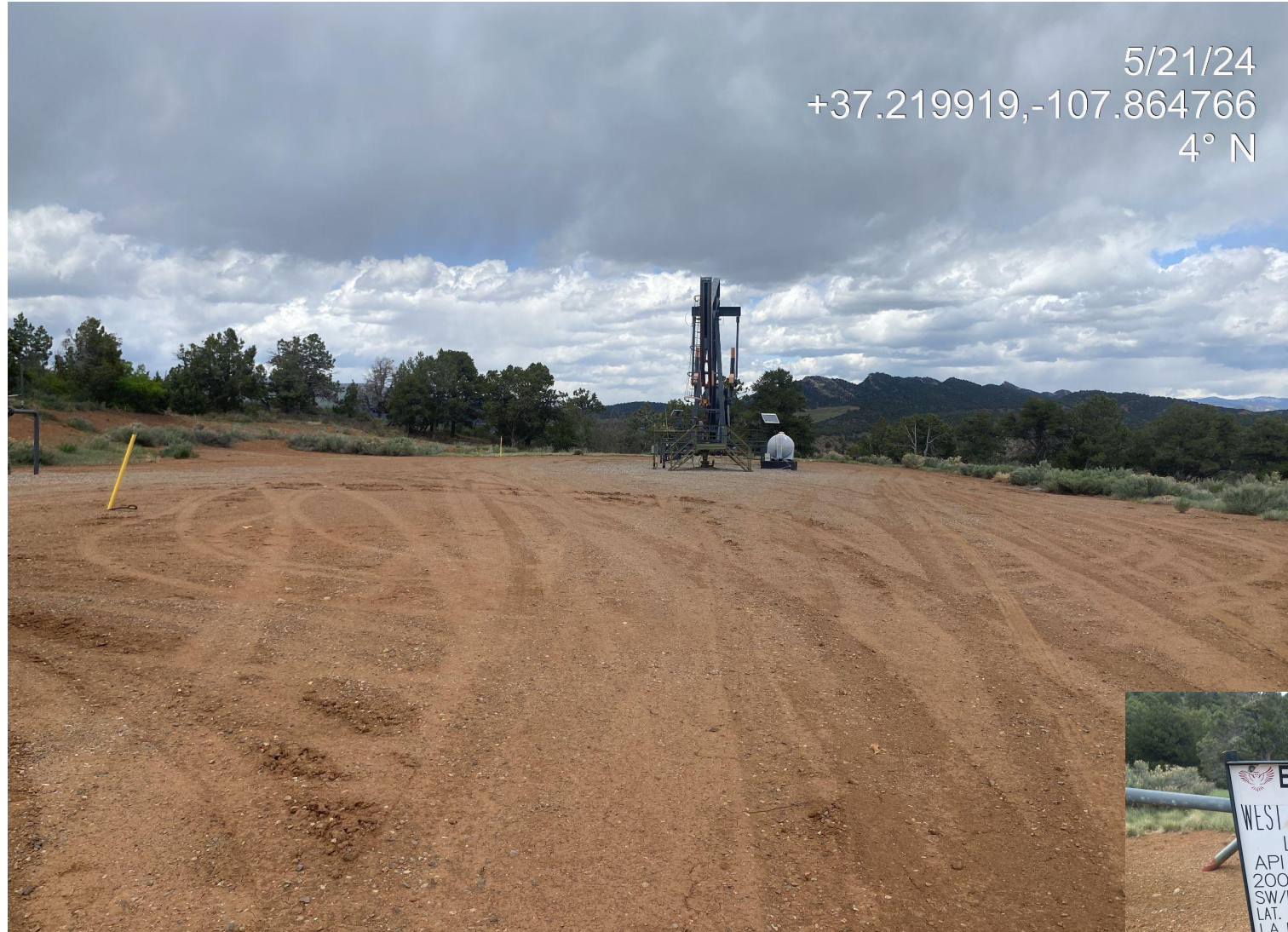
Photo 1. View of the well pad taken from the access point facing center.