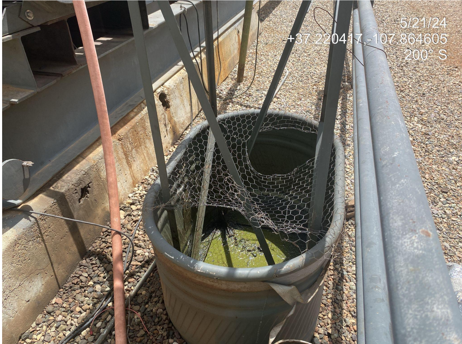
Photo 3. Wildlife netting BMP on lube tank secondary containment is no longer functioning, maintenance is needed.