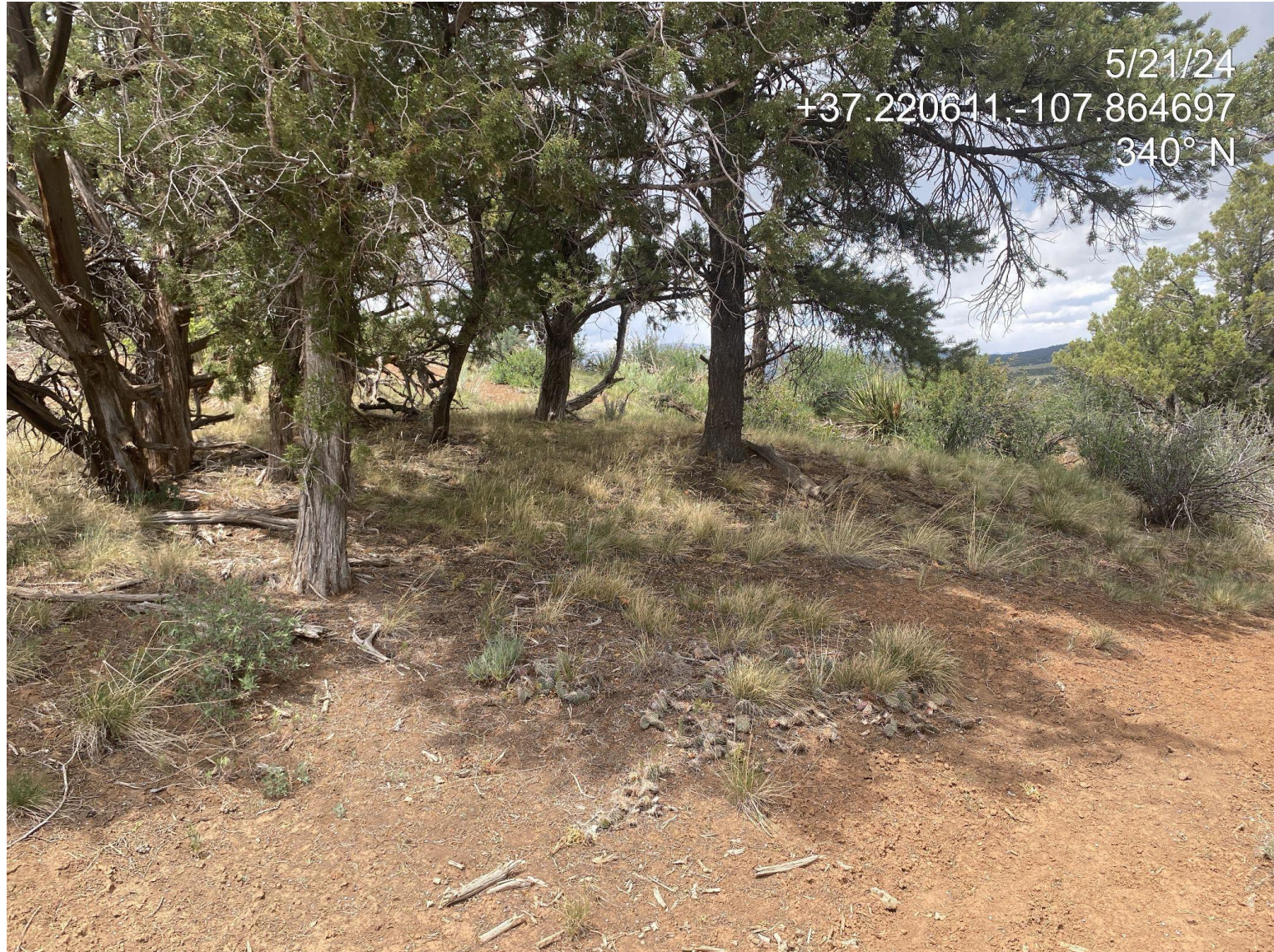
Photo 4. Reference area comprised of juniper, mountain mahogany, and sandberg bluegrass.