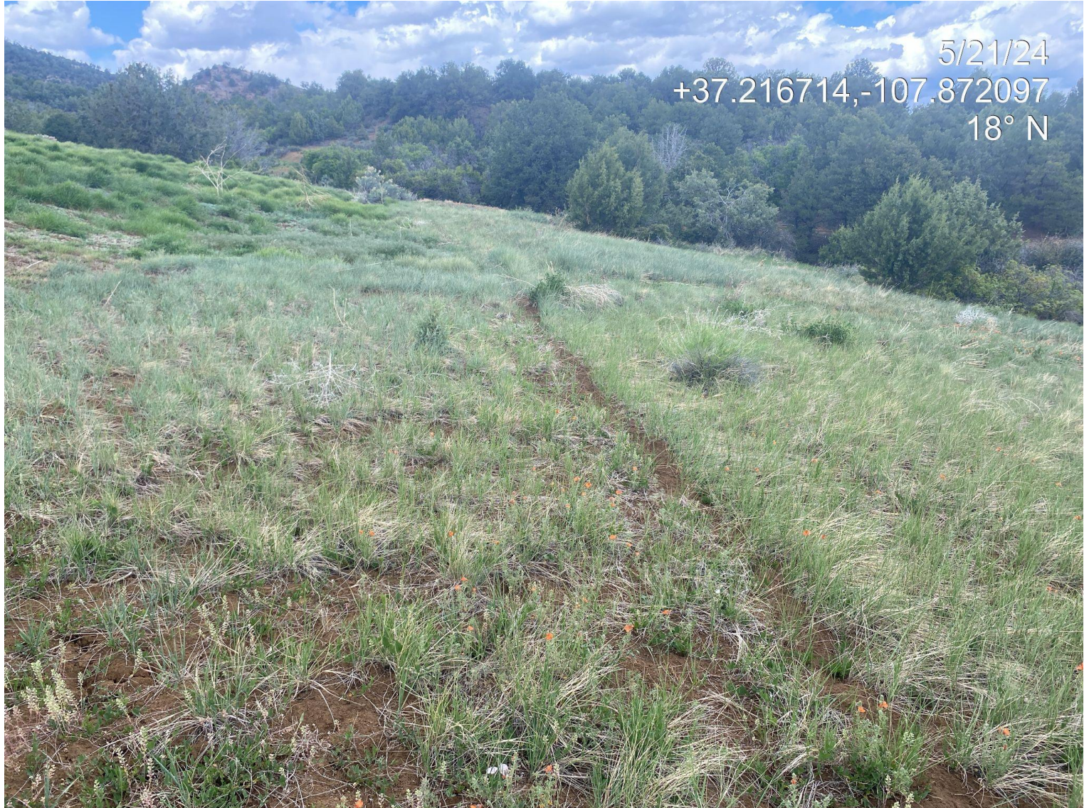
Photo 3. Storm water corrective action identified in the previous inspection doc #714000030 has been addressed/resolved.