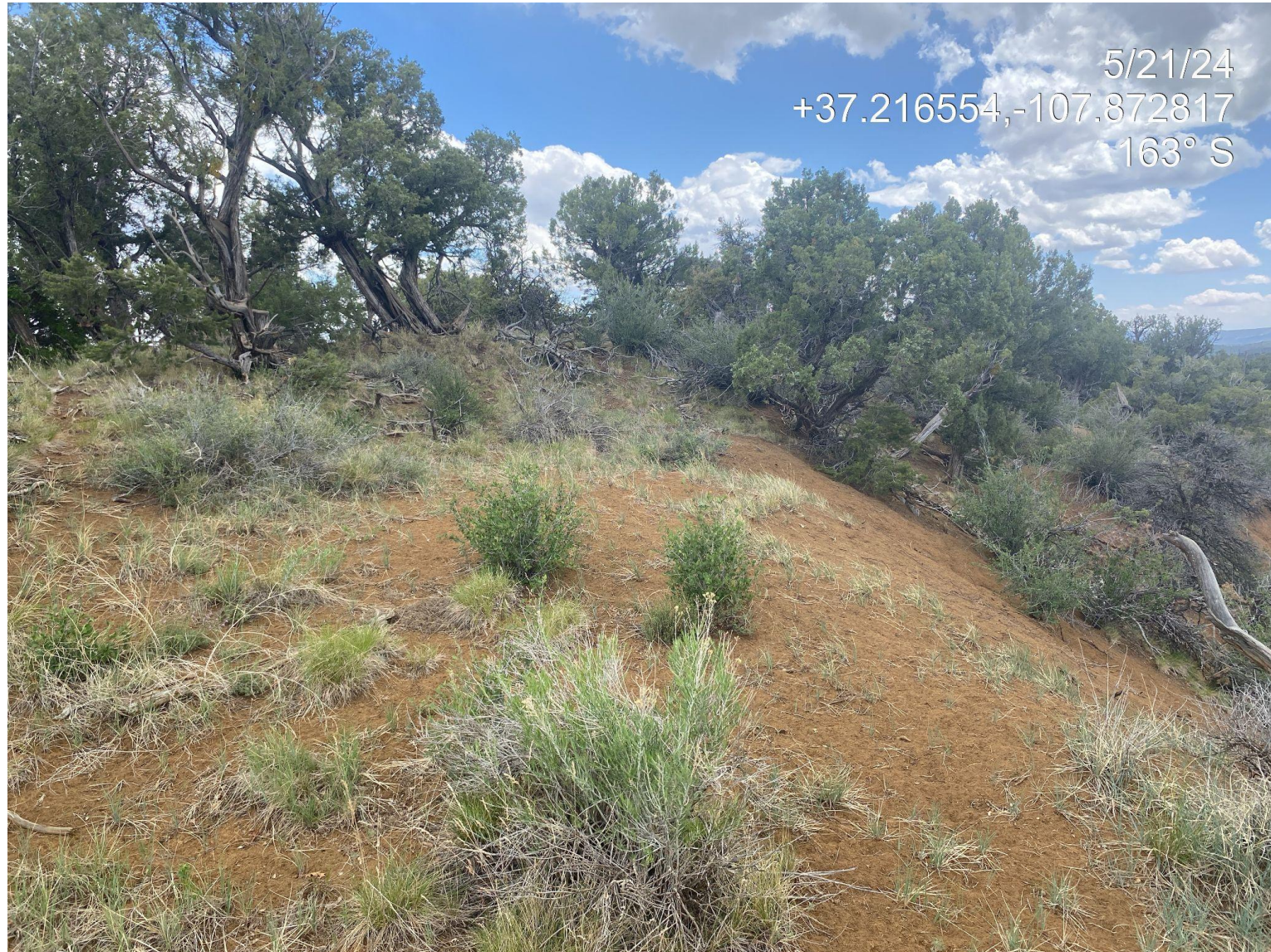
Photo 6. View of the reference area comprised of rabbitbrush, indian rice grass, mountain mahogany and juniper.