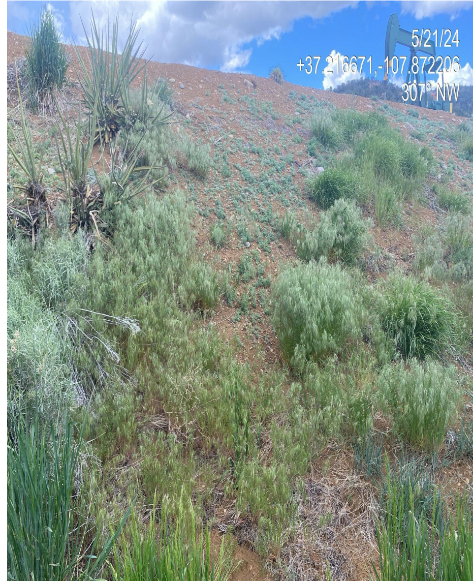
Photo 5. Large patches of cheatgrass observed in the eastern portion of the disturbance along the fill slopes.