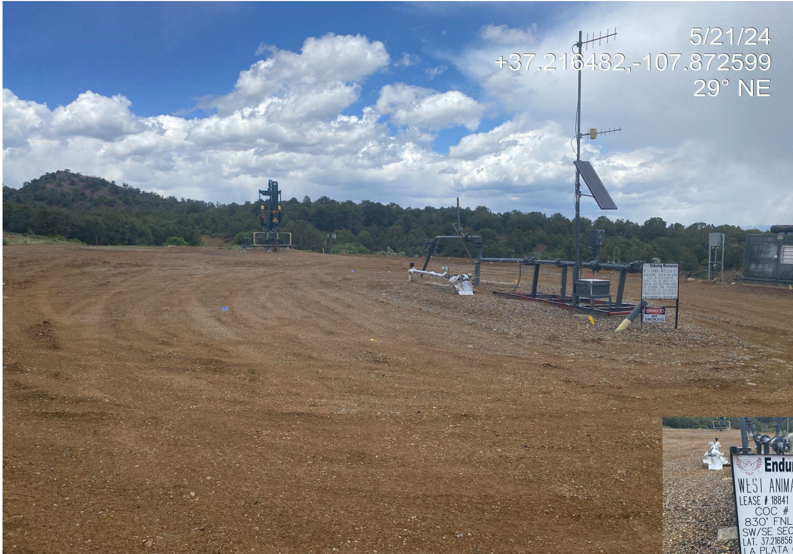
Photo 1. View of the well pad taken from the access point facing center.