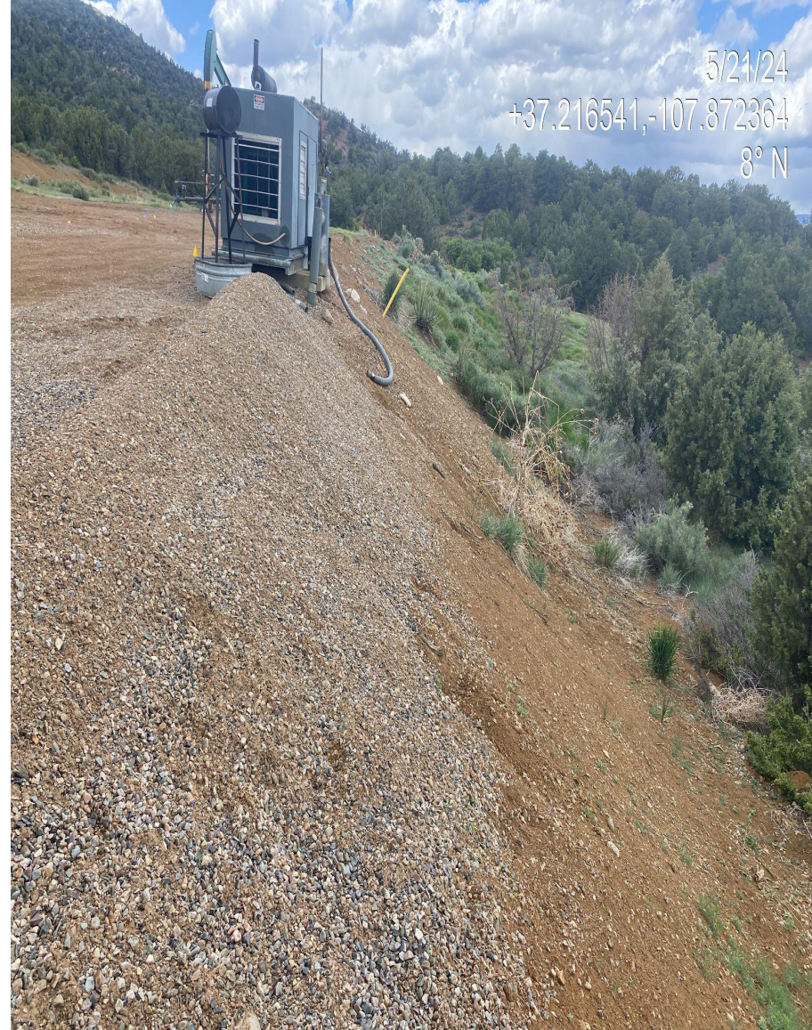
Photo 2. Storm water corrective action identified in the previous inspection doc #714000030 has been addressed/resolved.