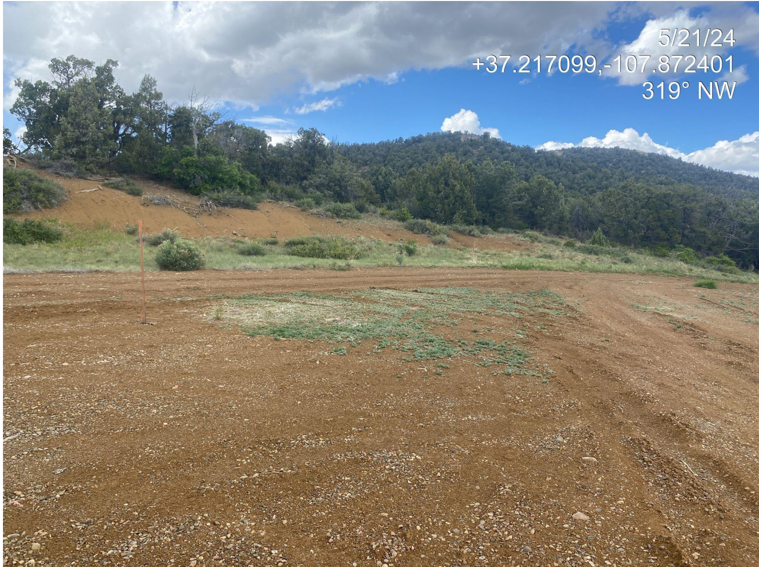
Photo 4. Weedy kochia debris corrective action identified in the previous inspection doc #714000030 has been addressed/resolved.