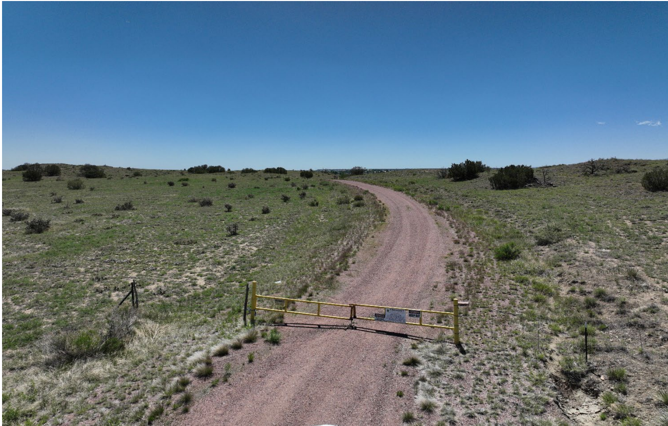
Photo 1. Drone photo facing southeast at the beginning of the access road. The access road has not been reclaimed.