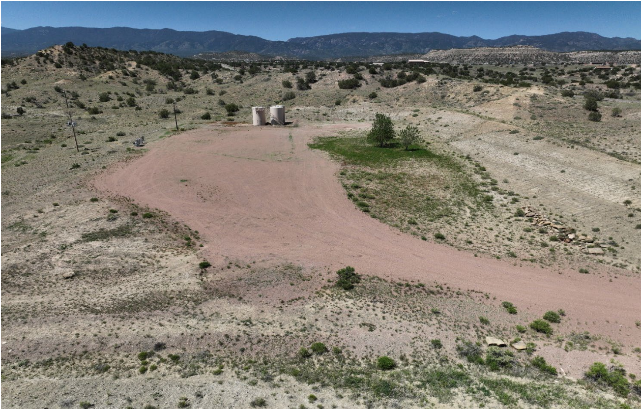
Photo 2. Drone photo facing south toward the location. The well has been plugged and abandoned however final reclamation has not yet been completed.