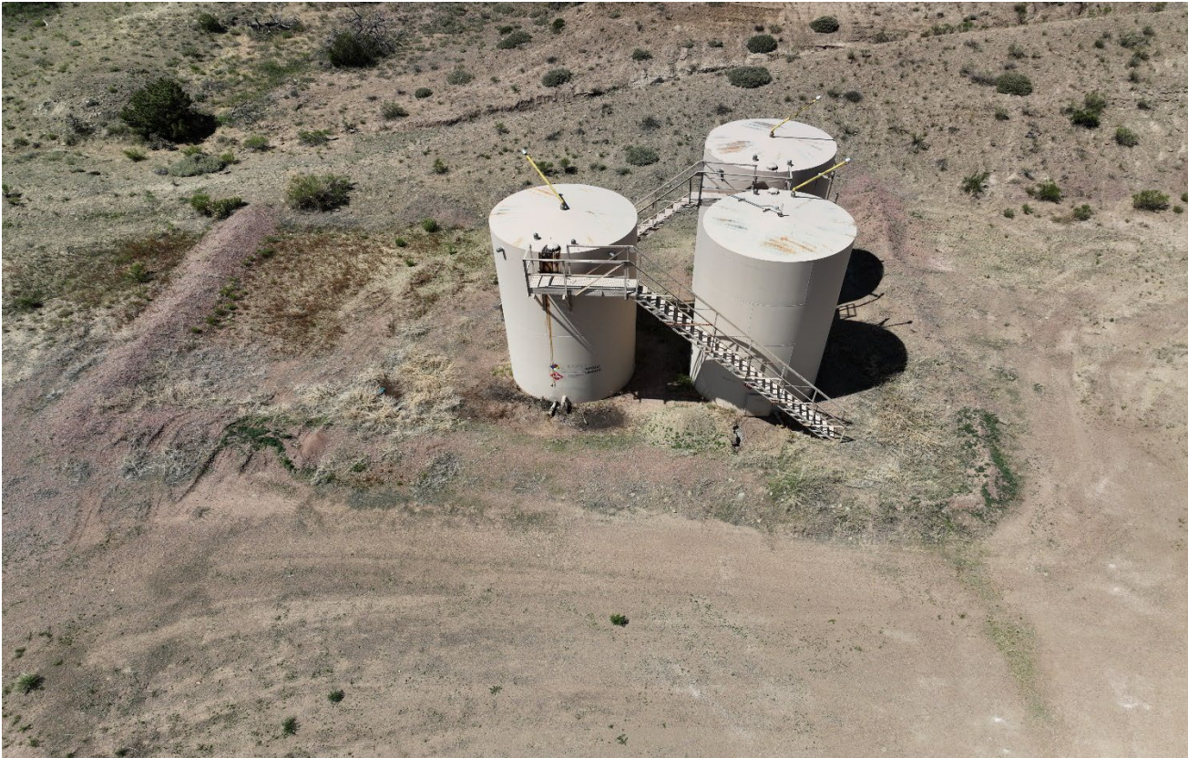
Photo 5. Facing toward the south side of the location. There are tanks that have not been removed. All equipment should have been removed within 3 months of abandonment.