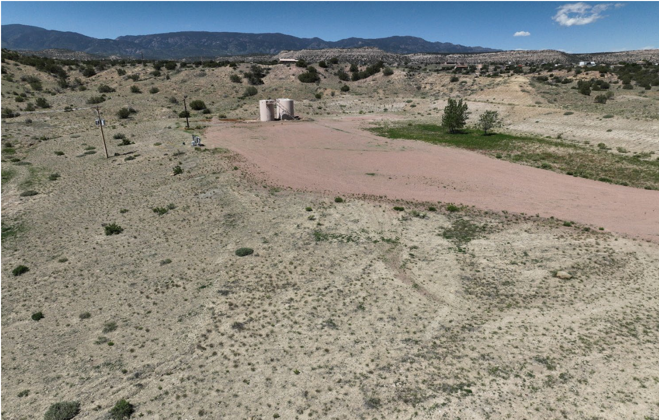
Photo 3. Facing southwest along the fill slope. The location will need to be reocntoured back to the original slopes.