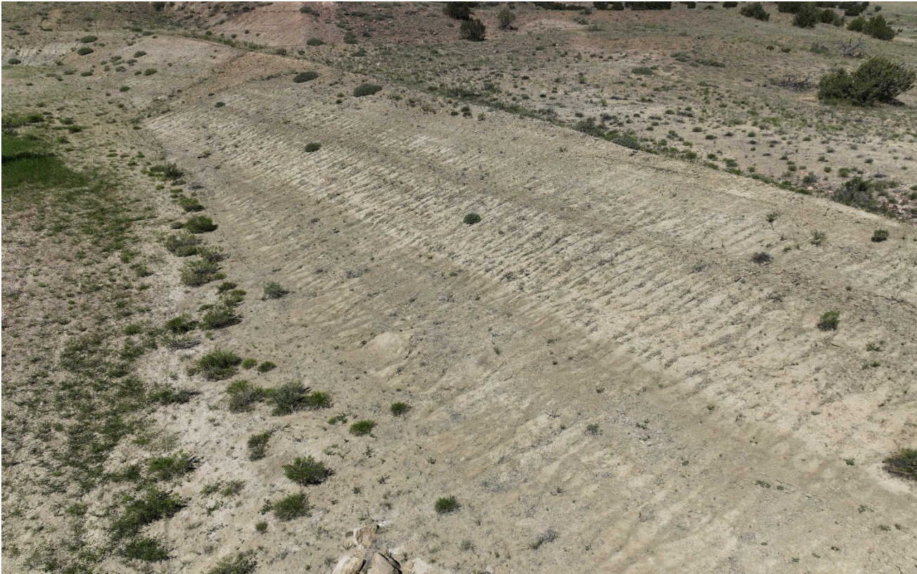
Photo 7. Facing southwest along the cut slope. The cut slope is not stabilized and there are signs of rilling erosion.