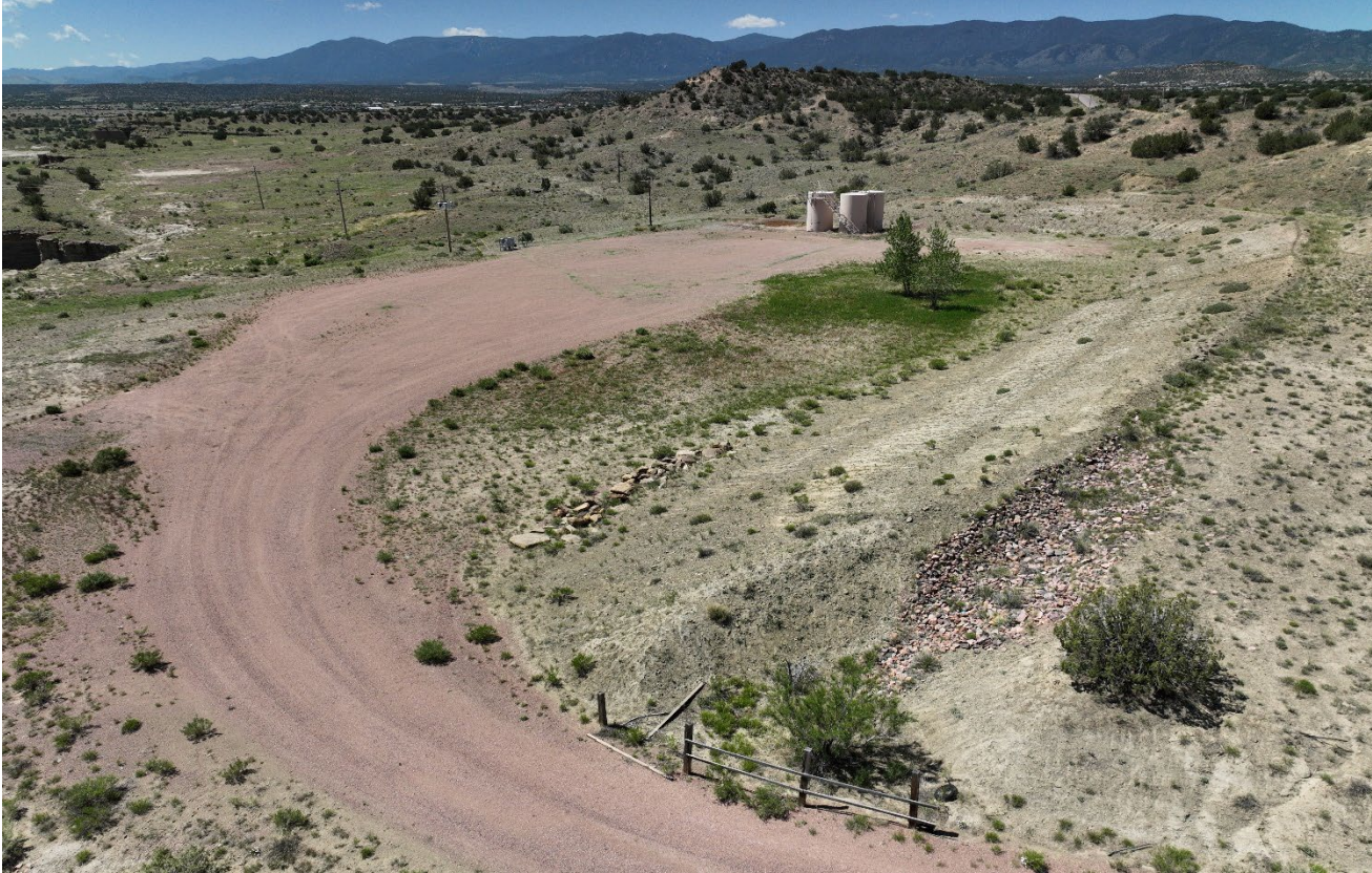
Photo 8. Drone photo aching south toward the location.