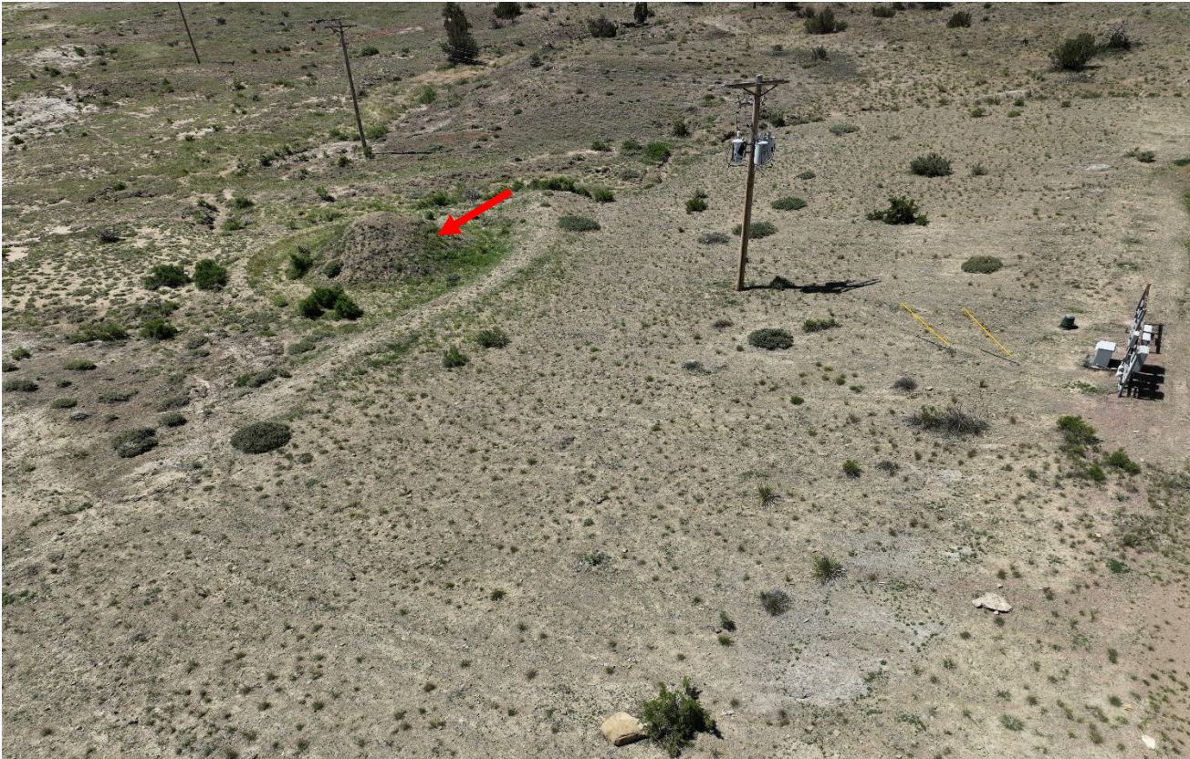
Photo 4. The electric utilities remain at the location and should have been removed with 3 months of abandonment. The entire powerline and poles servicing this location must be removed. There is a topsoil pile shown at red arrow.