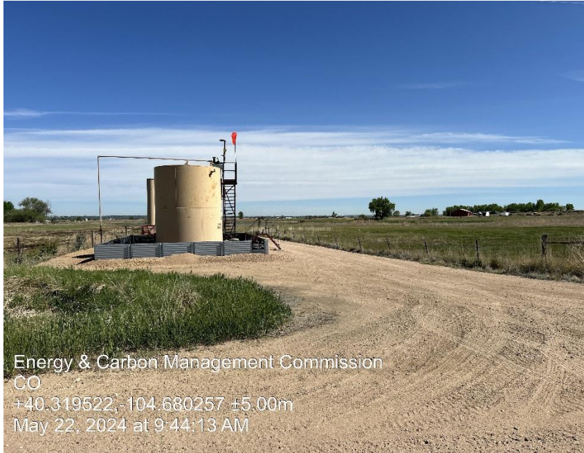
Photo 1 Entrance to location