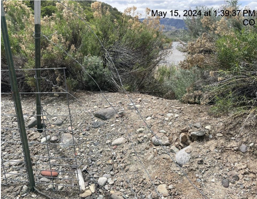
Photo # 7067 Barbed wire laying on ground/wildlife hazard (NW corner of location near separator units)