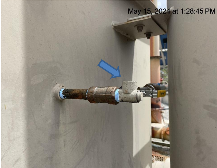
Photo # 7071 PRV does not comply with CECMC pressure safety device rules