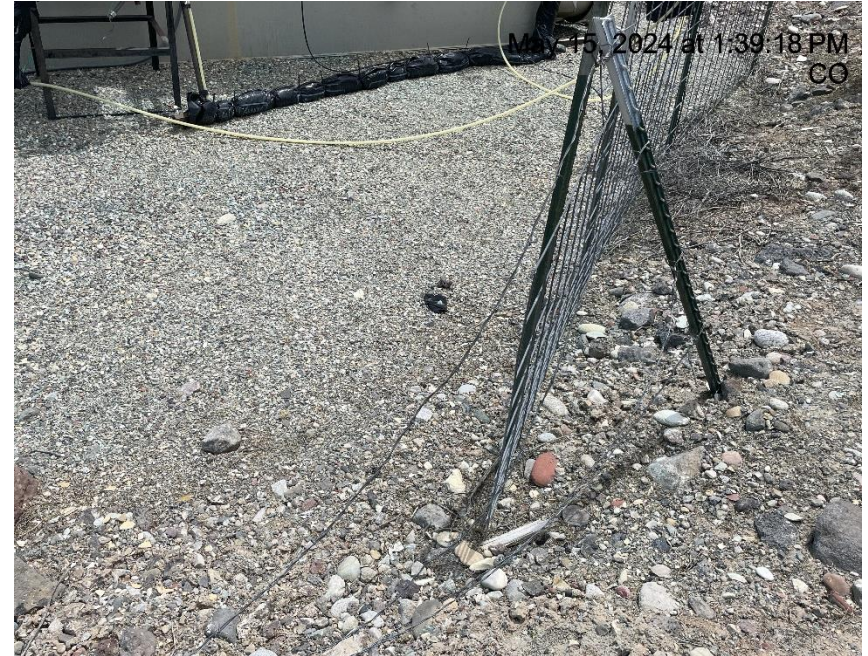
Photo # 7066 Barbed wire laying on ground/wildlife hazard (NW corner of location near separator units)