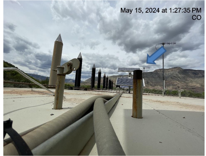
Photo # 7070 Rupture disc vent line lacks cap/does not comply with CECMC pressure safety device rules