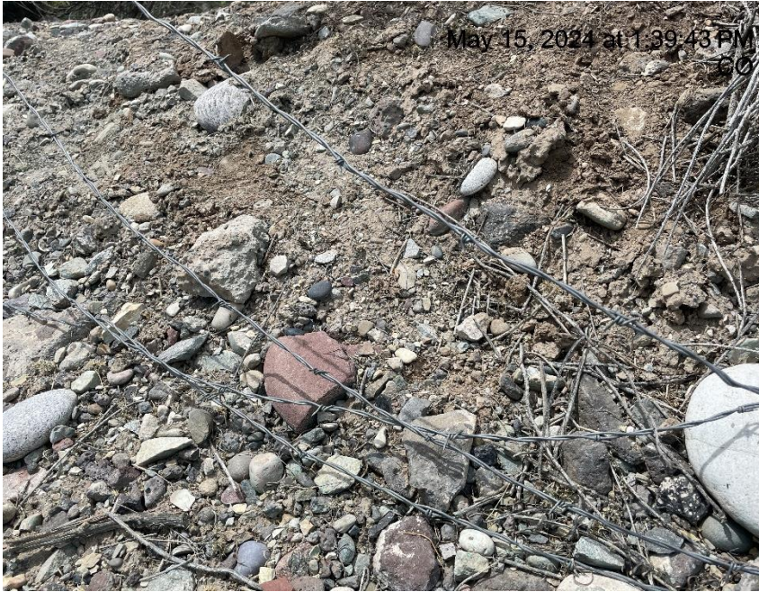
Photo # 7069 Barbed wire laying on ground/wildlife hazard (NW corner of location near separator units)