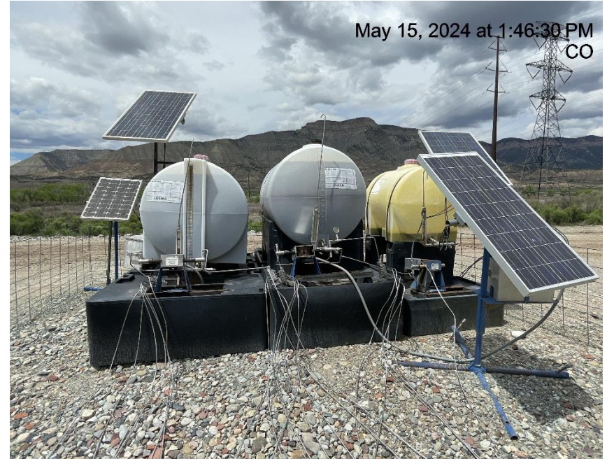
Photo # 7072 Some fluid in 2 of 3 chemical tank containments, may need maintenance in the near future.