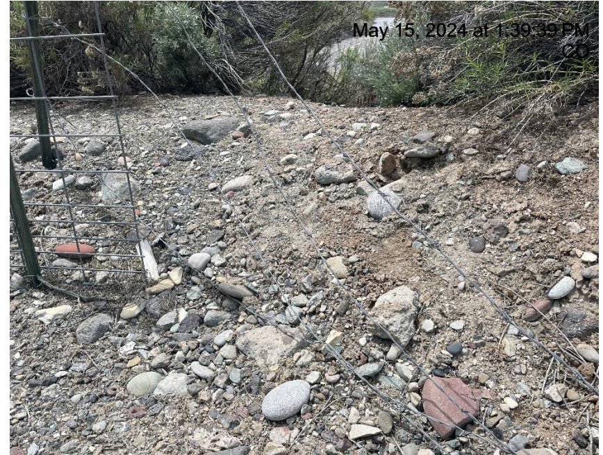
Photo # 7068 Barbed wire laying on ground/wildlife hazard (NW corner of location near separator units)