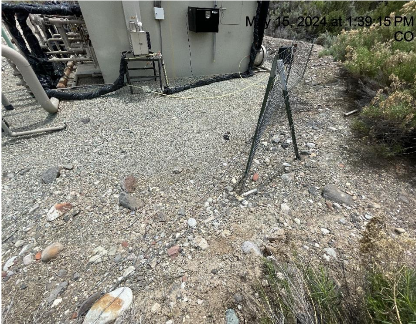
Photo # 7065 Barbed wire laying on ground/wildlife hazard (NW corner of location near separator units)