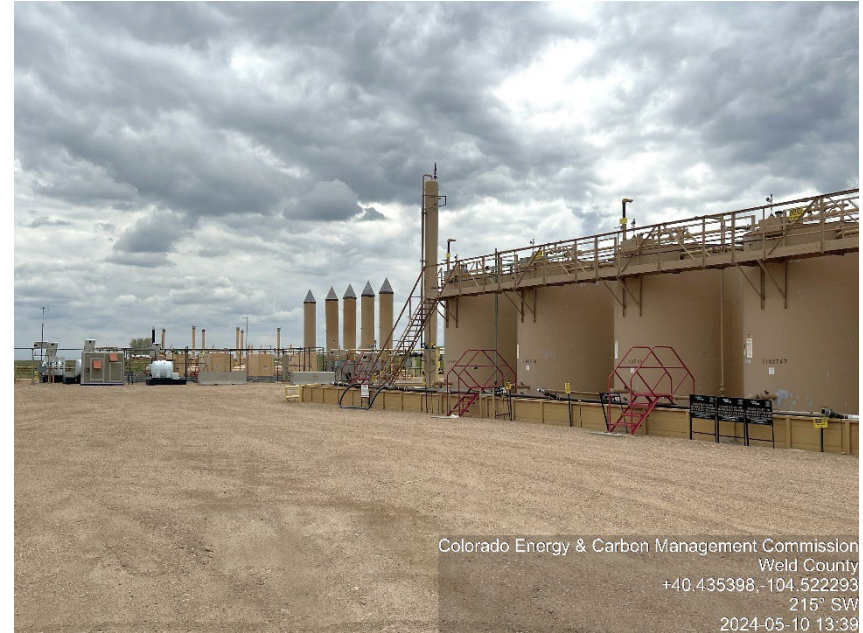
Cougar B 02-68-1HN, B 02-69-1HN, B 02-67-1HN