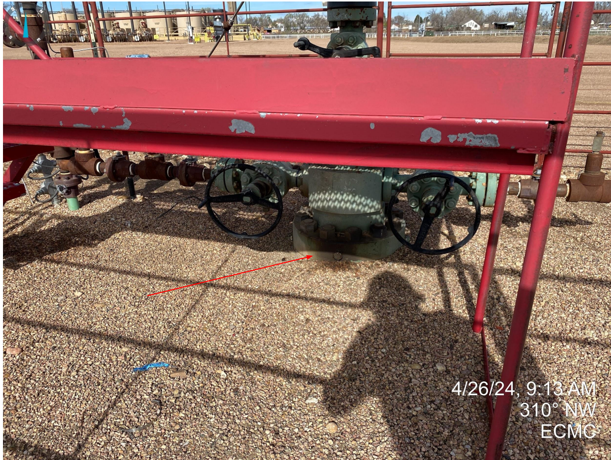
Photo 5. Stained soil around wellheads and Hydrocarbon staining on wellhead equipment - inspect mechanical conditions.