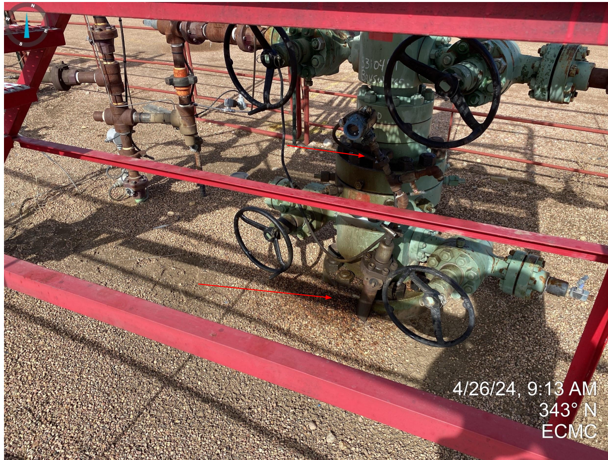
Photo 6. Stained soil around wellheads and Hydrocarbon staining on wellhead equipment - inspect mechanical conditions.