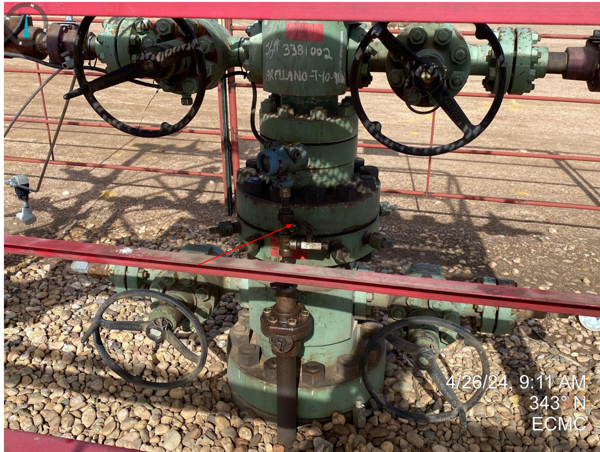
Photo 2. Hydrocarbon staining on wellhead equipment - inspect mechanical conditions.