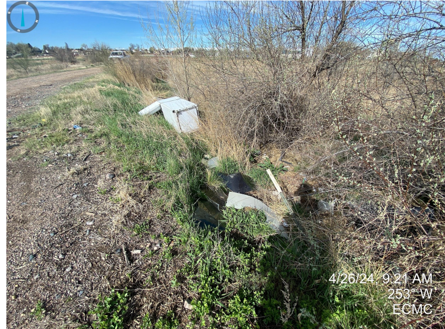
Photo 12 & 13. Trash observed near the location's entrance. Operator shall self inspect the entire location and remove any trash/debris.