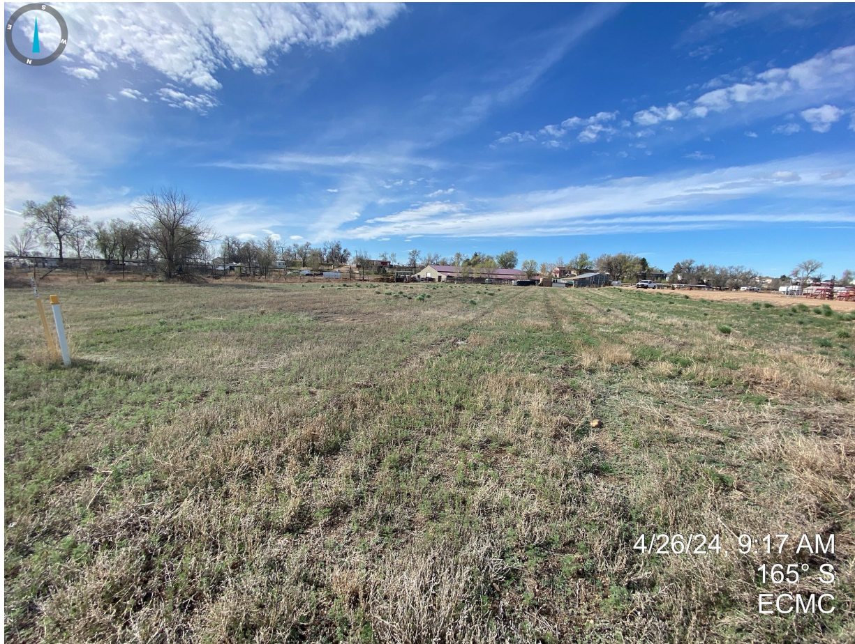
Photo 10. Eastern interim areas are predominantly undesirable vegetation (e.g. kochia). Additional reclamation activities are required.