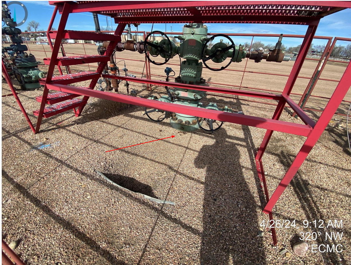
Photo 4. Stained soil around wellheads.