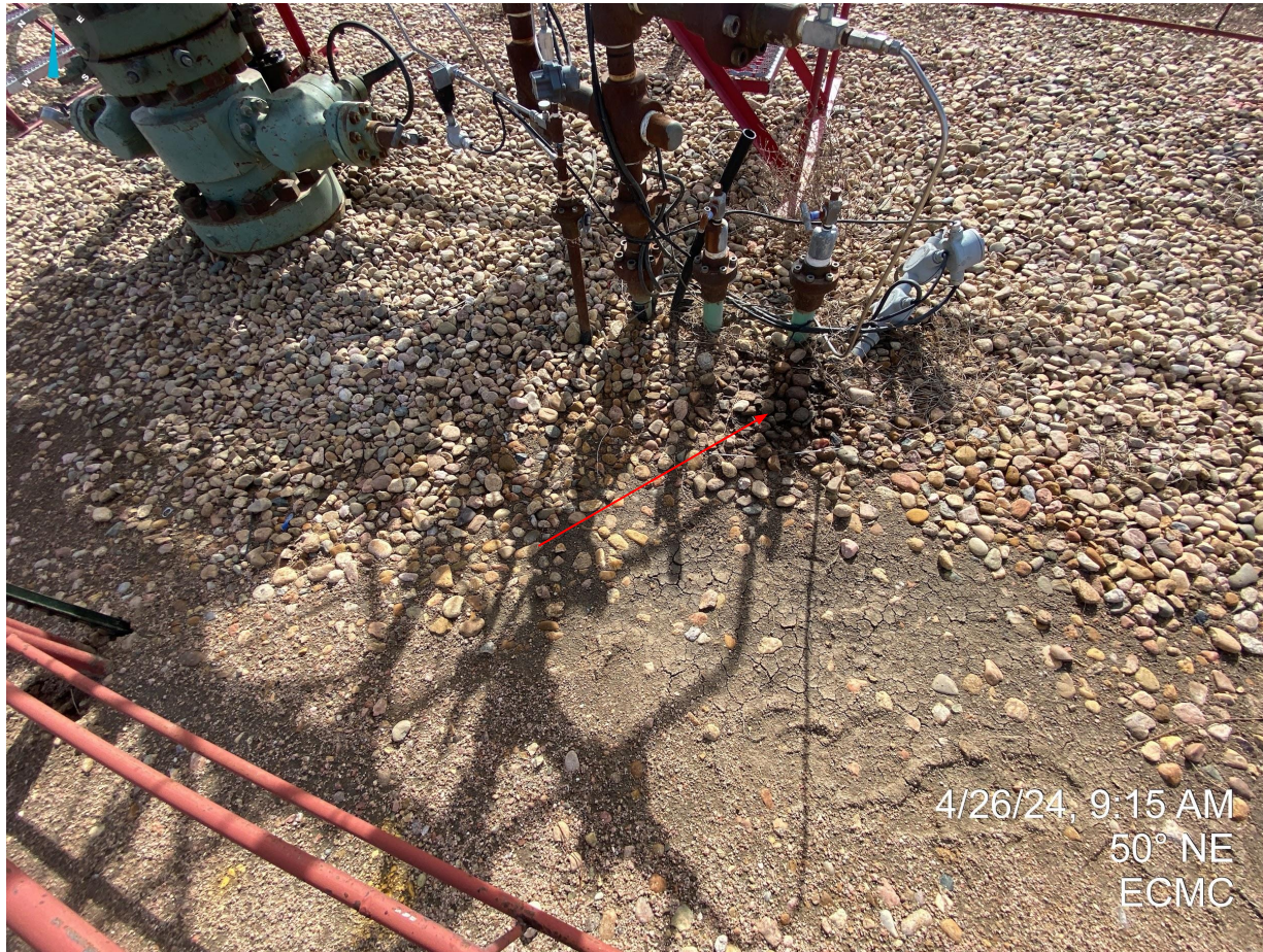
Photo 7. Stained soil around wellheads and Hydrocarbon staining on wellhead equipment - inspect mechanical conditions.