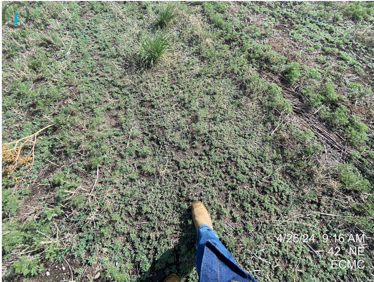
Photo 9. Close up photo of Kochia.