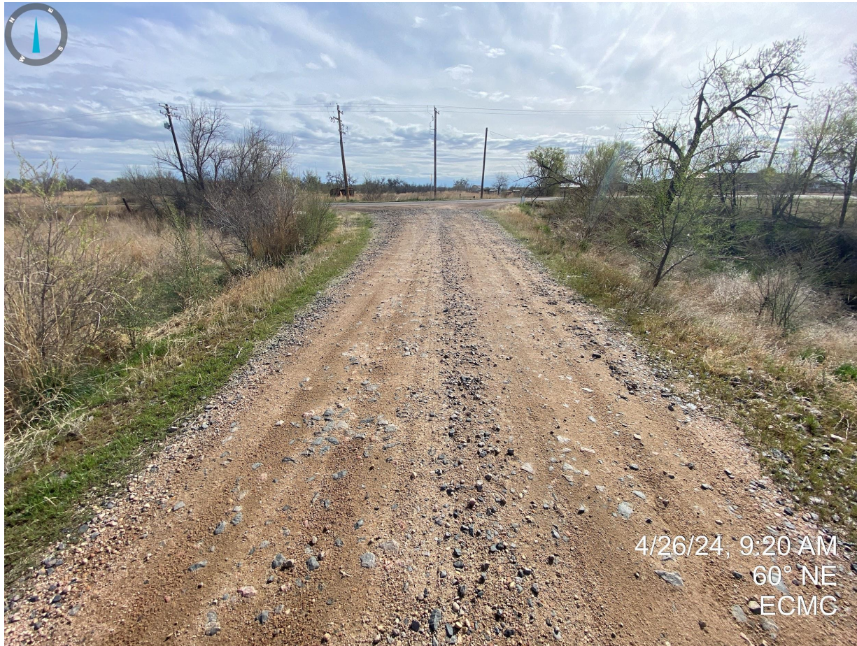
Photo 11. Vehicle track out pad requires maintenance.