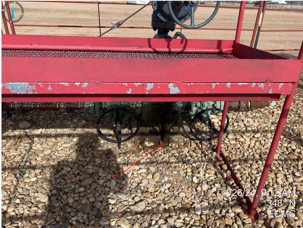
Photo 3. Stained soil around wellheads and Hydrocarbon staining on wellhead equipment - inspect mechanical conditions.