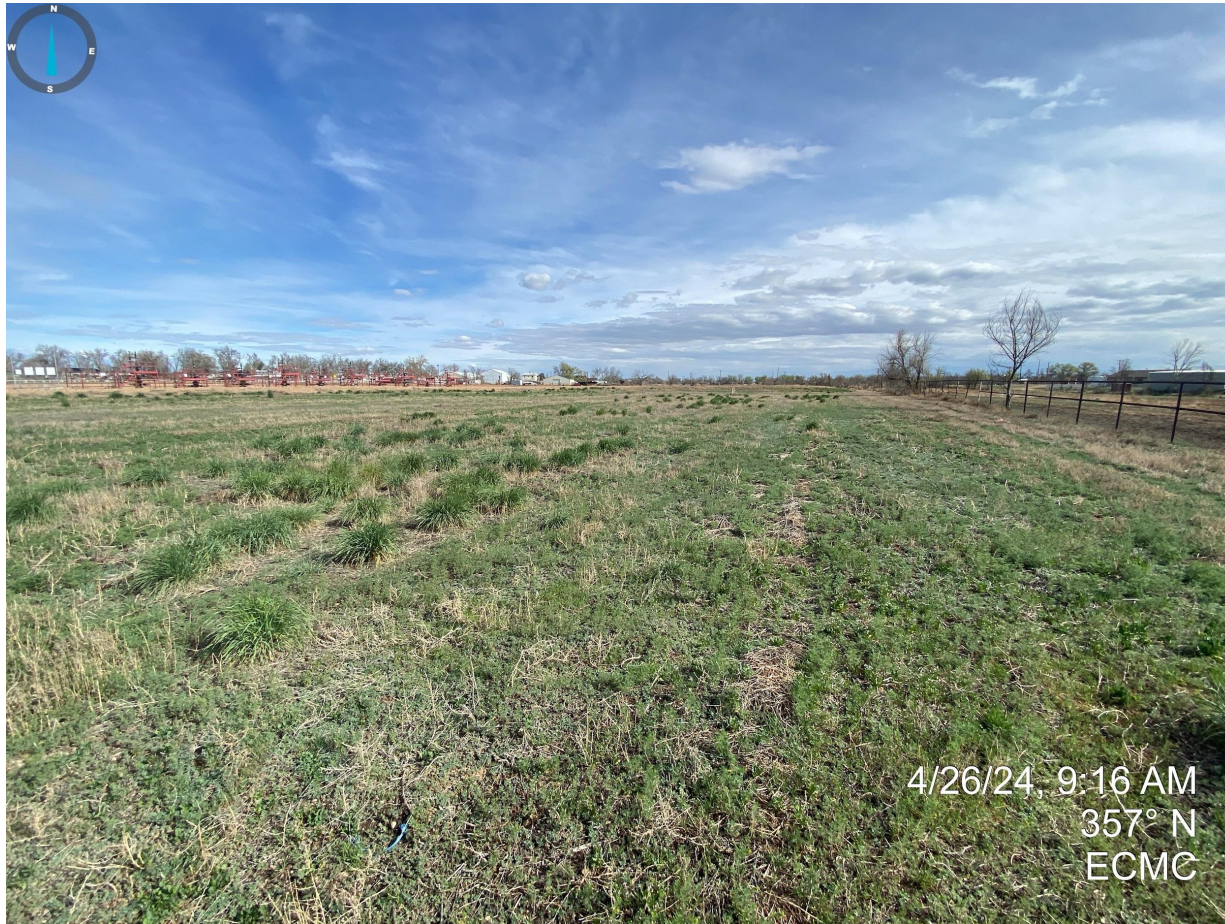
Photo 8. Eastern interim areas are predominantly undesirable vegetation (e.g. kochia). Additional reclamation activities are required.