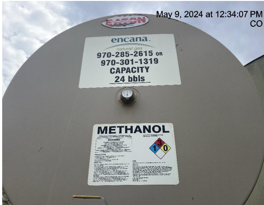
Photo # 6378 Inaccurate info on tank labeling/does not comply with CECMC rules