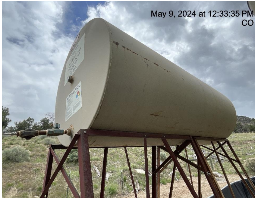
Photo # 6376 Inaccurate info on tank labeling/does not comply with CECMC rules