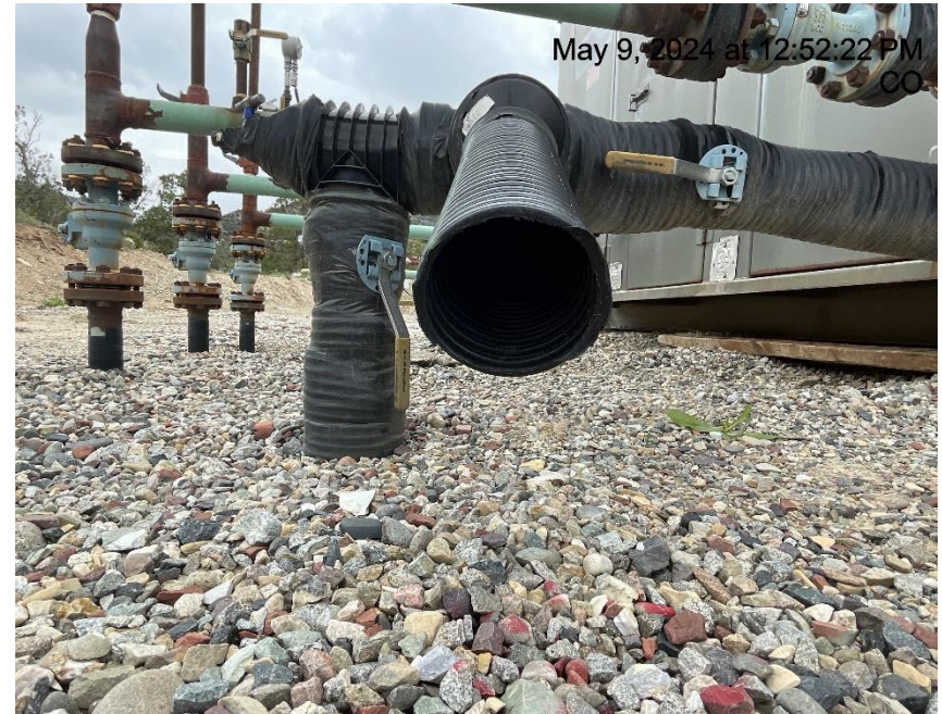
Photo # 6379 Flowline heating insulation open ended /wildlife hazard/available for entry by wildlife