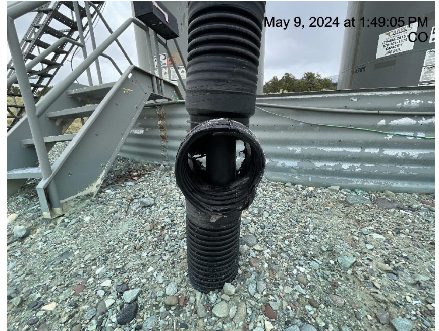
Photo # 6502 Flowline heating insulation open ended /wildlife hazard/available for entry by wildlife