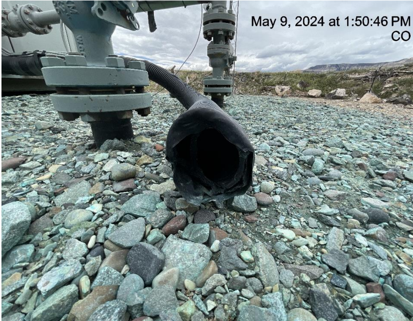
Photo # 6501 Flowline heating insulation open ended /wildlife hazard/available for entry by wildlife