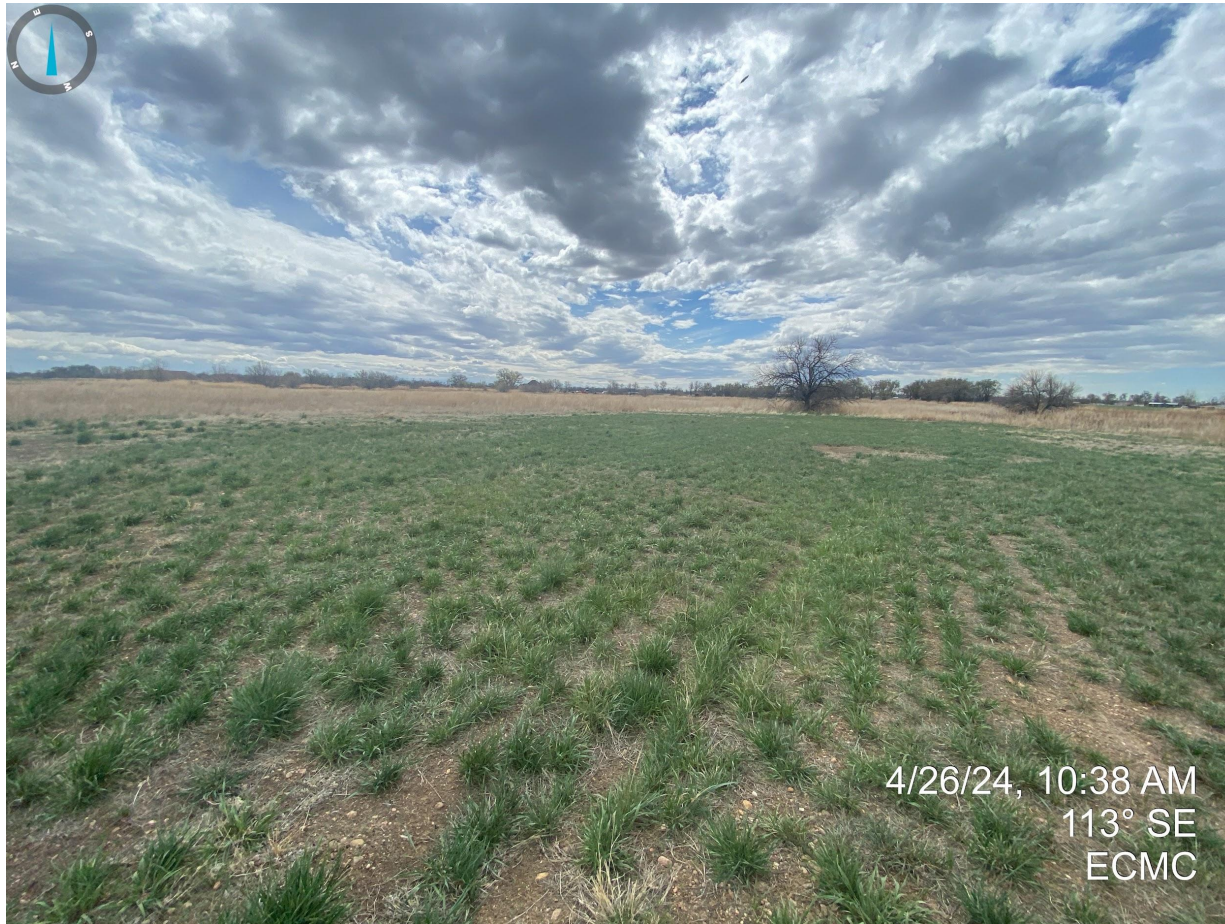
Photo 2. Facing southeast near the former well location. It appears that the portions of the former well location are progressing towards Rule 1004 standards.