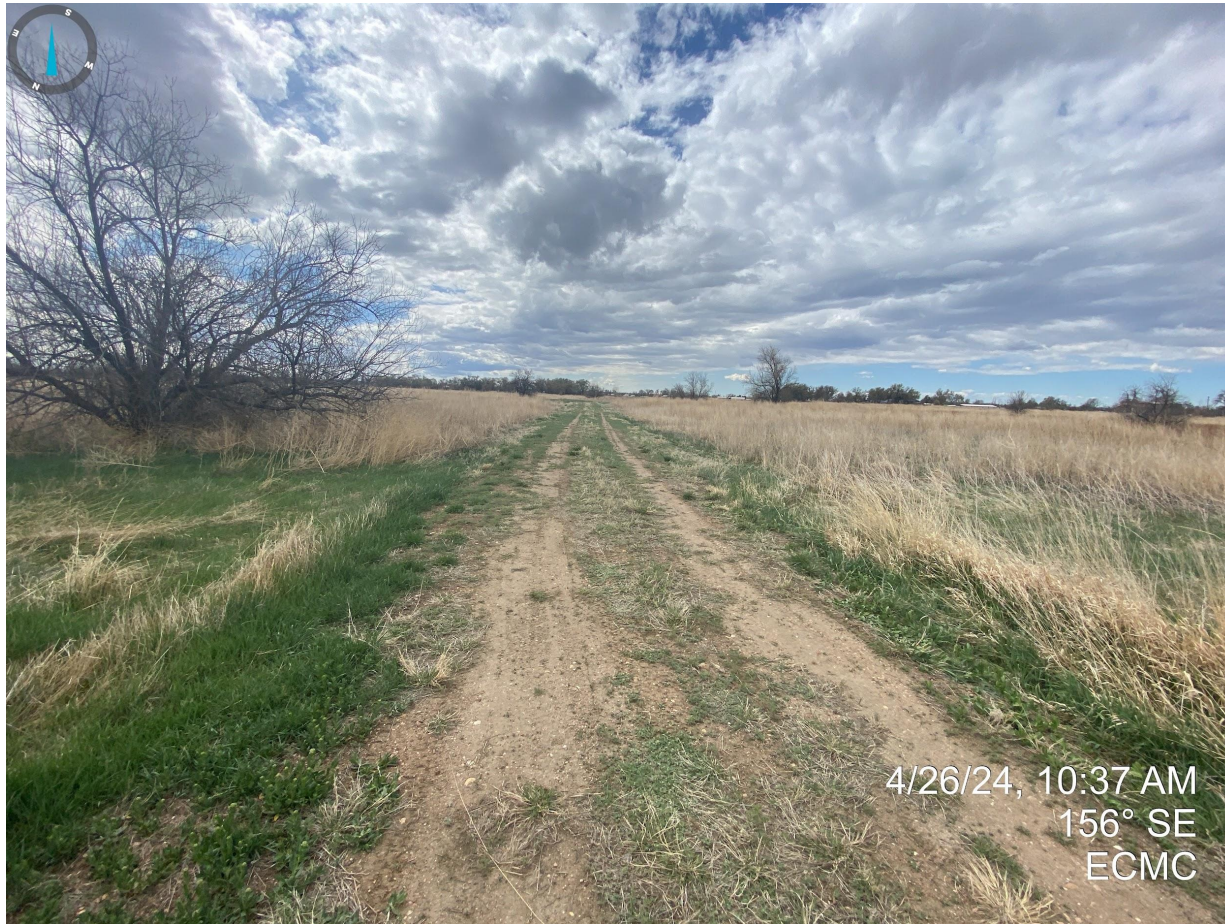
Photo 1. Facing southeast at the start of the access road. The access road has not been reclaimed per Rule 1004.