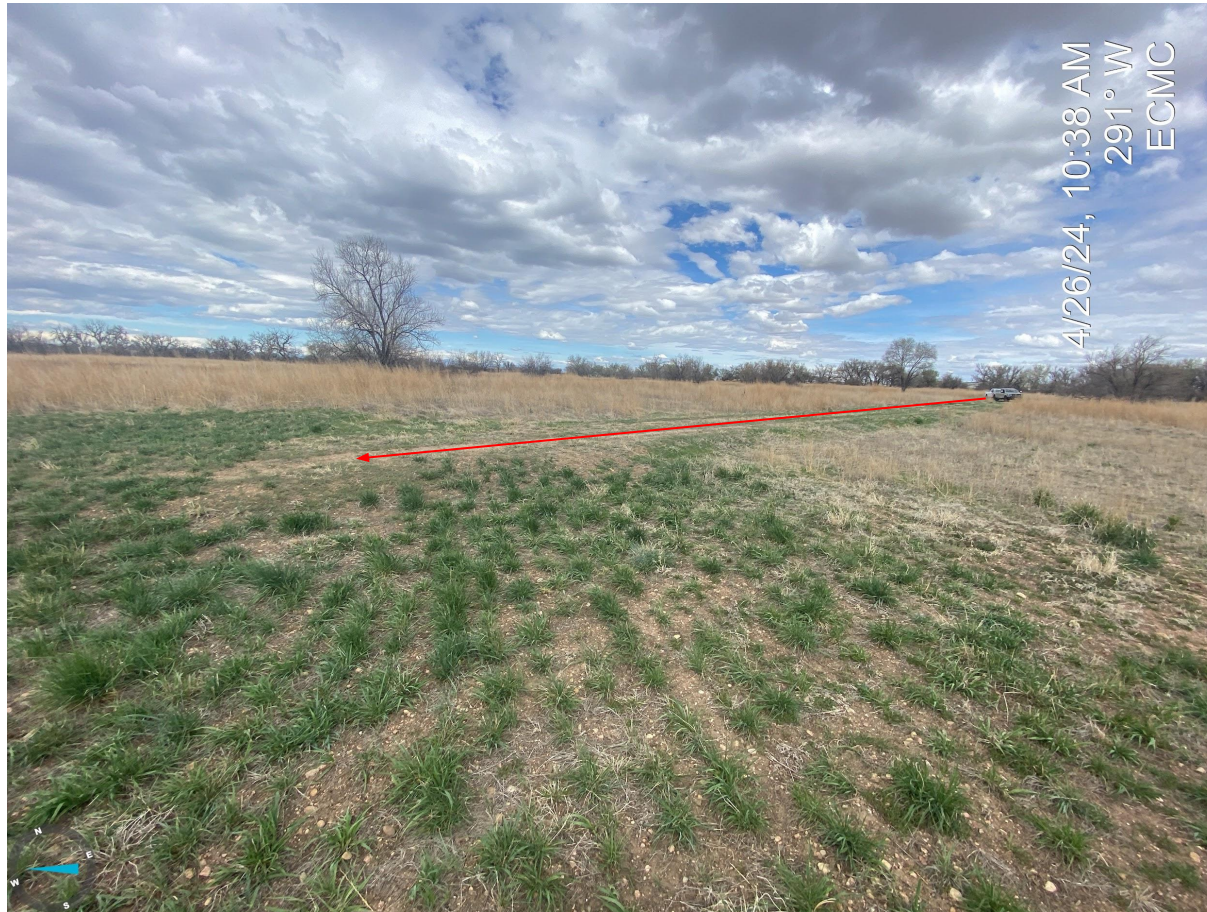
Photo 3. Facing west towards the access road which has not been reclaimed per the 1004 Rules.