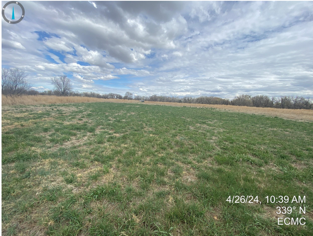
Photo 5. Taken from the northern portion of the reclaimed portion; see comments in Photo 2.