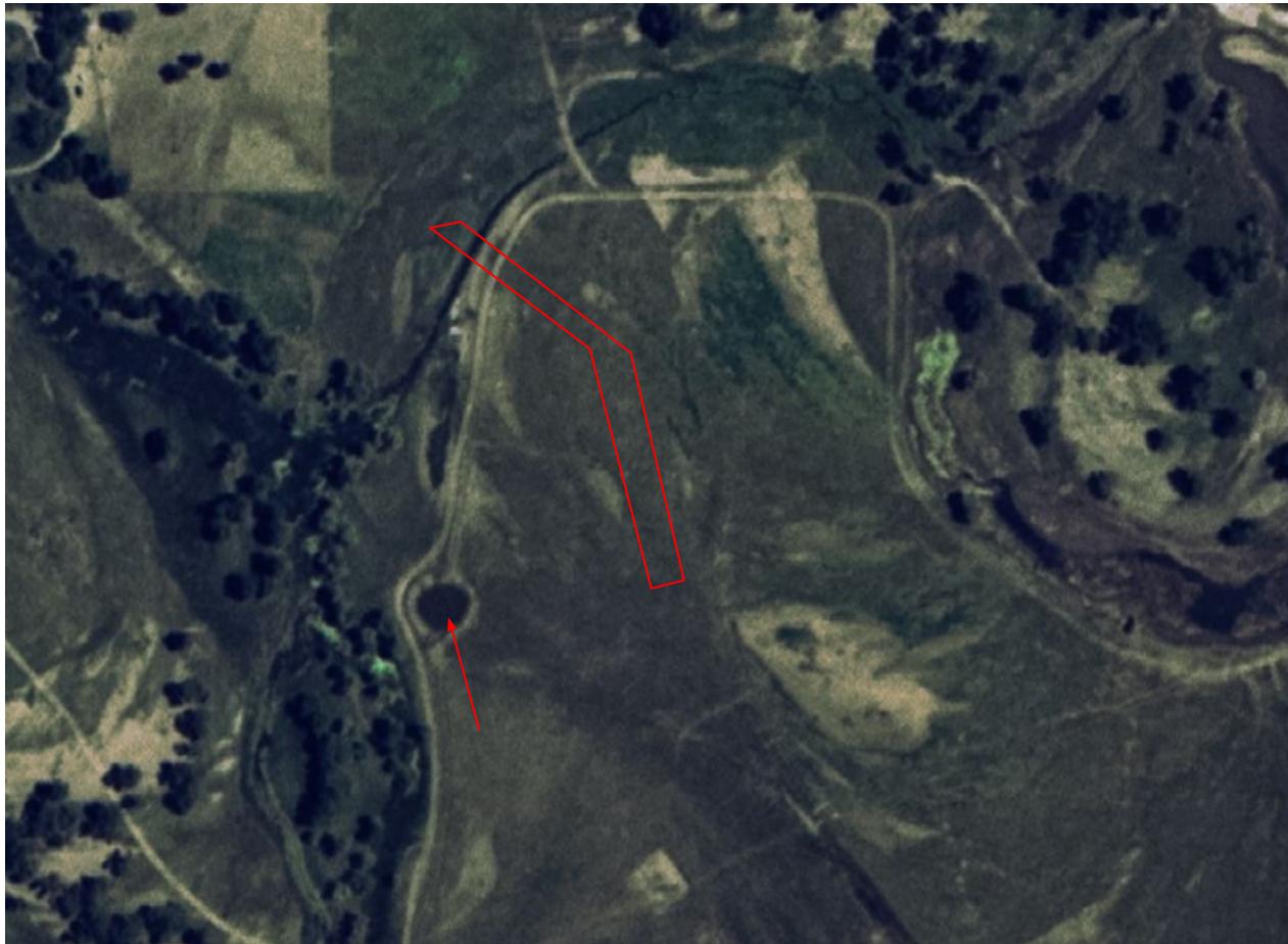
Photo 6. Historical imagery from 07/05/1978 illustrates that portions of the access road (outlined in red) did not exist prior to oil and gas development. Red arrow indicates a reference point (pond) for Photo 6 and Photo 7. Note - red polygon is approximate location of the access road as seen in Photo 7.