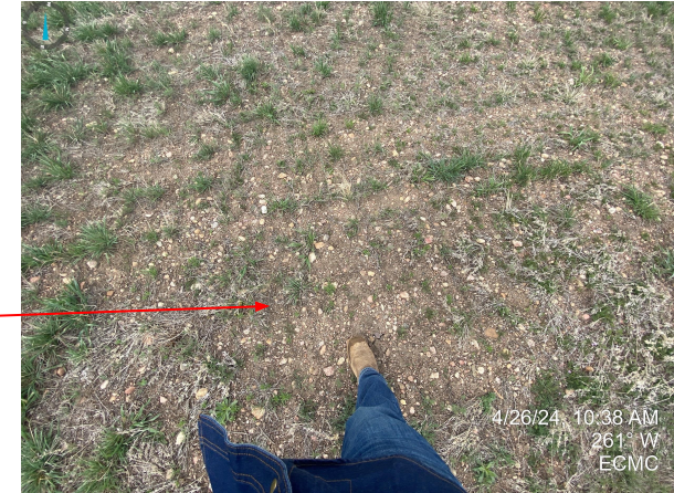
Photo 4. Road base material observed throughout portions of the reclaimed area next to the access road.