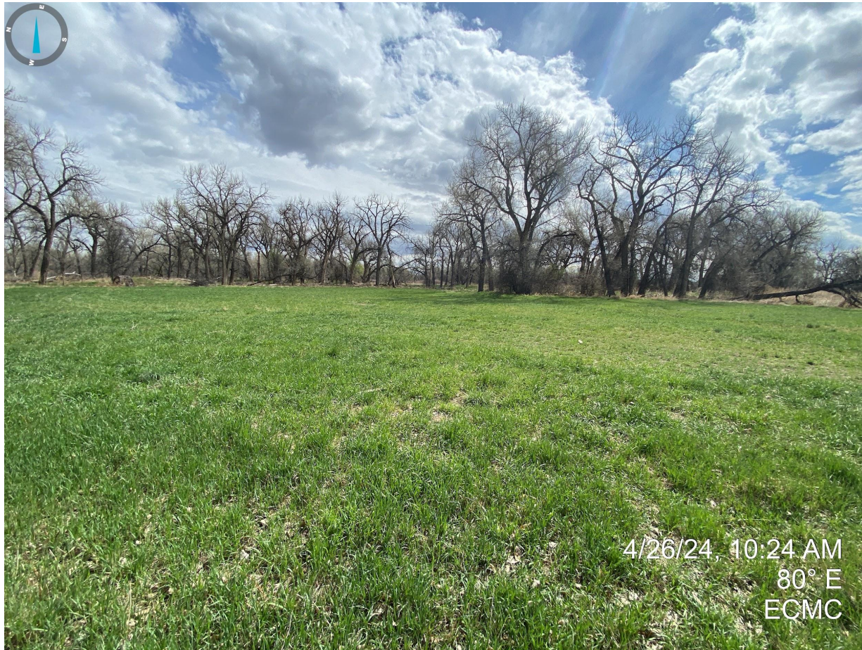
Photo 2. Facing east at the former well location.