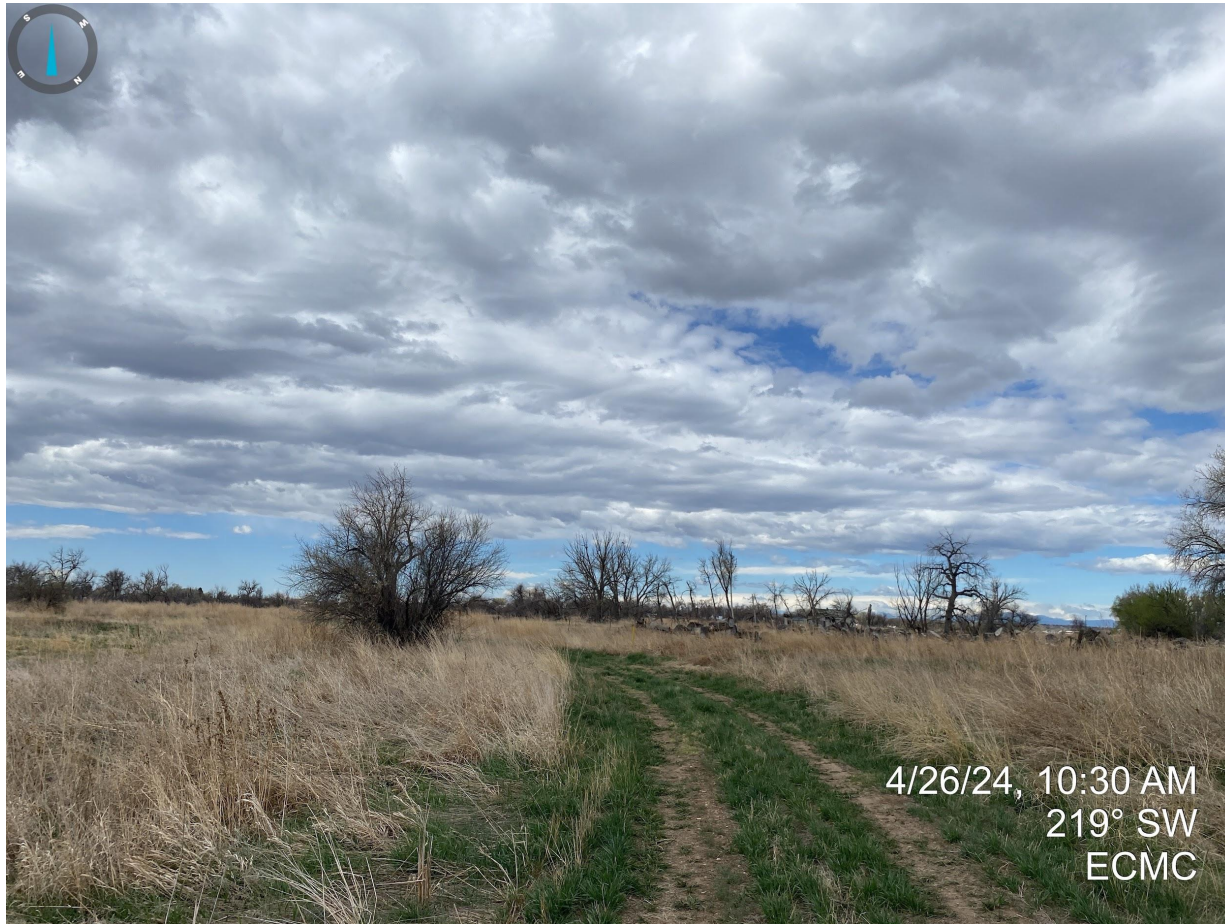
Photo 6. Facing southwest along the access road. Portions of the access road did not exist prior to oil and gas development. Refer to Photos 7 & 8 for additional information.