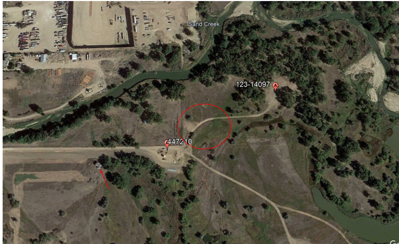
Photo 8. Google Earth aerial imagery taken circa 09/2018 illustrating the highlighted portion of the access road that did not exist prior to oil and gas development.