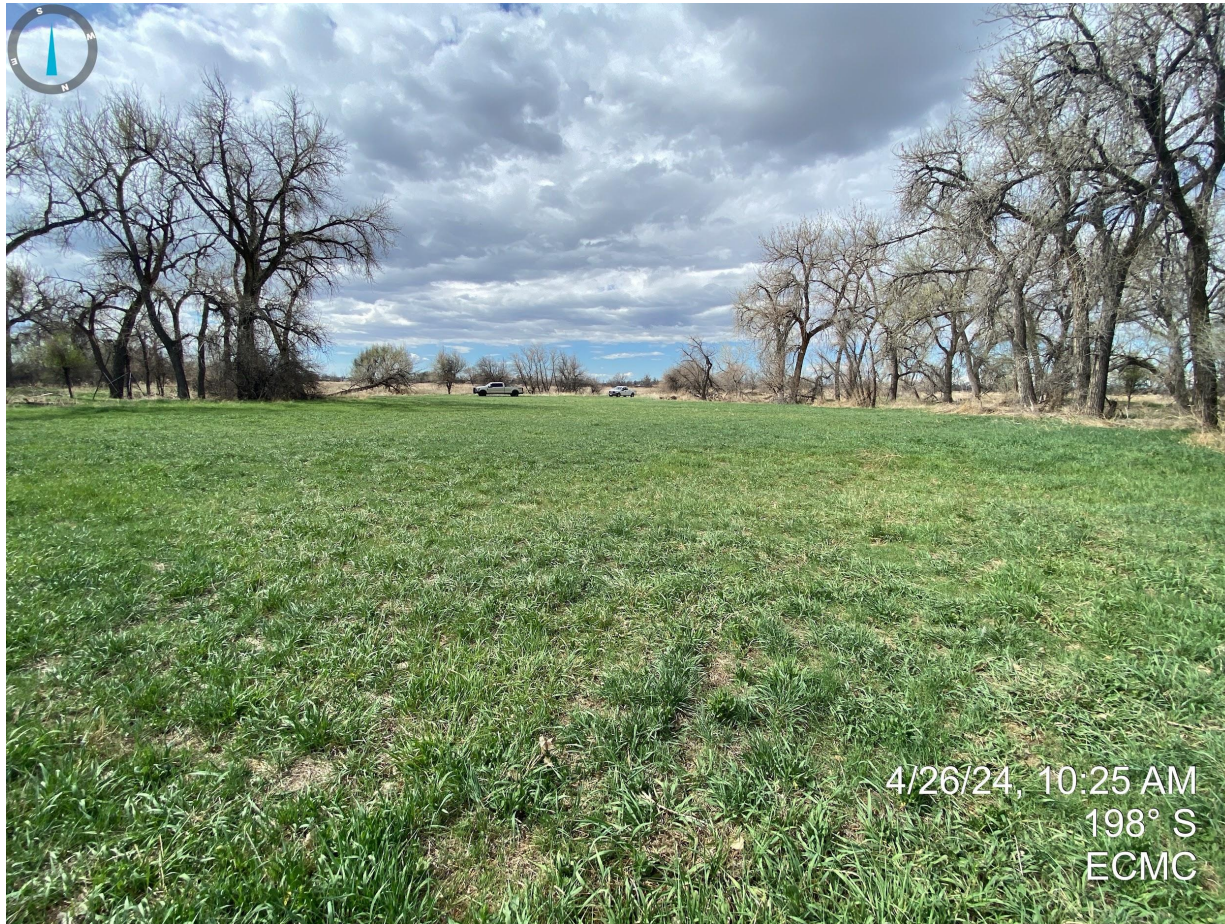
Photo 3. Facing south at the former well location.