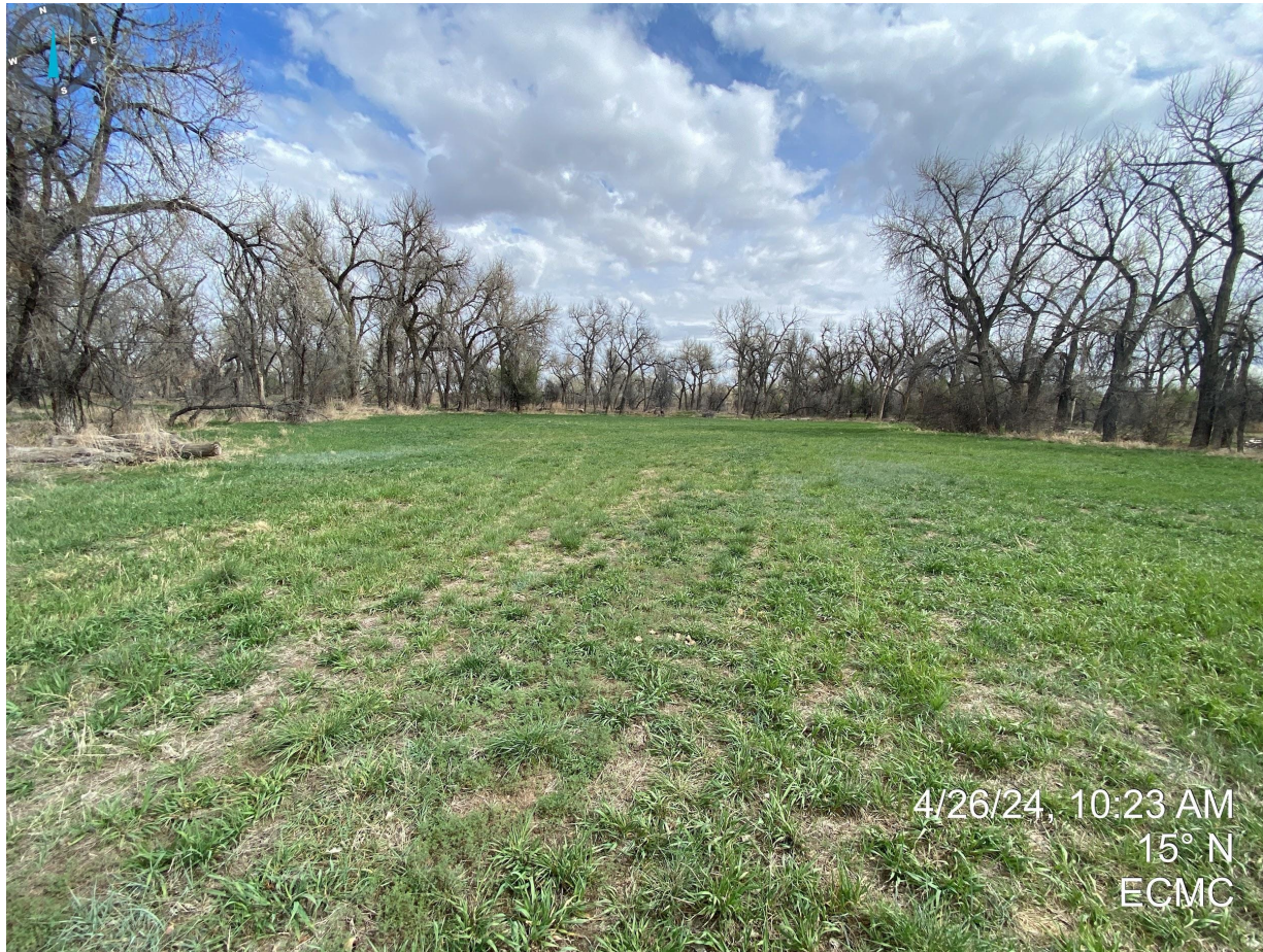
Photo 1. Facing north at the former well location. It appears that reclamation activities have been performed and the location is progressing towards Rule 1004 standards and regulations.