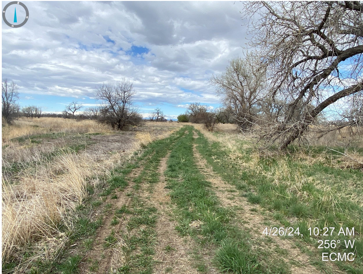
Photo 5. Facing west along the access road. Portions of the access road did not exist prior to oil and gas development. Refer to Photos 7 & 8 for additional information.