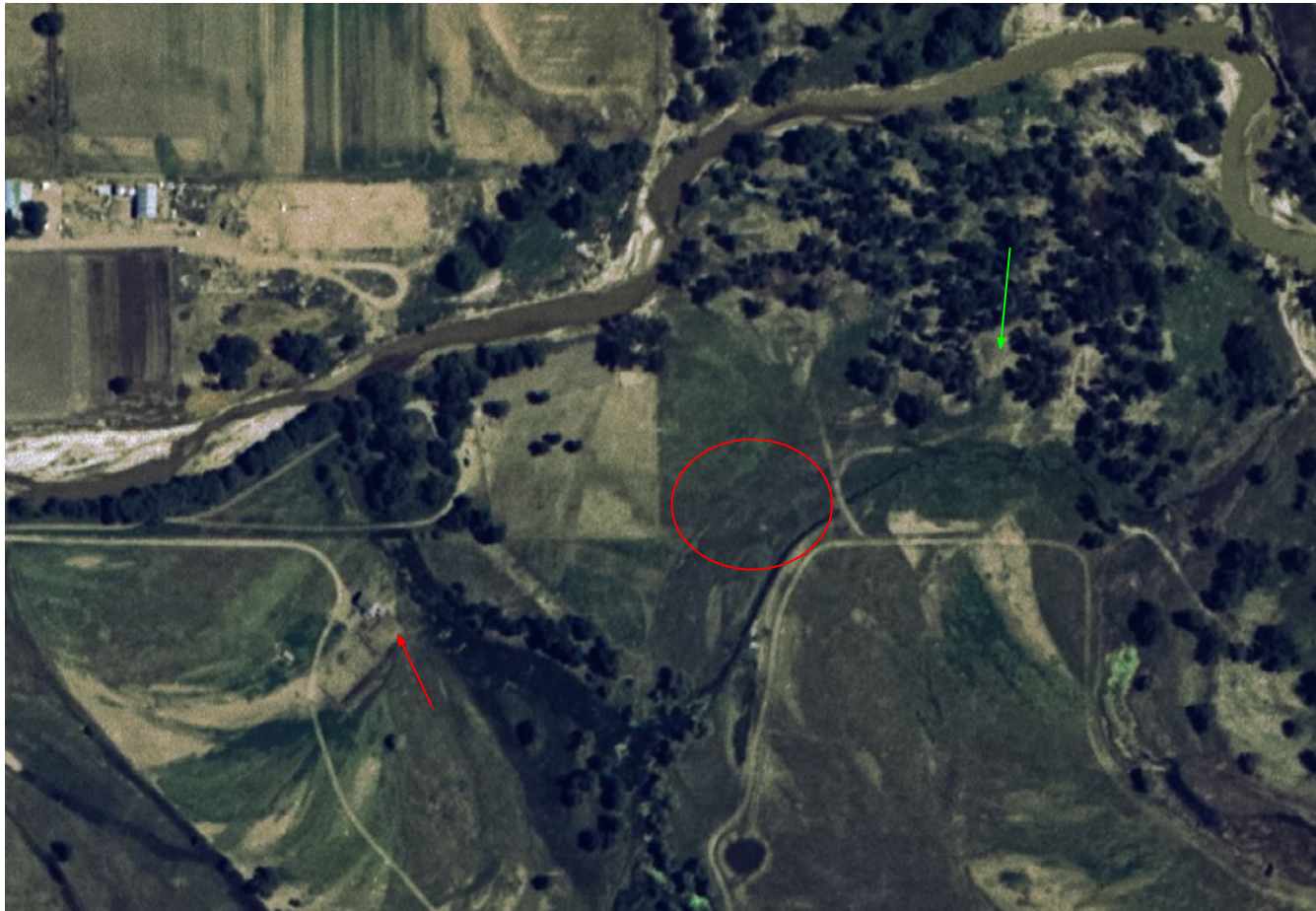
Photo 7. Historical imagery from 07/05/1978 illustrates that portions of the access road (outlined in red) did not exist prior to oil and gas development. Red arrow indicates a reference point for Photo 7 and Photo 8. Green arrow illustrates approximate location of Well API 123-14097 (not drilled at the time of this photo) for reference.