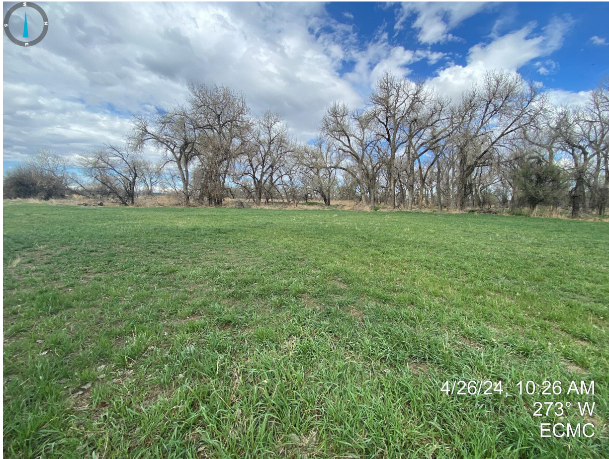
Photo 4. Facing west at the former well location.