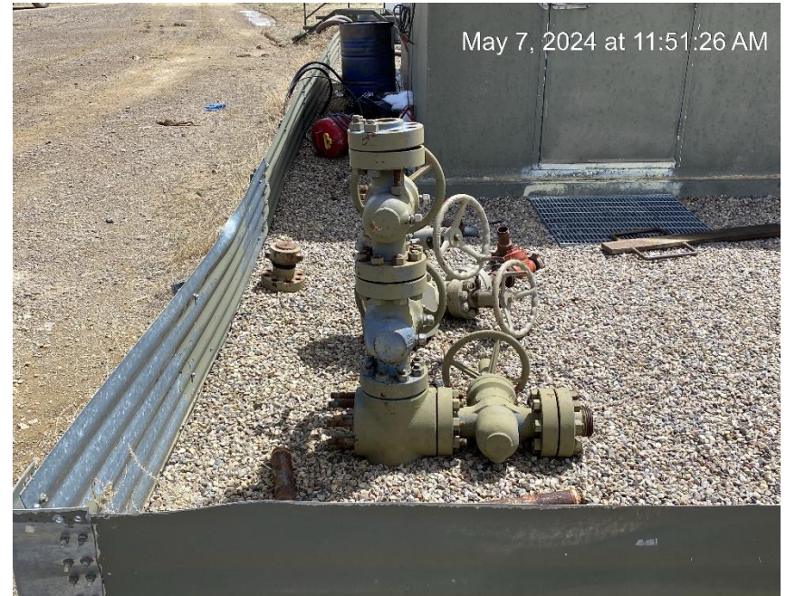
Debris. Unused equipment.