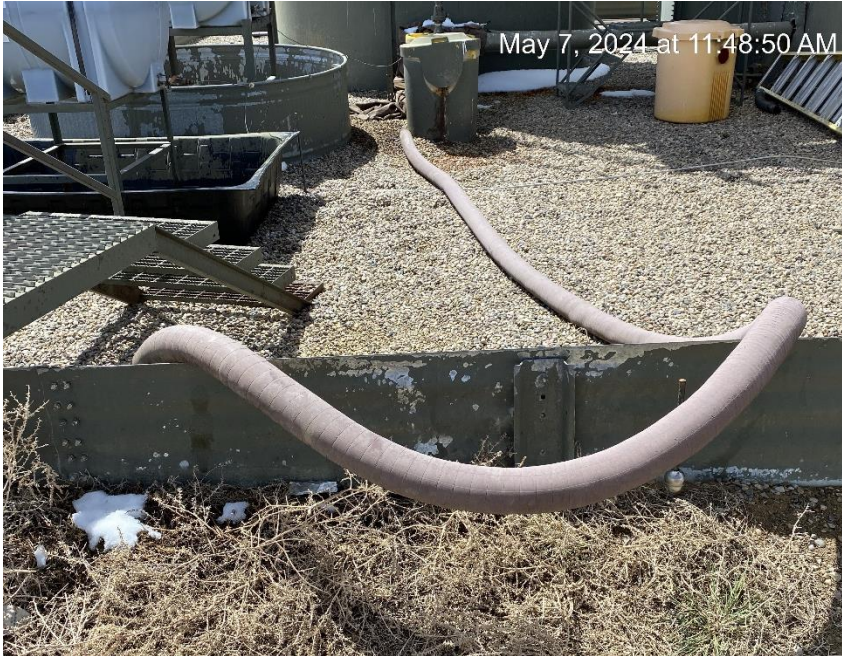
Debris. Unused equipment and supplies.