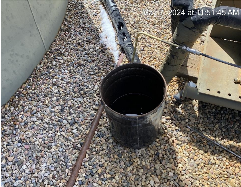
Debris. Open to wildlife