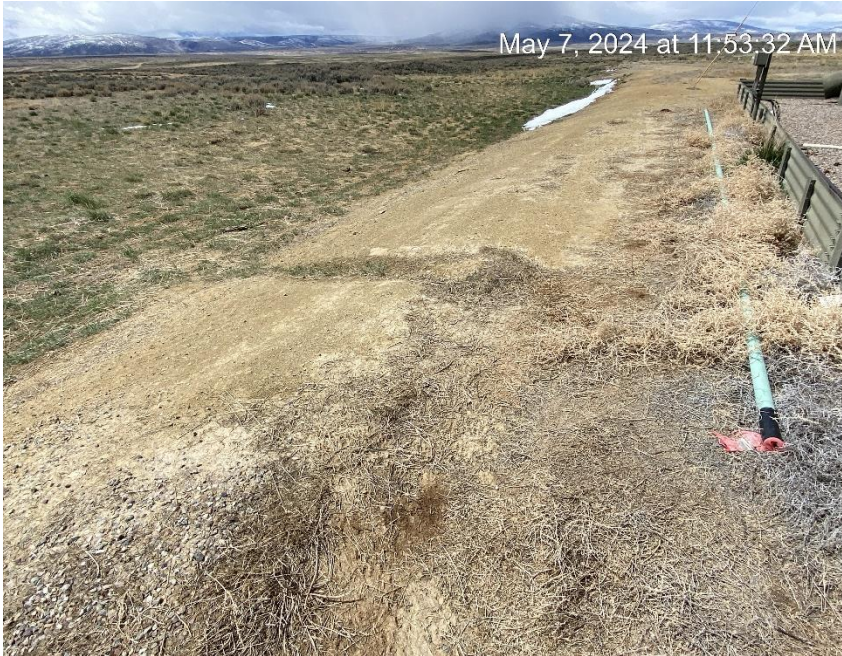
Erosion and sediment migration