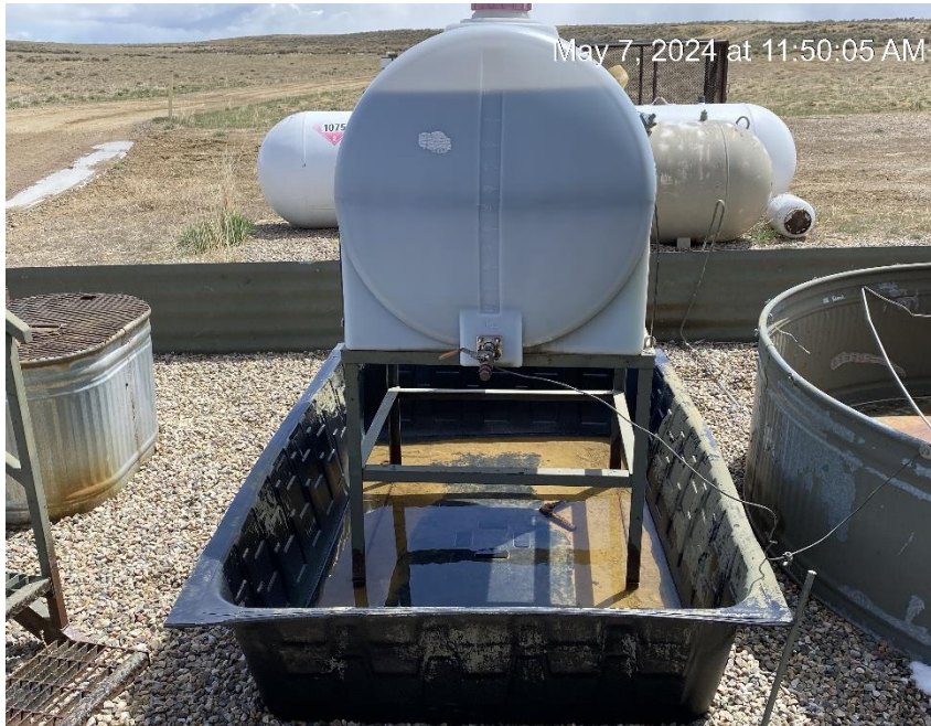
Unlabeled container. Unused equipment.