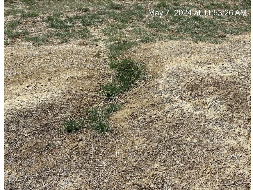
Erosion and sediment migration