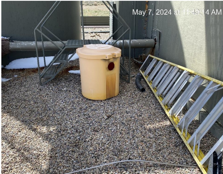
Debris. Unused equipment and supplies.