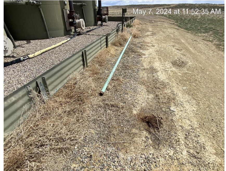
Storage of unused equipment and supplies.