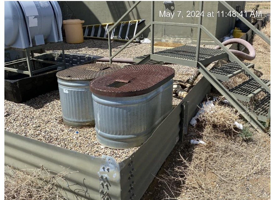
Debris. Unused equipment and supplies.