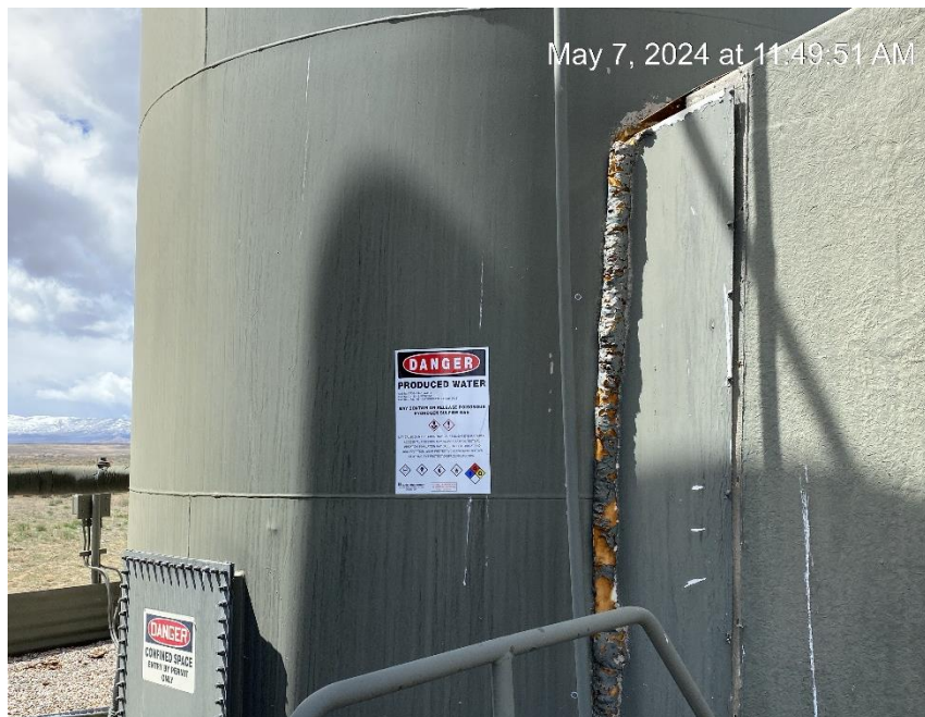
Tank label missing required information