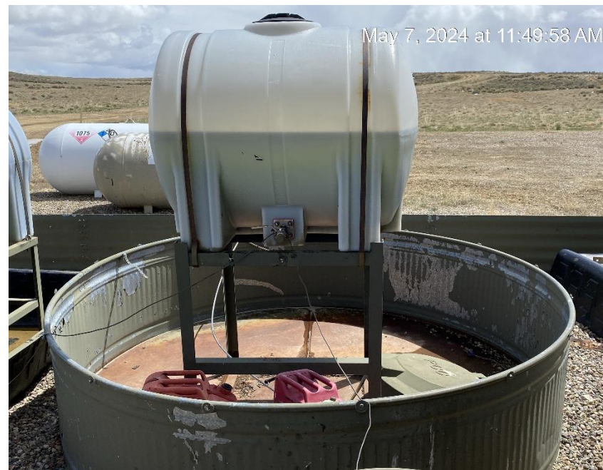
Unlabeled container. Unused equipment.