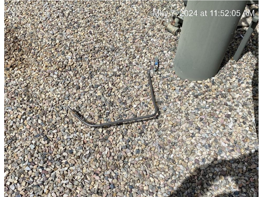
Pot draining directly on the ground