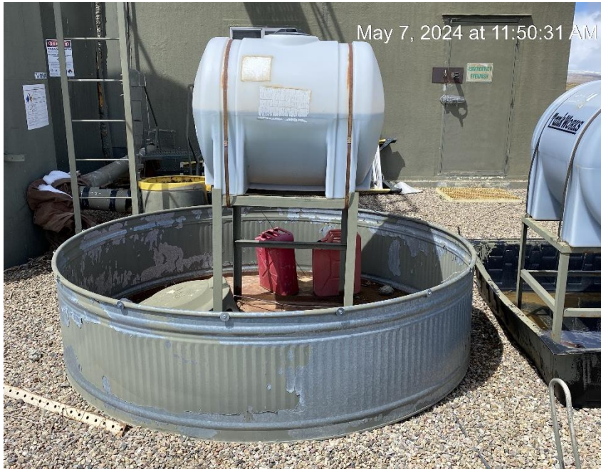
Debris. Containment open to wildlife