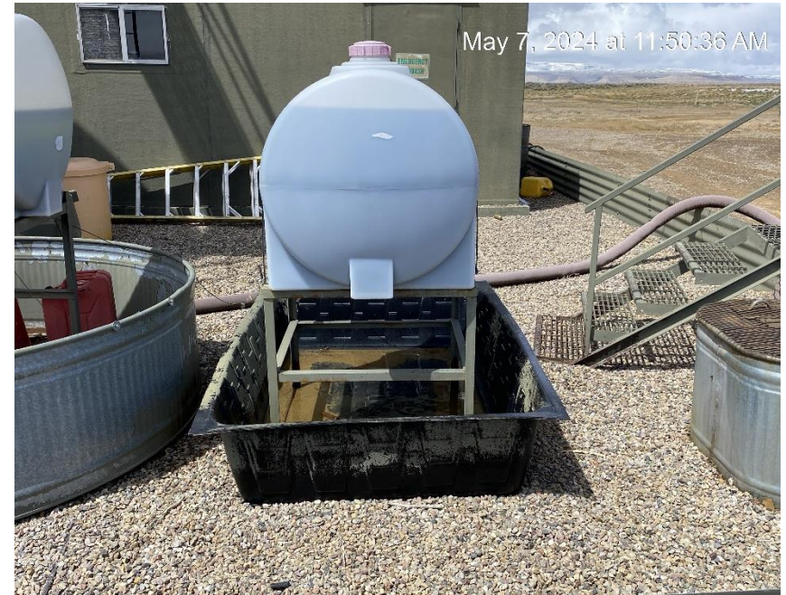
Containment open to wildlife