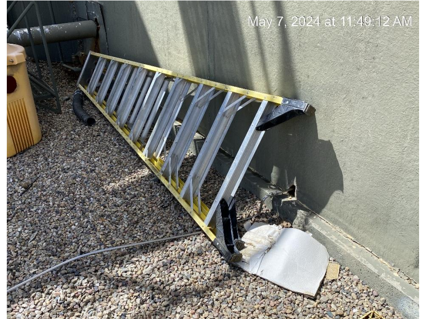
Debris. Unused equipment and supplies.