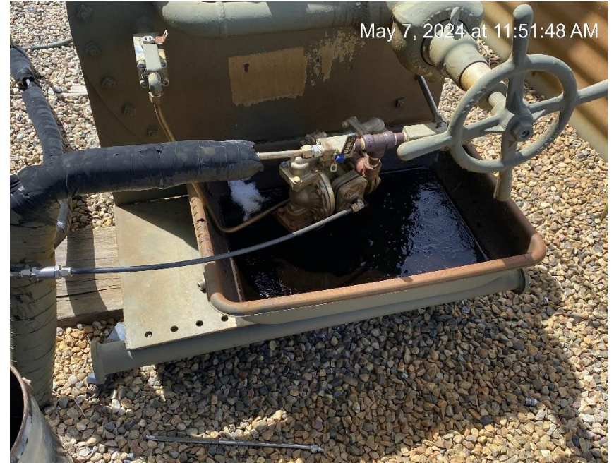
Open to wildlife