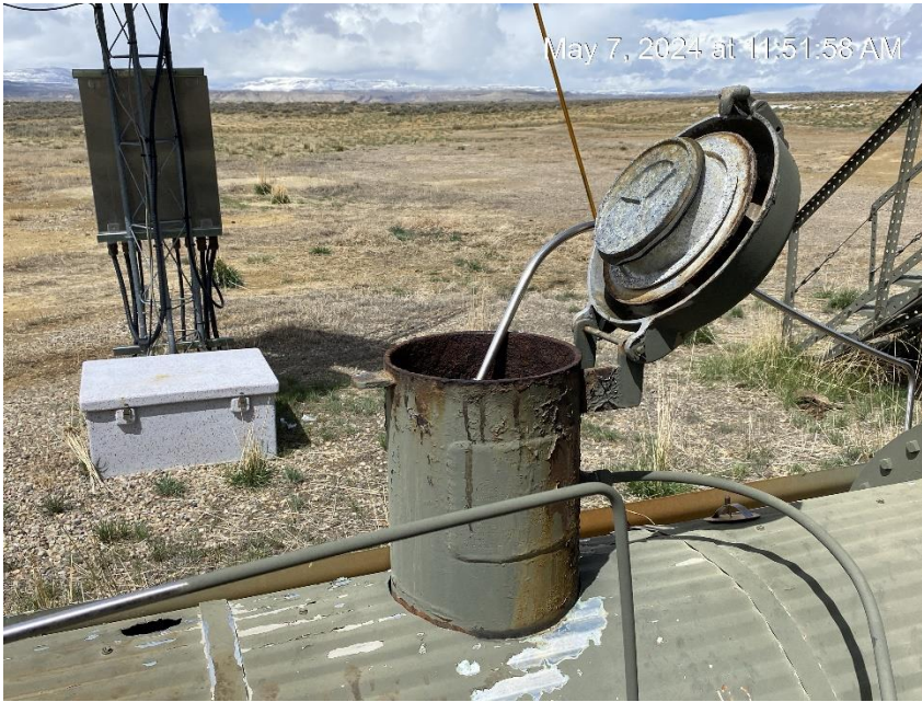
Open to wildlife