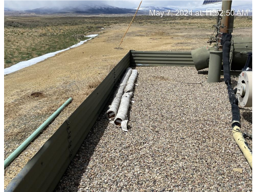
Storage of unused equipment and supplies.