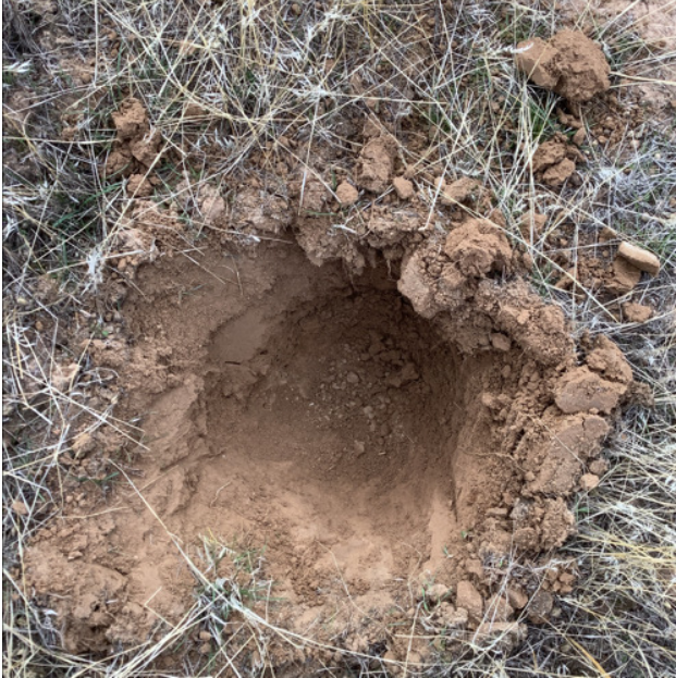
Fig. 4: 20231108-OUBG-(OP33-N)@1