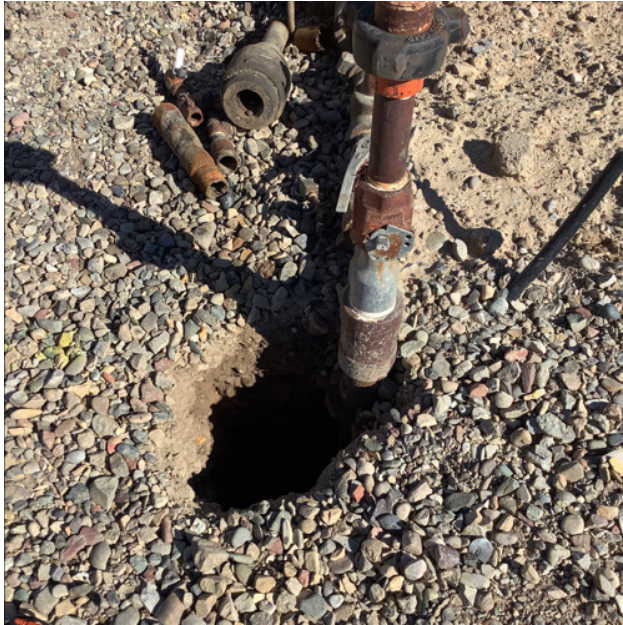
Fig. 1: 20231109-OP33-(FC-WH-Keinath 33-9)@5