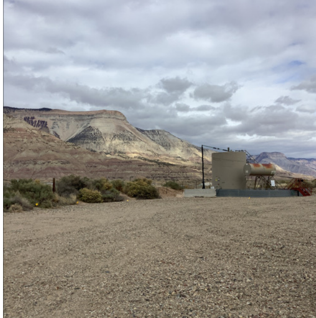
Fig. 5: North