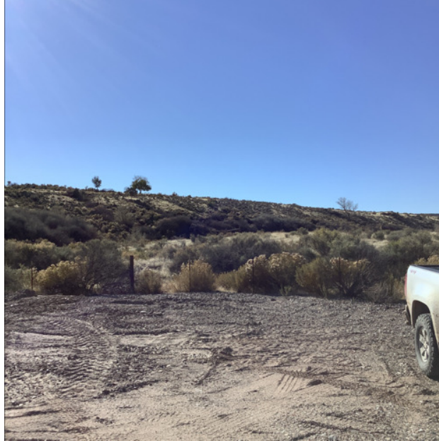
Fig. 5: South