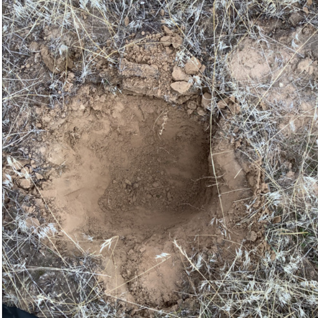
Fig. 1: 20231108-OUBG-(OP33-S)@1