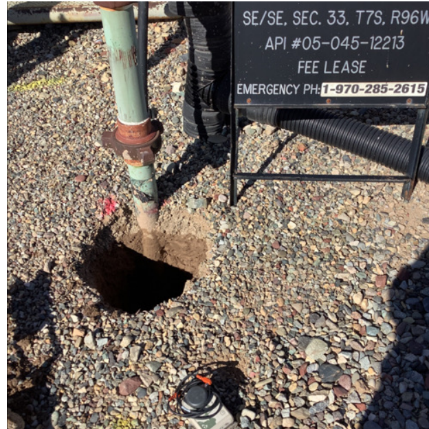
Fig. 2: 20231109-OP33-(FC-FL)@4