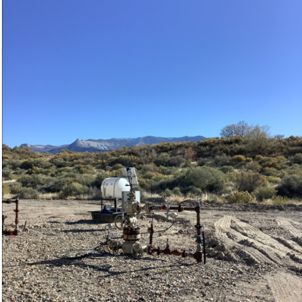
Fig. 4: East