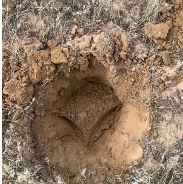
Fig. 2: 20231108-OUBG(OP33-E)@1