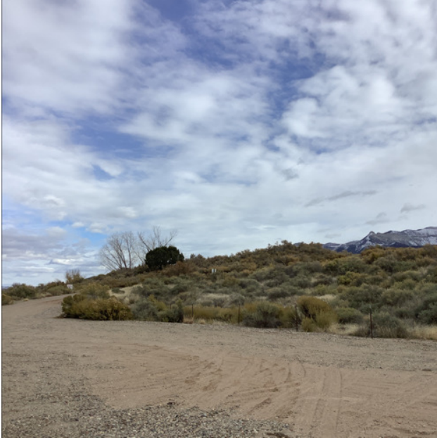
Fig. 7: East