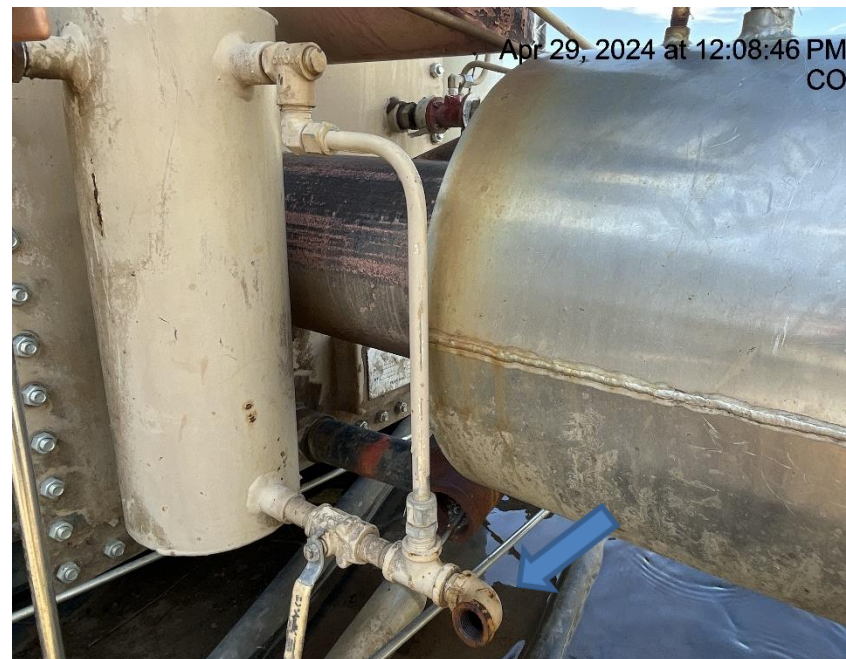
Photo # 5317 PRV vent line does not comply with CECMC pressure safety device rules & general safety rules