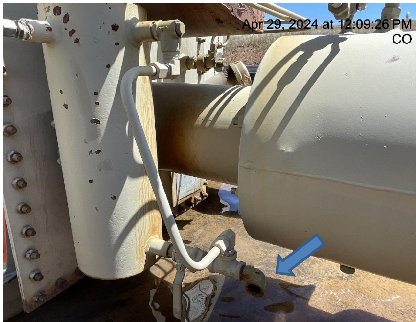
Photo # 5316 PRV vent line does not comply with CECMC pressure safety device rules & general safety rules