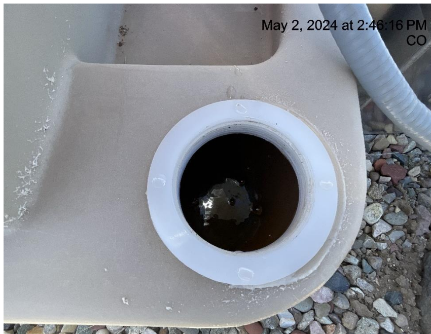
Photo # 5659 Failure to maintain chemical BMP/chemical containment approximately 3/4 full of fluid/BMP insufficient to contain possible spill.