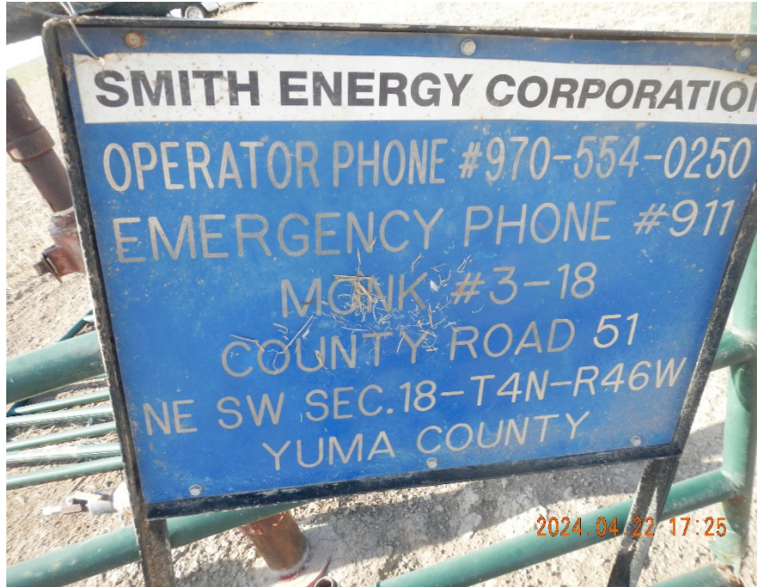
3. Lease sign at well location. Sign was down on ground at time of inspection.