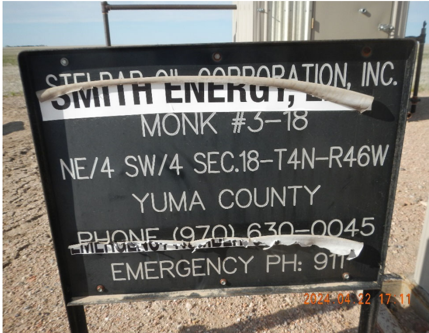
1. Lease sign at battery.