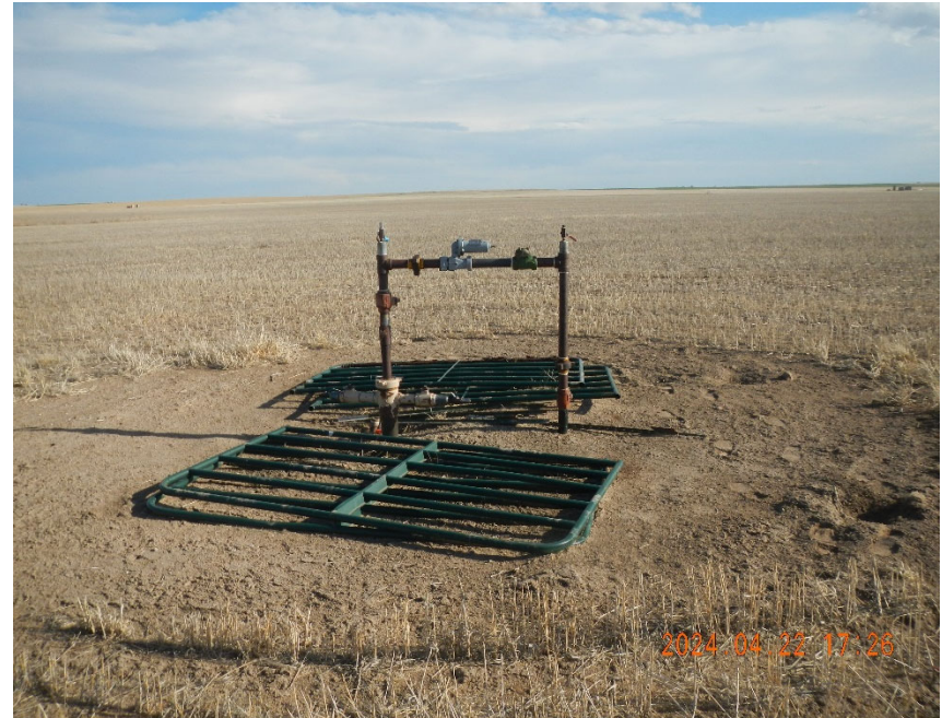
4. Well location overview. Wellhead fencing was down at time of inspection.