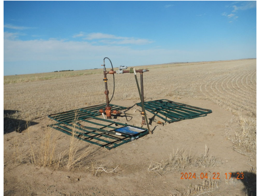
4. Well location overview. Fencing around is down.