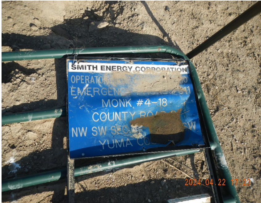
3. Lease sign at well location. Sign is down.