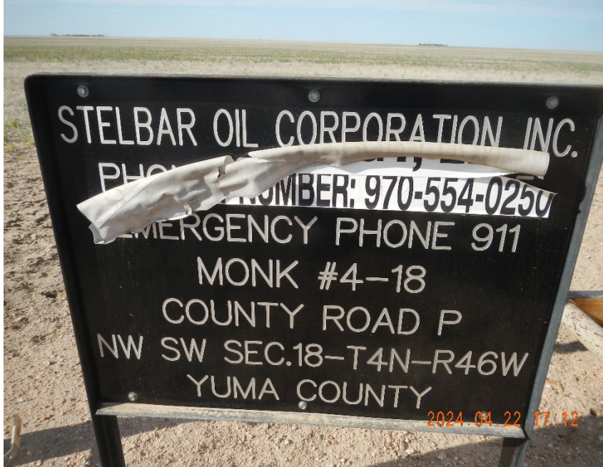
1. Lease sign at battery.