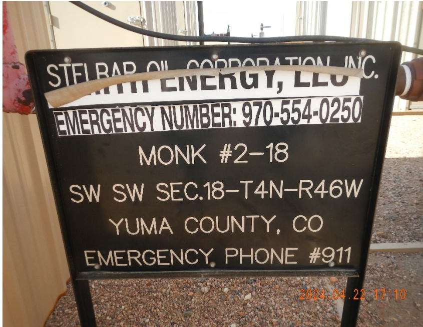
1. Lease sign at battery.