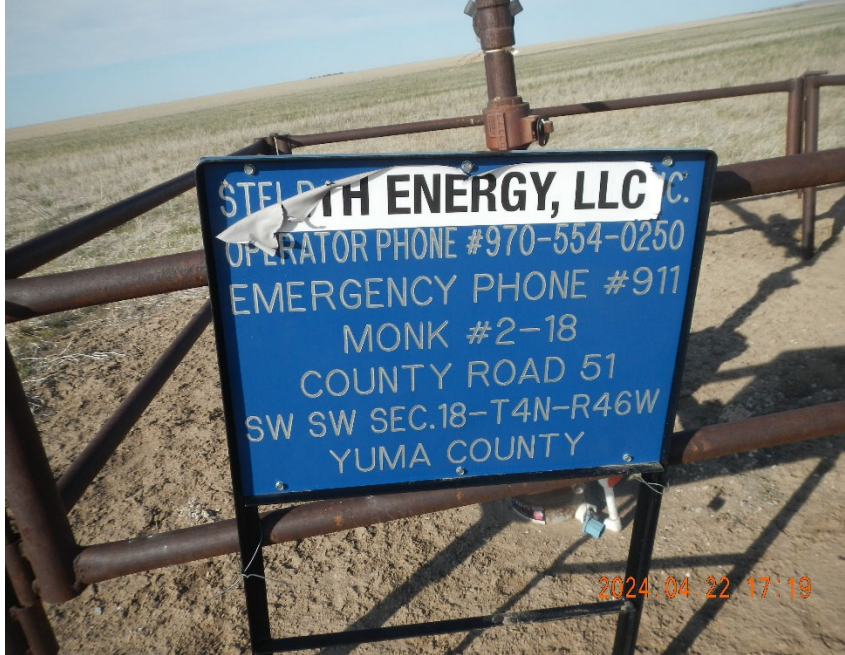
3. Lease sign at well location.