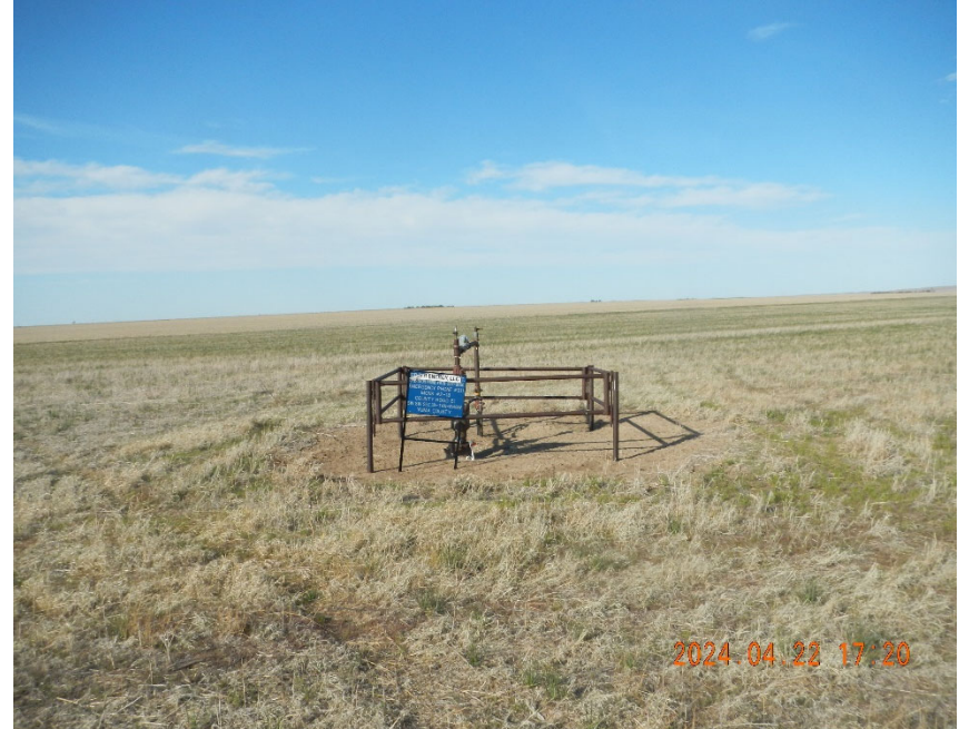
4. Well location overview.