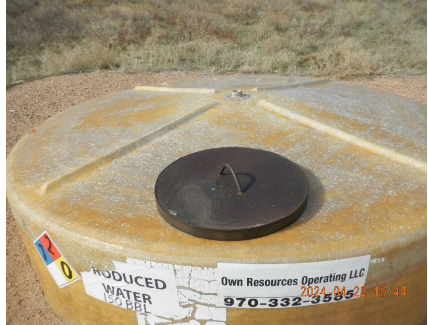
4. Replaced produced water tank hatch.