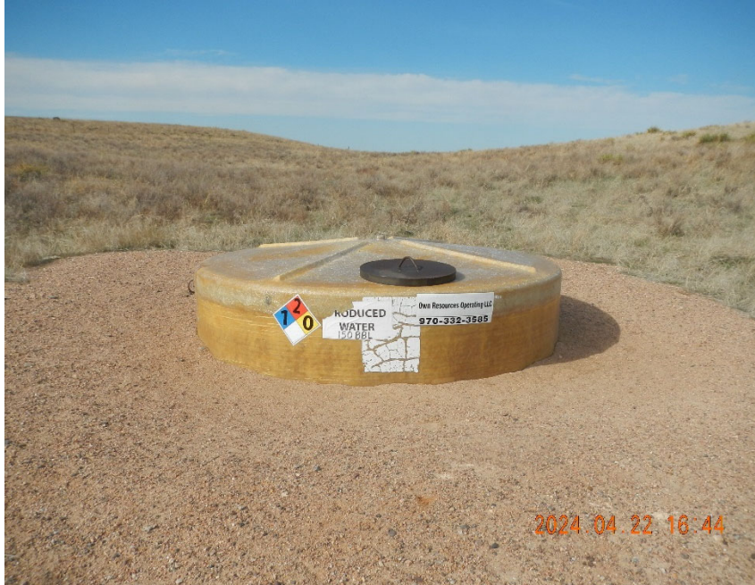
3. Produced water tank and signage.