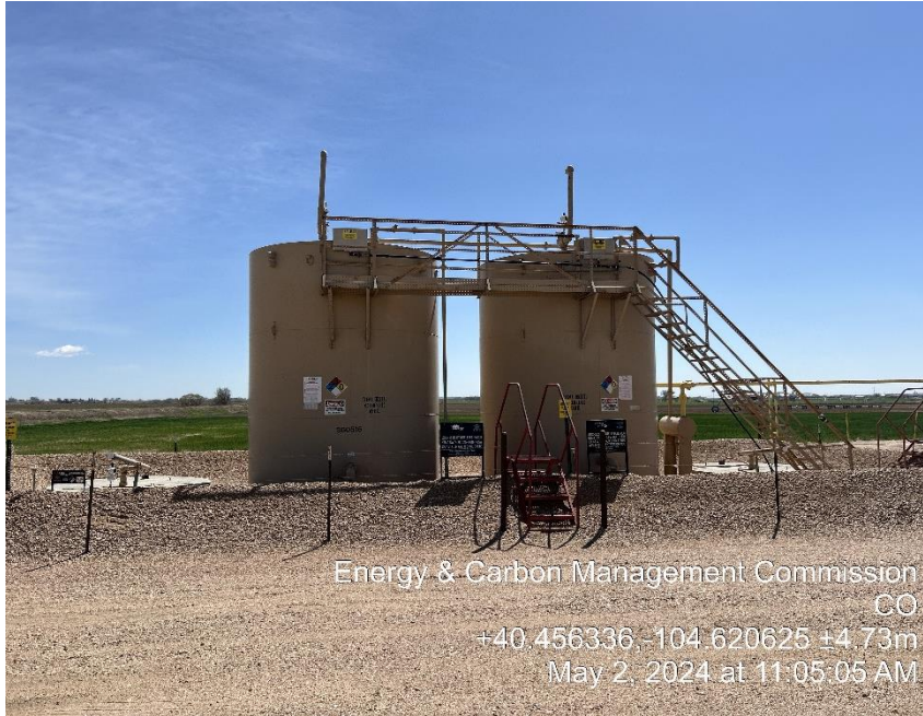
Photo 3 Tank Battery