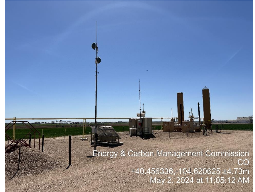
Photo 4 Separator/ECD