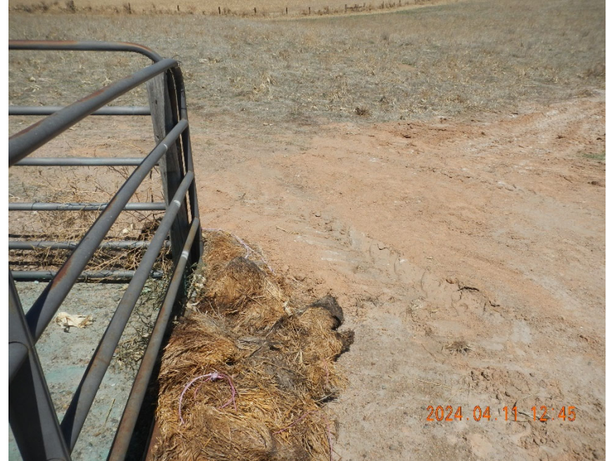
4. View of straw bales and mulch outside fencing.