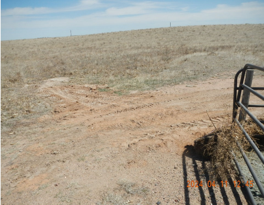
3. View looking down grade at repaired erosion channeling.