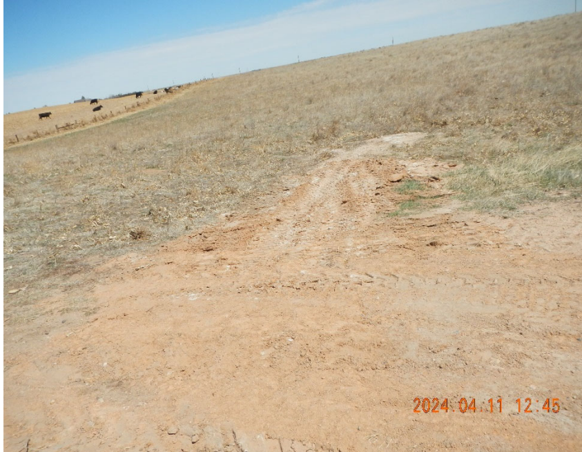
5. View of repaired erosion looking down slope from well.