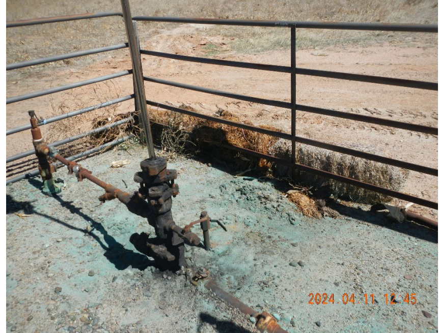
2. View of wellhead with straw bales visible at fencing.